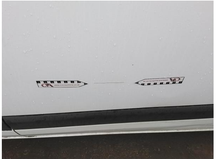
4: Qtr Panel nsr Scratched Over 25mm Thru Paint