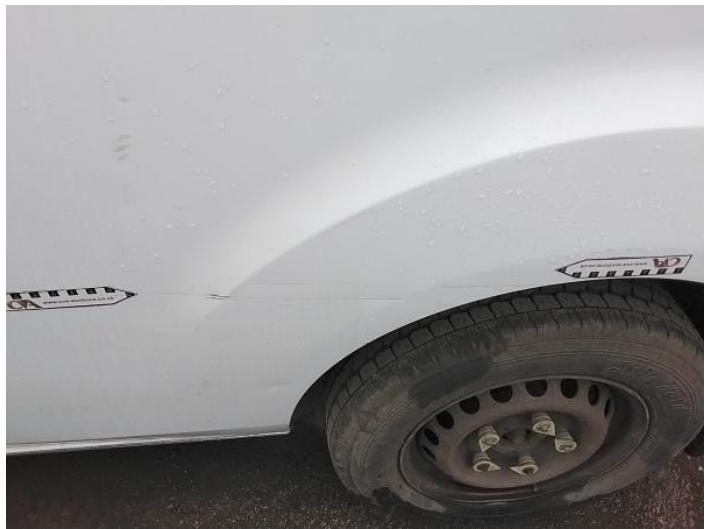
6: Qtr Panel nsr Dented Over 30mm