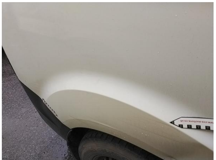
8: Qtr Panel osr Scratched Over 25mm Thru Paint