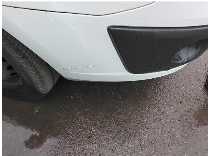
12: Bumper Front Scratched Over 100mm Thru Paint