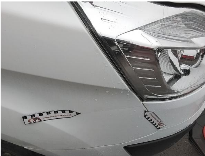
11: Wing osf Scratched Over 25mm Thru Paint