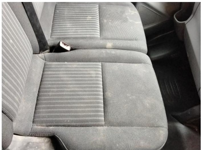
14: Seat Base Cover nsf Soiled Heavy