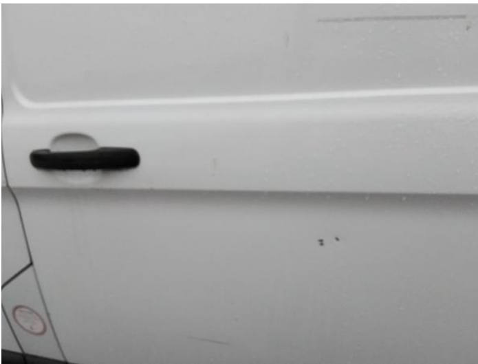
5: Qtr Panel nsr Chipped Multiple Chips