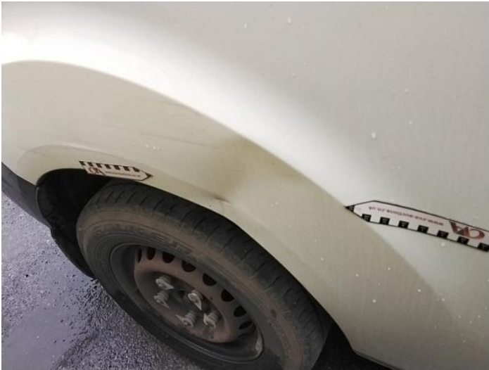
9: Qtr Panel osr Dented Over 30mm