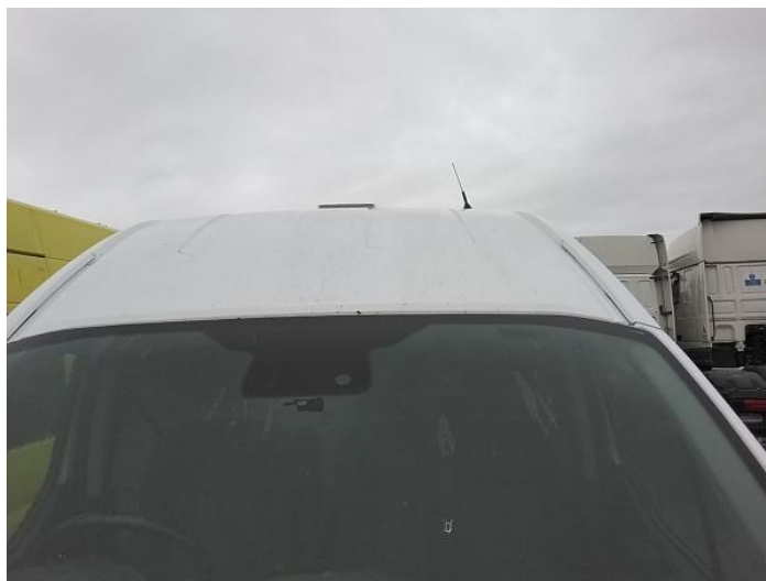
2: Roof Chipped Multiple Chips