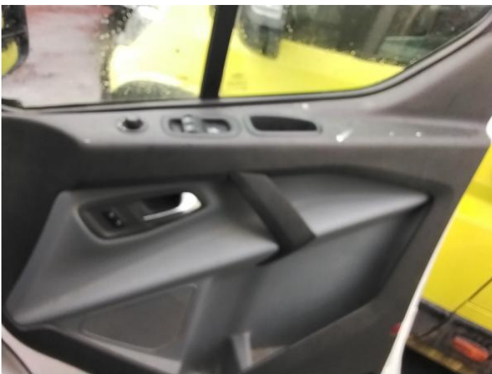
13: Door Pad osf Soiled Heavy