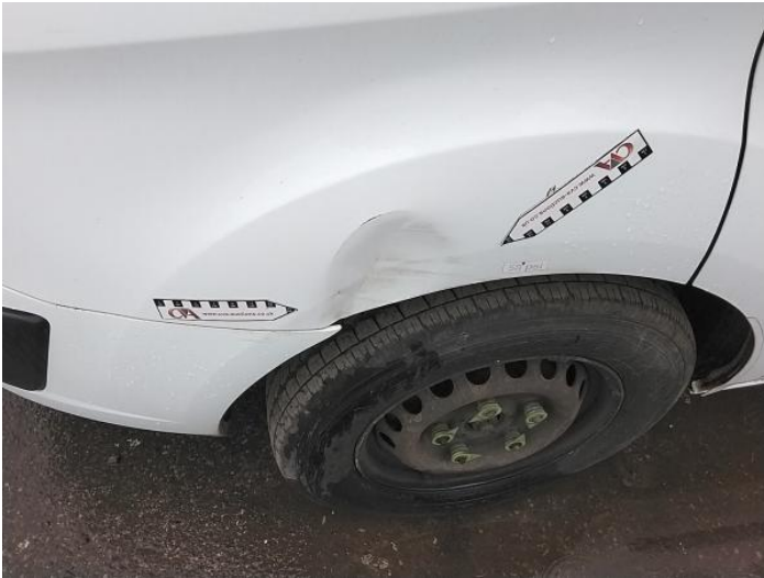
3: Wing nsf Dented Over 30mm