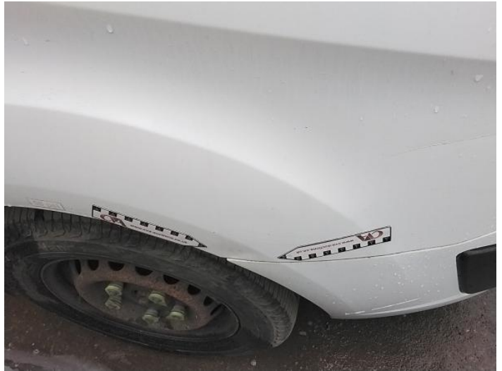
10: Wing osf Dented Over 30mm