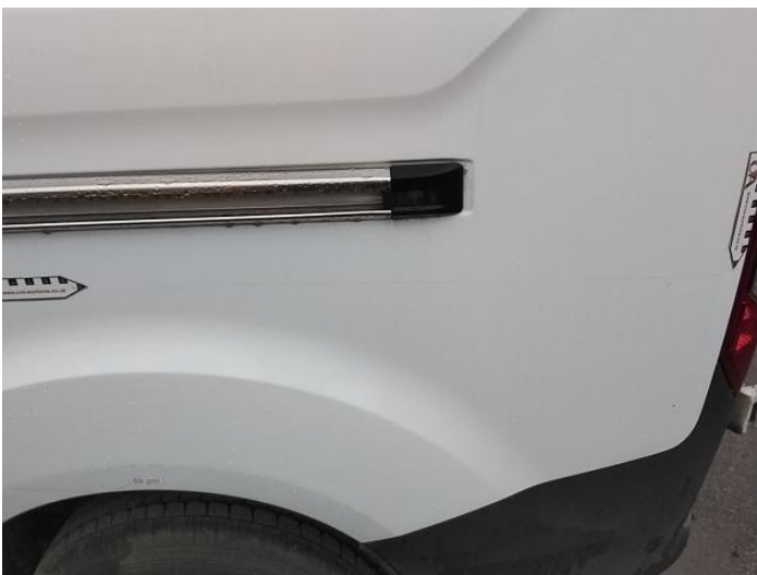
7: Qtr Panel nsr Scratched Over 25mm Thru Paint