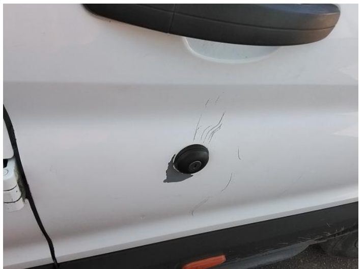
8: Door osf Scratched Over 25mm Thru Paint