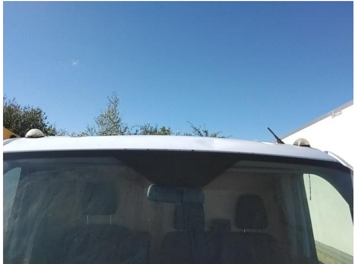
4: Roof Chipped Multiple Chips