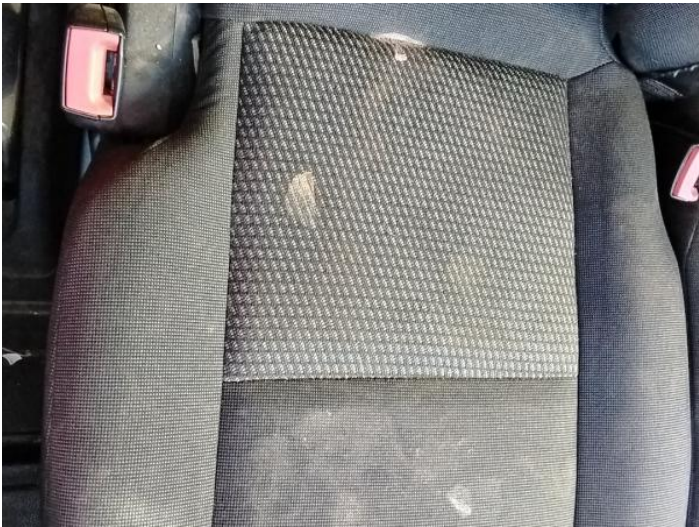
11: Seat Base Cover nsf Soiled Heavy