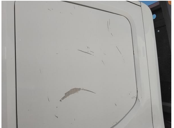
6: Door Moulding nsr Scratched (Painted) Over 25mm Thru Paint