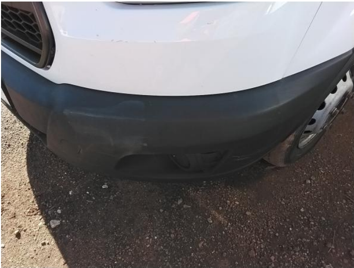
5: Bumper Front Scratched Over 100mm Thru Paint