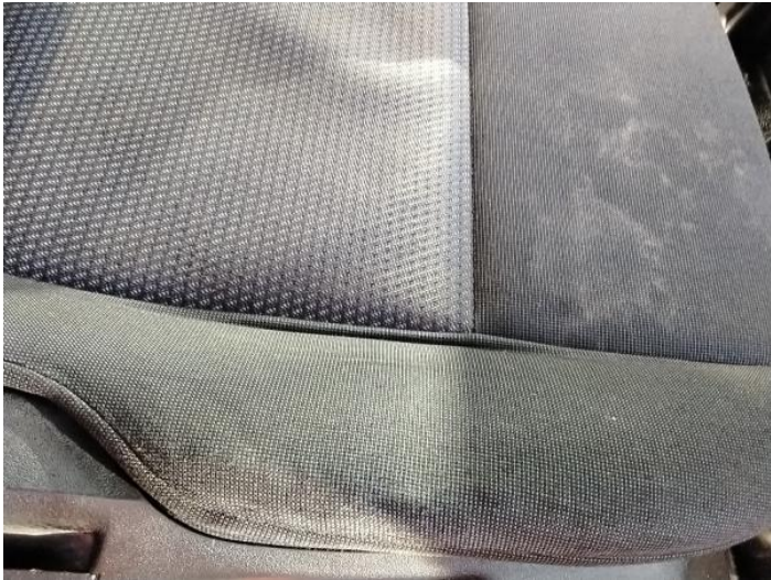
10: Seat Base Cover osf Soiled Heavy