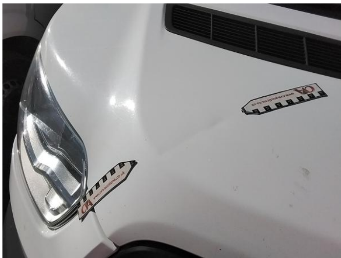
1: Bonnet Dented Over 30mm