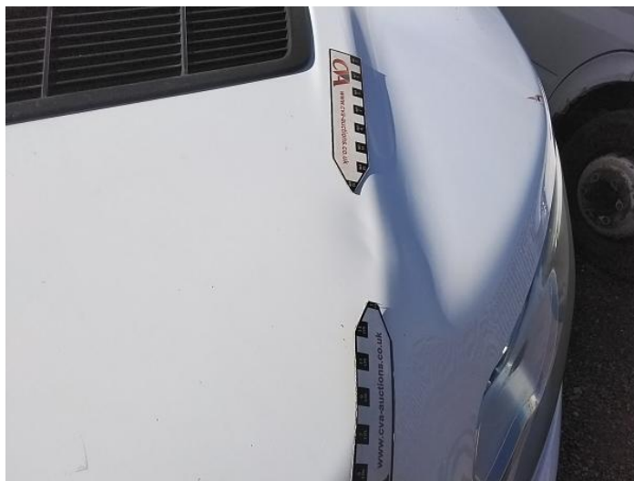
2: Bonnet Dented Over 30mm