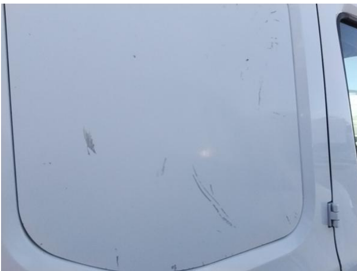
7: Door Moulding osr Scratched (Painted) Over 25mm Thru Paint