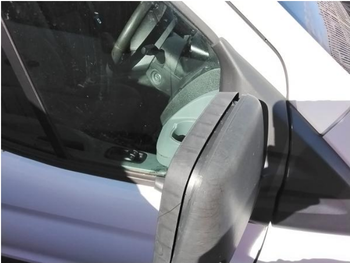
9: Door Mirror Assy osf Broken Replace