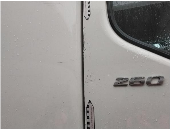
5: Door osf Scratched Over 25mm Thru Paint