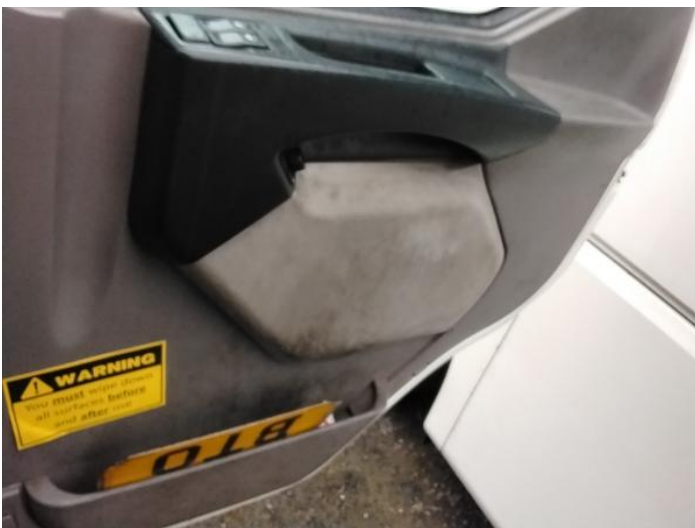
7: Door Pad osf Soiled Heavy