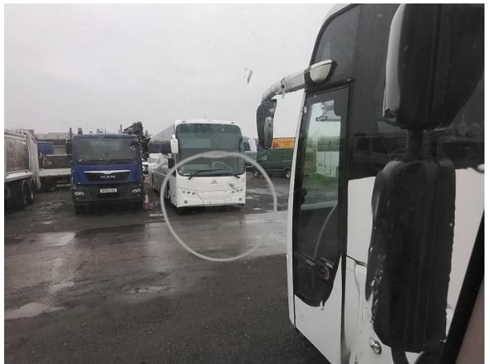
6: Screen Front Cracked Replace