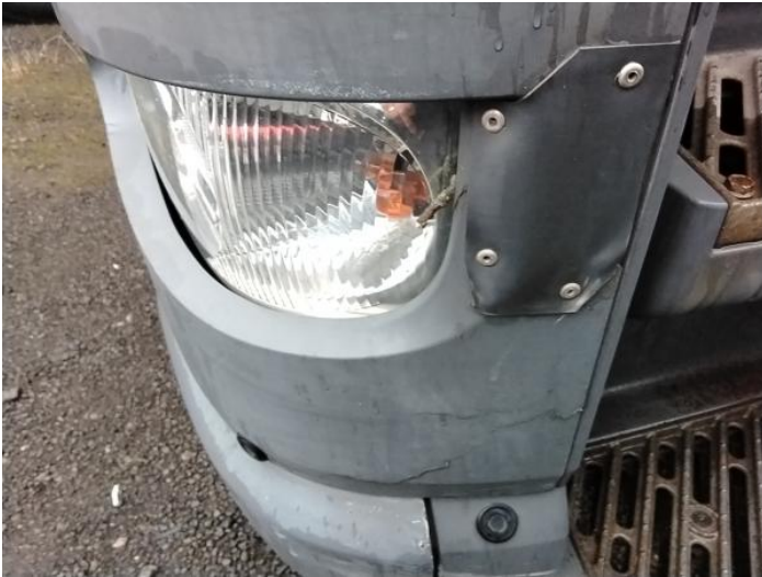
3: Panel Front Cracked Replace