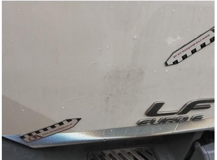
4: Door osf Dented With Paint Damage