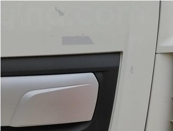
3: Bonnet Scratched Over 25mm Thru Paint