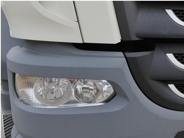
2: Other N/A N/A