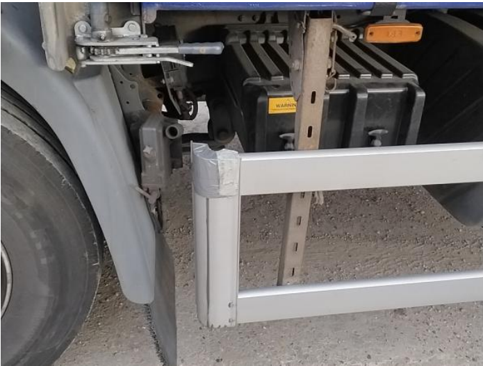
6: Other N/A N/A