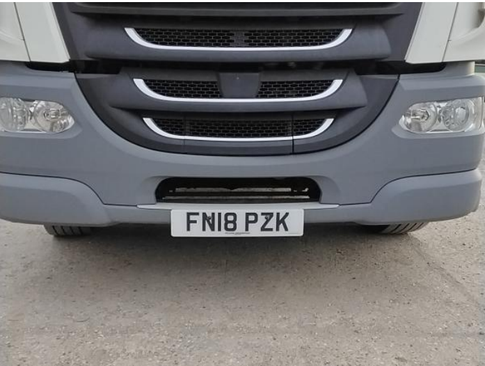
1: Bumper Front Chipped Multiple Chips