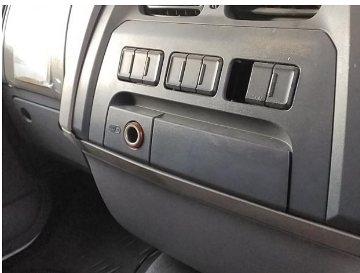
11: Other N/A N/A