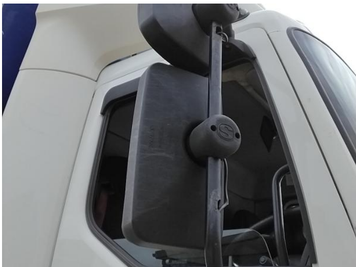
9: Door Mirror Assy osf Scuffed (Unpainted) UpTo 100mm