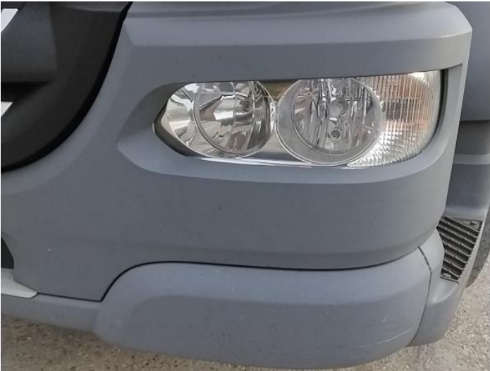
4: Other N/A N/A