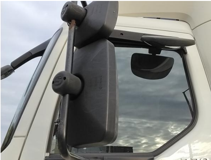
5: Door Mirror Assy nsf Scuffed (Unpainted) UpTo 100mm