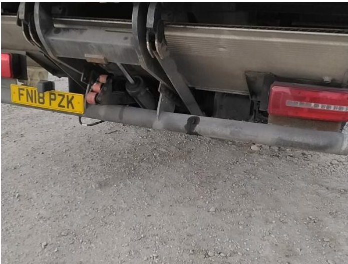
7: Bumper Rear Dented Between 10mm + 30mm