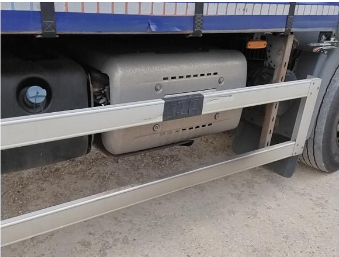
8: Other N/A N/A