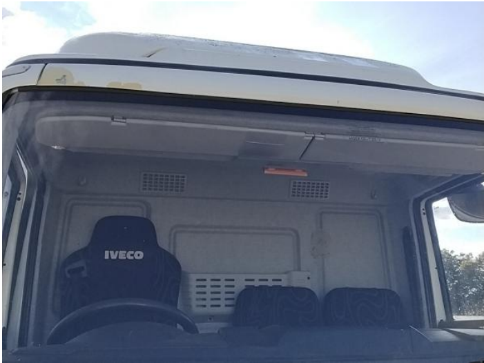
16: Other N/A N/A