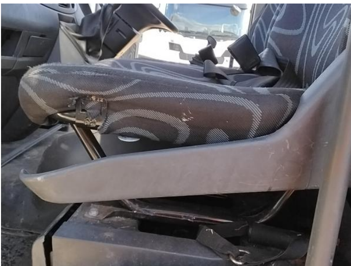
7: Other N/A N/A