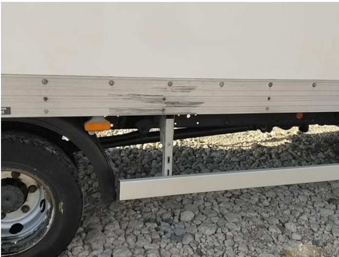
13: Other N/A N/A