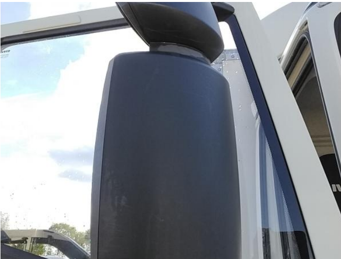
14: Door Mirror Assy osf Scuffed (Unpainted) UpTo 100mm