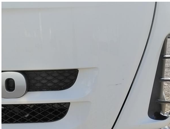
2: Bonnet Scratched UpTo 25mm Not Thru Paint