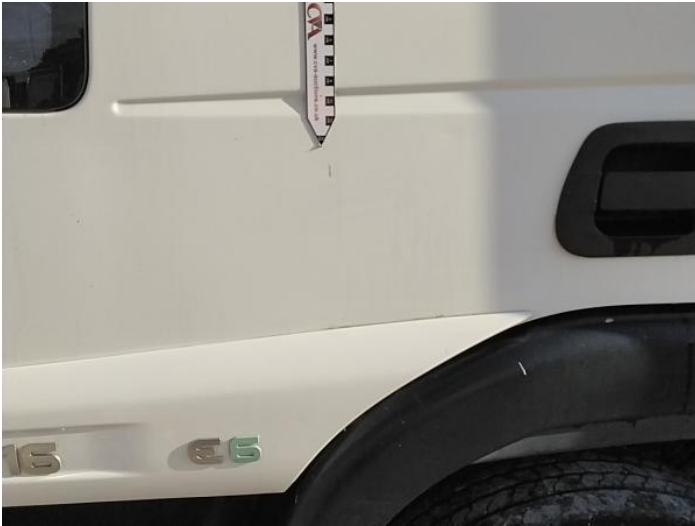
9: Door nsf Scratched UpTo 25mm Thru Paint