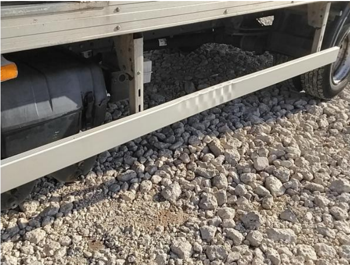
10: Other N/A N/A