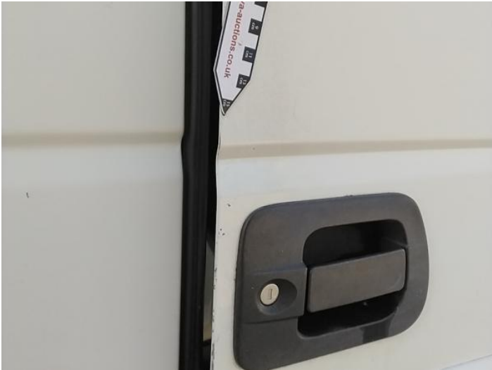
15: Door osf Chipped Edge Chip