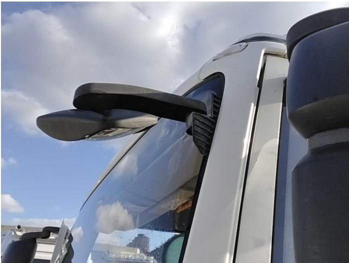
5: Door Mirror Assy nsf Missing Replace