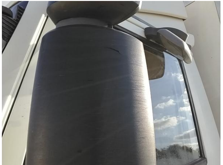
6: Door Mirror Assy nsf Scuffed (Unpainted) UpTo 100mm