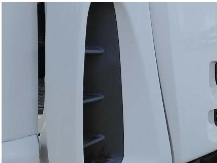
1: Wing osf Scratched UpTo 25mm Thru Paint