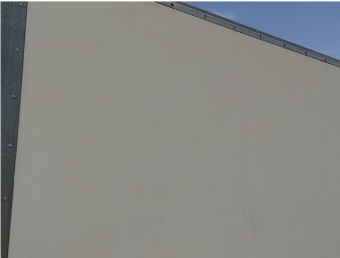
12: Qtr Panel nsr Scratched Over 25mm Thru Paint