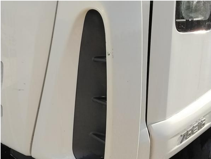
3: Wing nsf Scratched UpTo 25mm Not Thru Paint