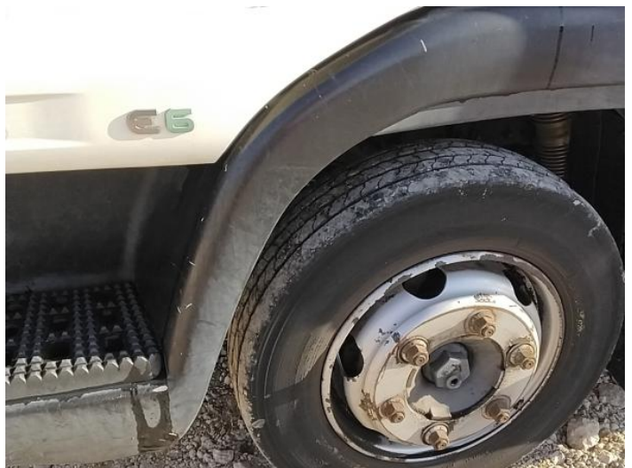
8: Other N/A N/A