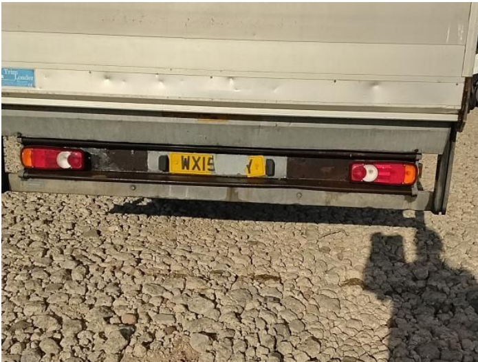
11: Bumper Rear Rusted Over 5mm