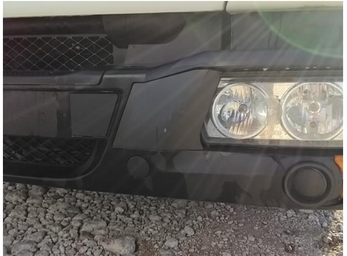
4: Bumper Front Moulding Scuffed (Unpainted) UpTo 100mm