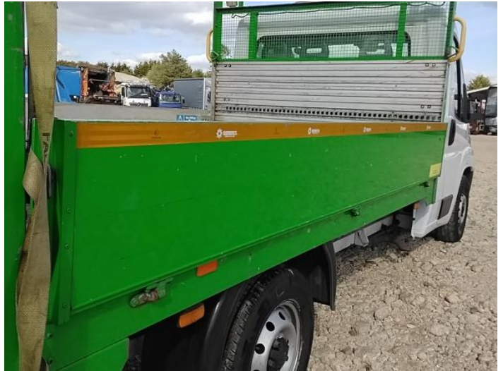
10: Other N/A N/A