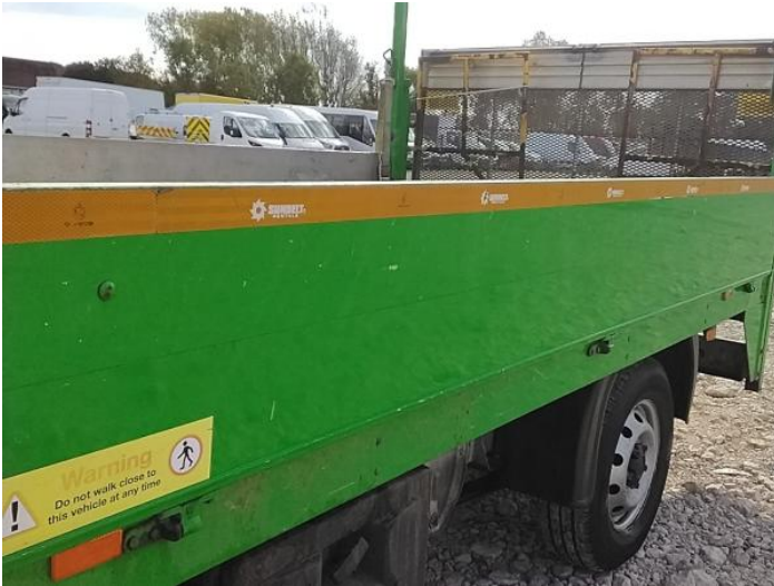
9: Other N/A N/A