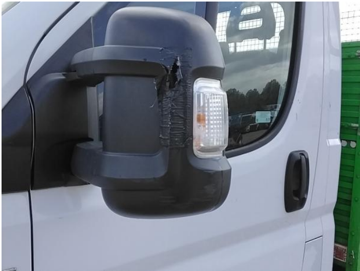
6: Door Mirror Assy nsf Broken Replace