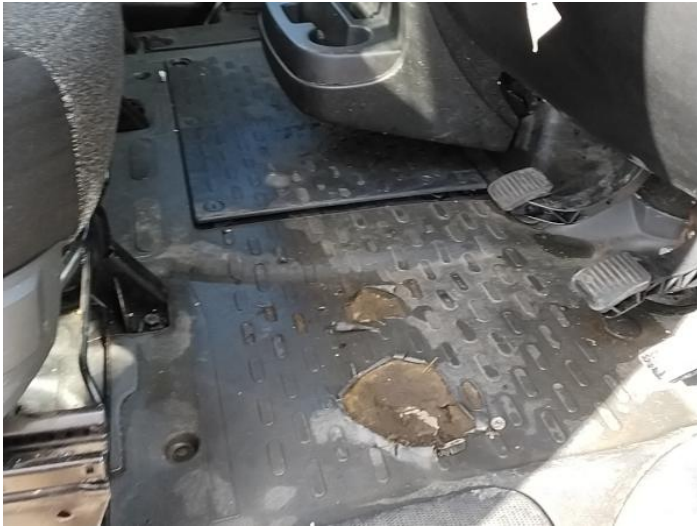
16: Carpets Front Holed Over 3mm