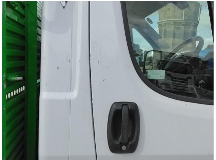
12: Door osf Scratched Over 25mm Thru Paint