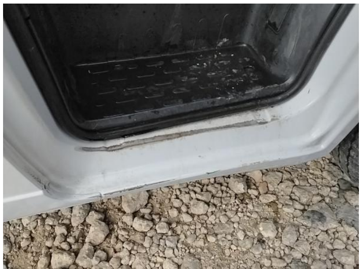
14: Other N/A N/A