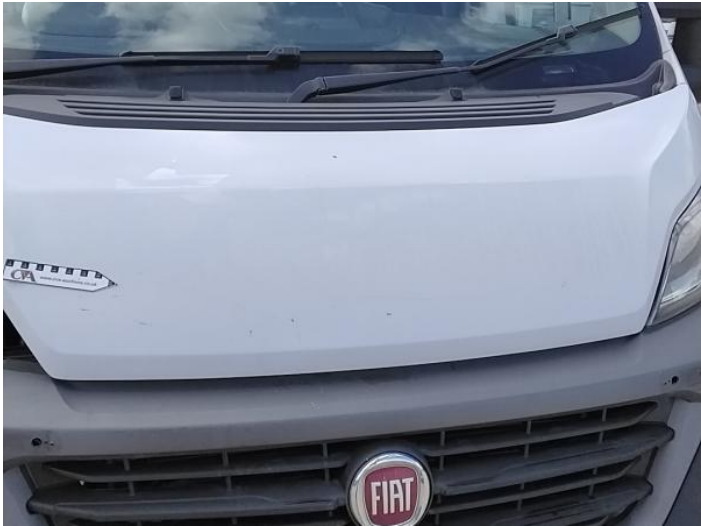
4: Bonnet Scratched Over 25mm Thru Paint