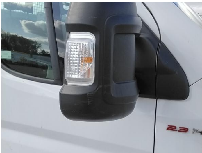
13: Door Mirror Assy osf Scuffed (Unpainted) UpTo 100mm