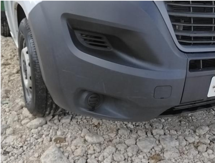
3: Bumper Front Moulding Scuffed (Unpainted) UpTo 100mm