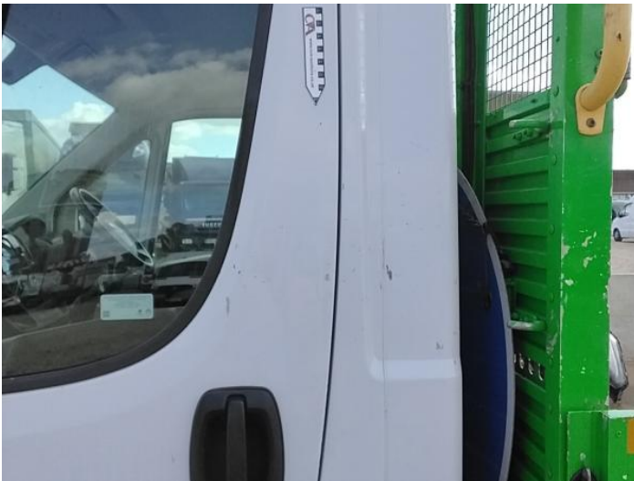
7: Door nsf Scratched Over 25mm Thru Paint