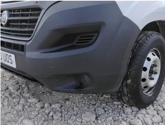
5: Bumper Front Moulding Scuffed (Unpainted) UpTo 100mm