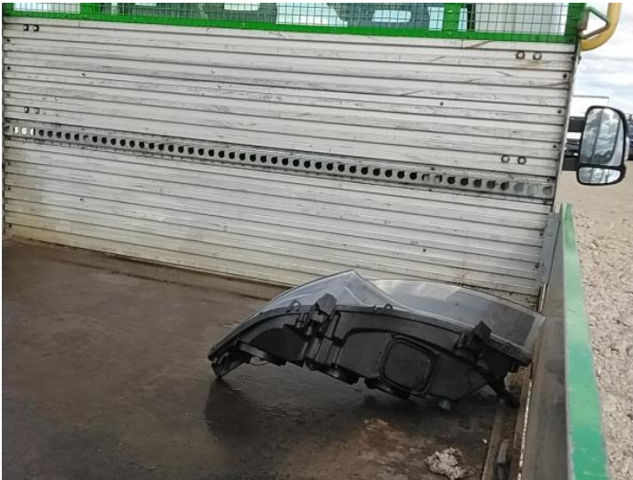
11: Other N/A N/A