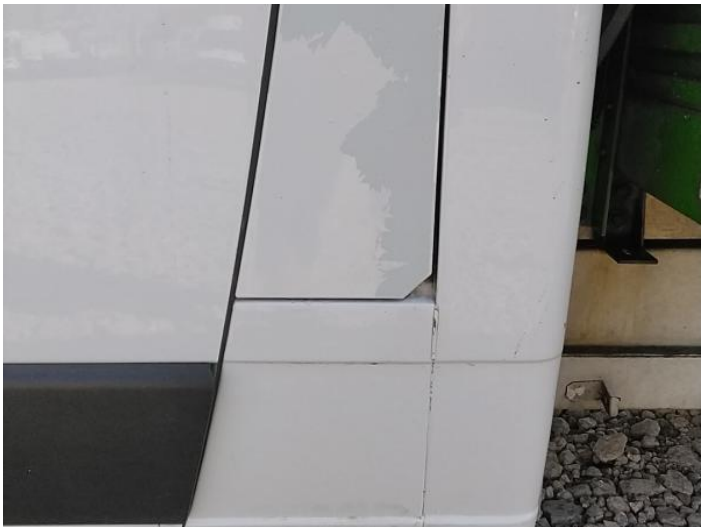
8: Other N/A N/A