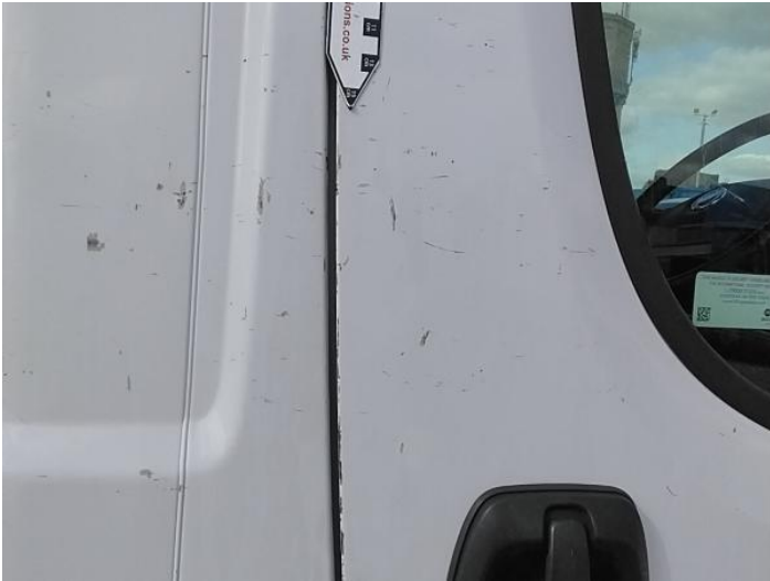
15: Door osf Chipped Edge Chip