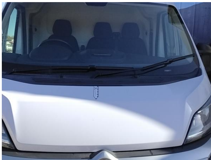
2: Bonnet Chipped Multiple Chips