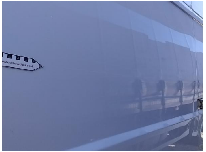
4: Door nsr Scratched Over 25mm Not Thru Paint