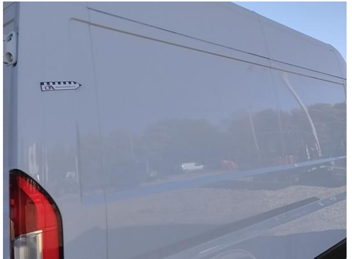
6: Qtr Panel osr Scratched Over 25mm Not Thru Paint