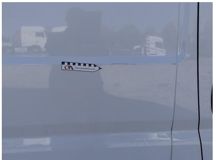
8: Qtr Panel osr Dented With Paint Damage