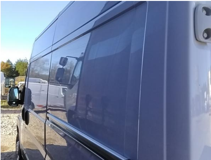
5: Qtr Panel nsr Scratched Over 25mm Not Thru Paint