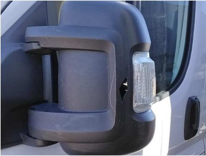
3: Door Mirror Assy nsf Broken Replace