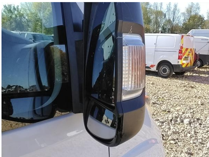
9: Door Mirror Assy osf Broken Replace