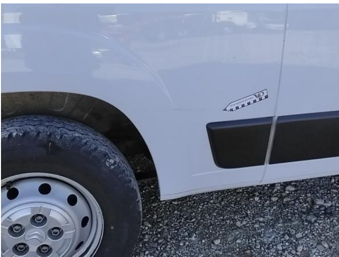
7: Qtr Panel osr Scratched Over 25mm Not Thru Paint