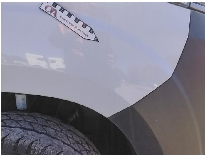
1: Wing of Chipped 1 To 5