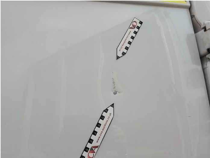
3: Panel Rear Dented Over 30mm