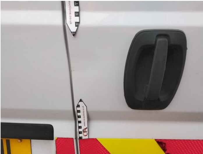
5: Panel Rear Dented Over 30mm