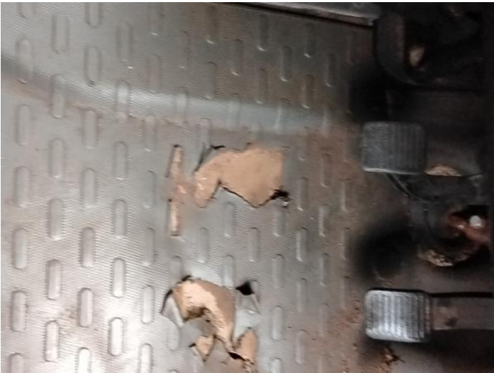
6: Carpets Front Holed Over 3mm