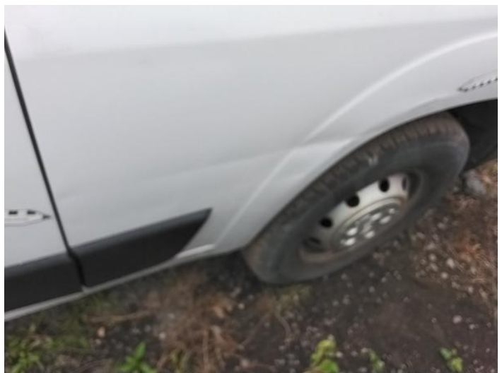
2: Qtr Panel nsr Dented Over 30mm