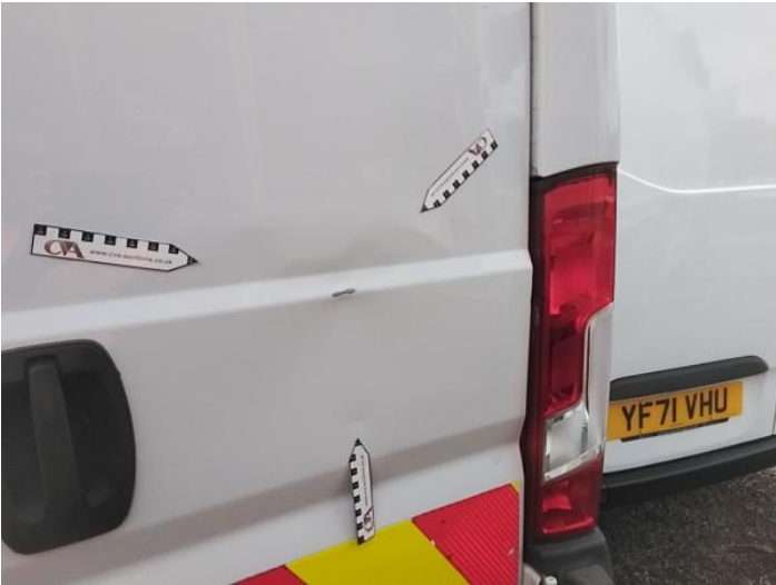
4: Panel Rear Dented Over 30mm