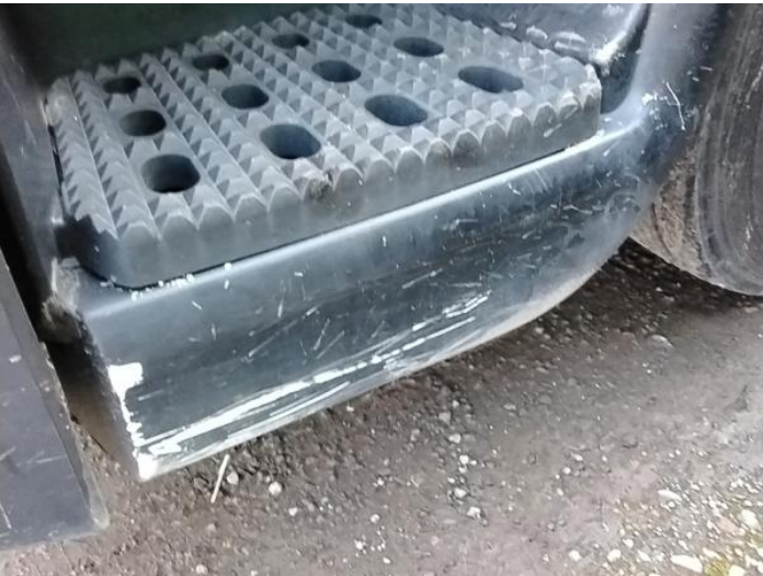
1: Panel Front Scratched Over 25mm Not Thru Paint