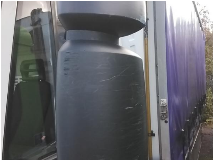
2: Door Mirror Assy nsf Scuffed (Unpainted) Over 100mm

Carpet Condition Average Seat Condition Average