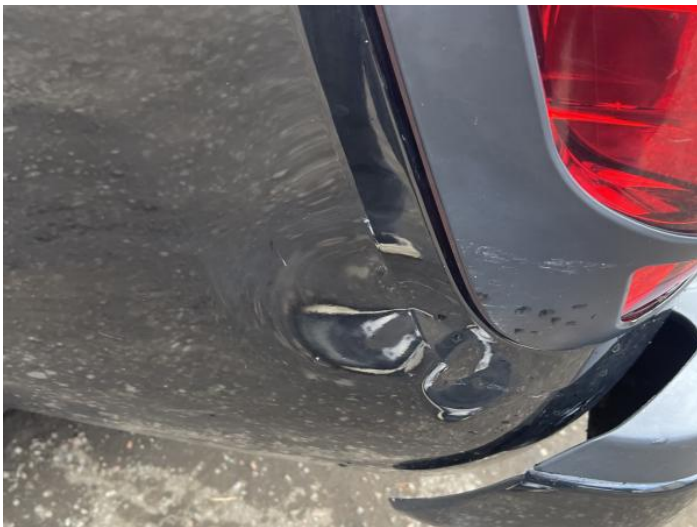
4: Qtr Panel nsr Dented Over 30mm