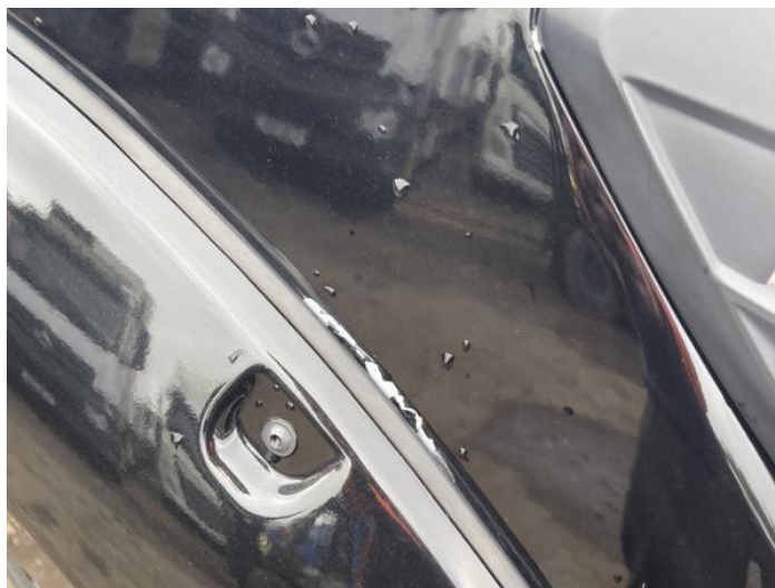
2: Wing osf Poor Previous Repair Paint Flake