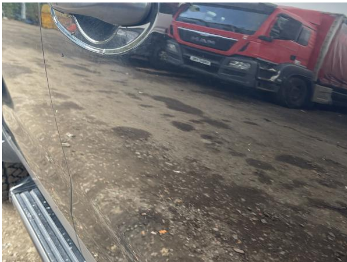
3: Door osf Poor Previous Repair Rippled UpTo 30%