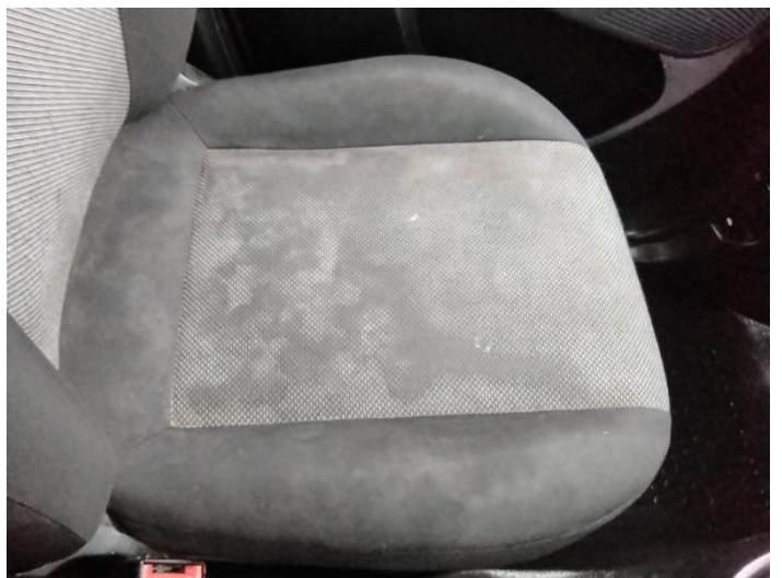
8: Seat Base Cover nsf Soiled Heavy