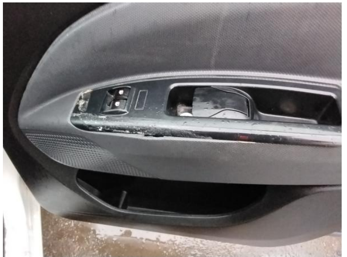
6: Door Pad osf Broken Replace