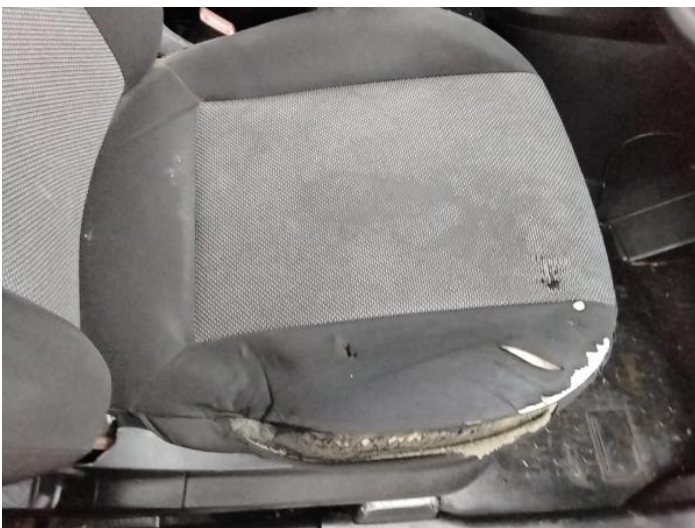
7: Seat Base Cover osf Torn Over 3mm