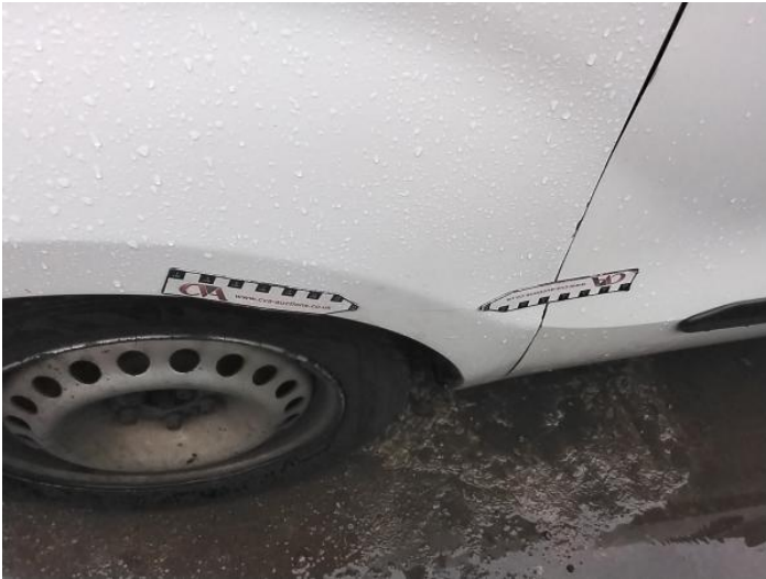
3: Wing nsf Dented With Paint Damage