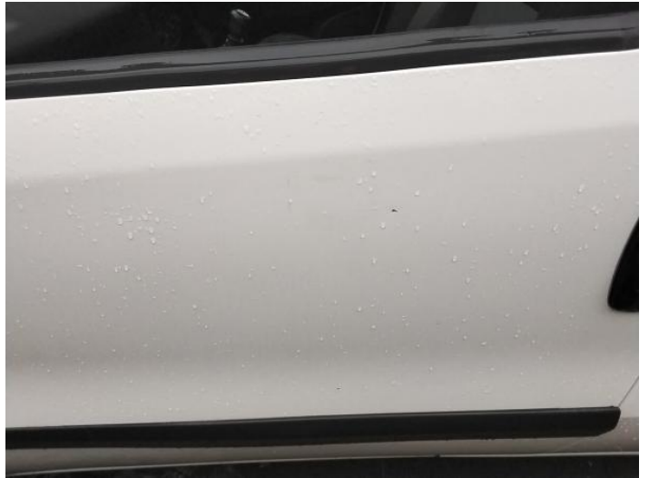
4: Door nsf Chipped Multiple Chips