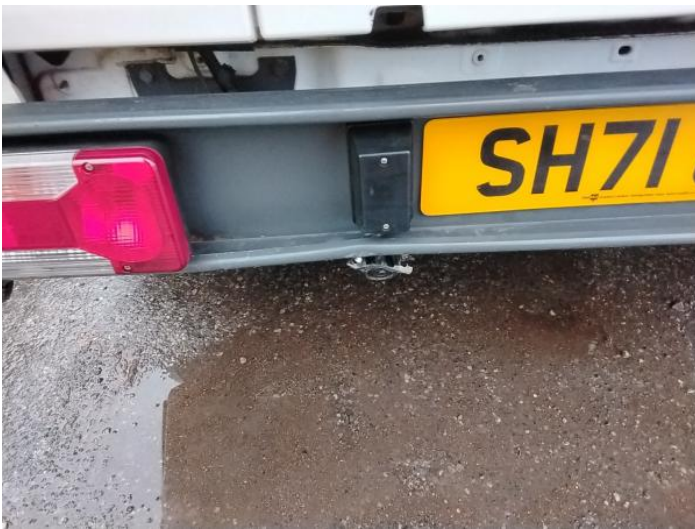
5: Bumper Rear Dented With Paint Damage