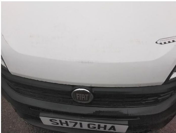
1: Bonnet Scratched Over 25mm Thru Paint