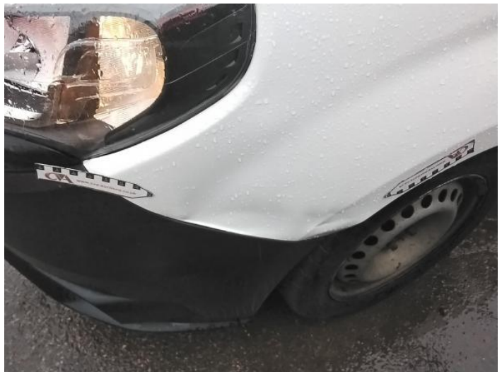
2: Wing nsf Dented Over 30mm