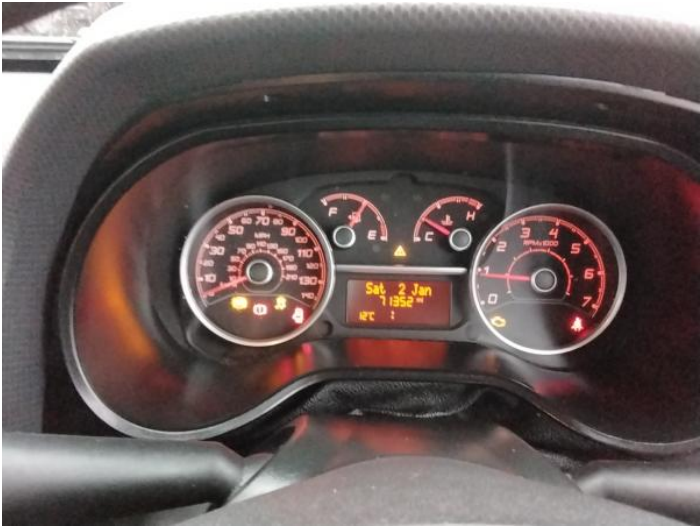
9: Dash Warning Lights Displayed No Action