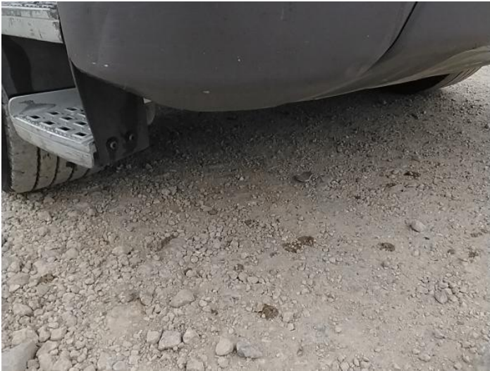
3: Bumper Front Moulding Scratched (Painted) UpTo 25mm Thru Paint