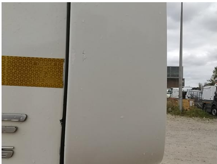
1: Wing osf Scratched UpTo 25mm Thru Paint