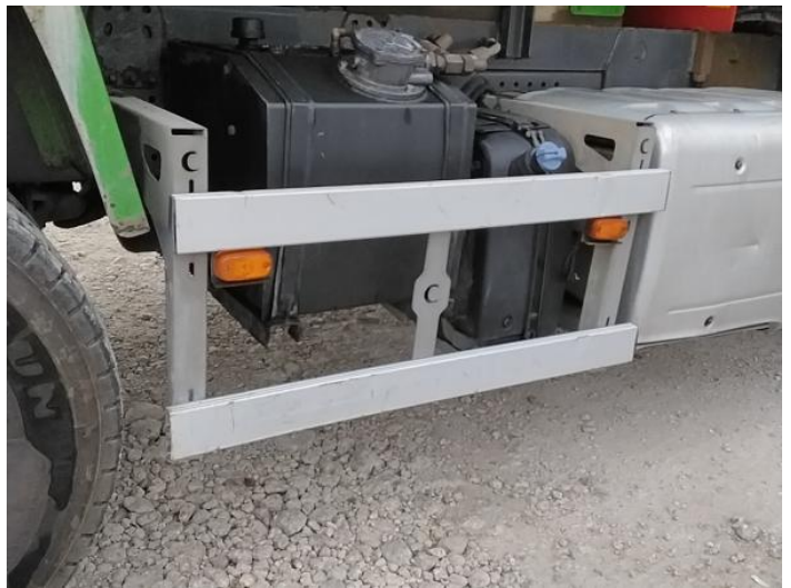
12: Other N/A N/A