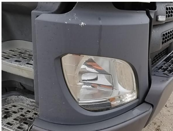
2: Fog Lamp Surround os Scratched (Painted) UpTo 25mm Thru Paint