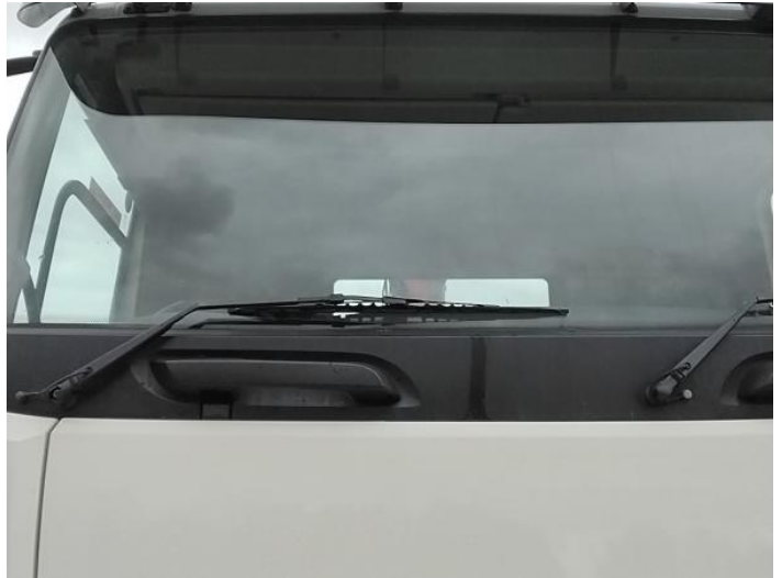
4: Screen Front Chipped Over 10mm