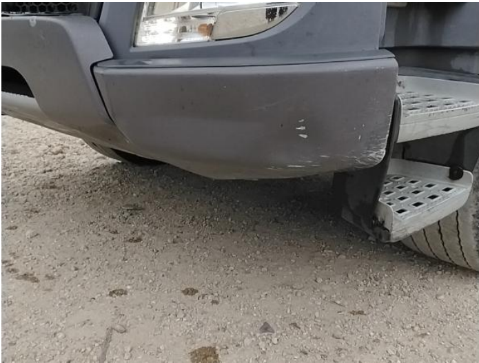
5: Bumper Front Moulding Scratched (Painted) Over 25mm Thru Paint