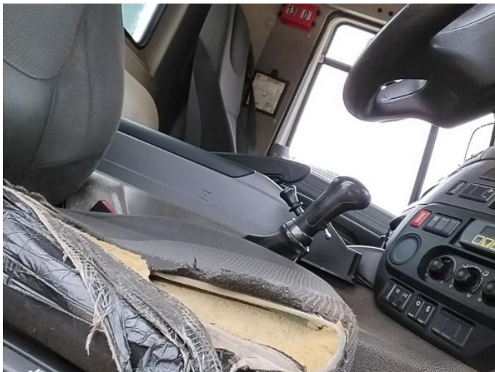
15: Seat Base Cover osf Torn Over 3mm