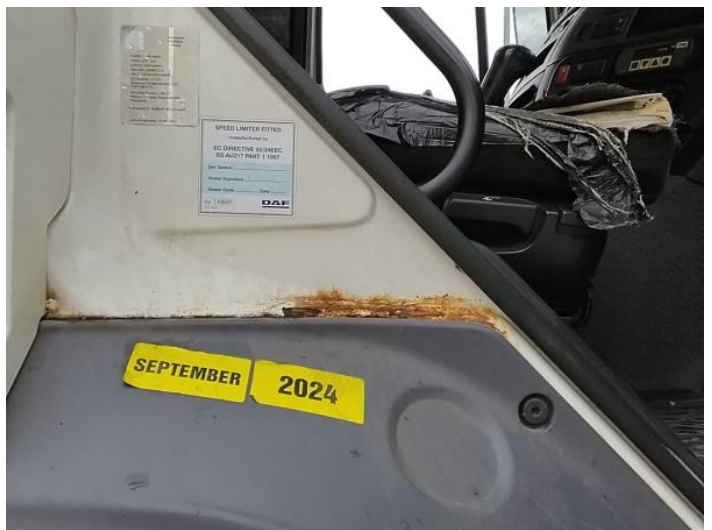
14: Other N/A N/A