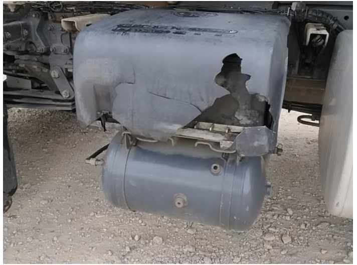
10: Other N/A N/A