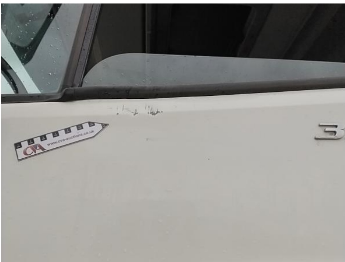
7: Door nsf Dented With Paint Damage