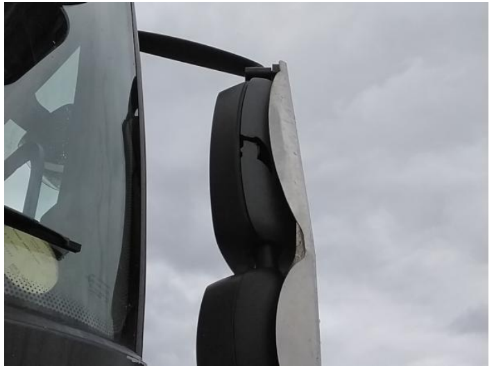
6: Door Mirror Assy nsf Broken Replace