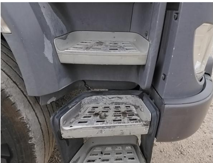
13: Other N/A N/A