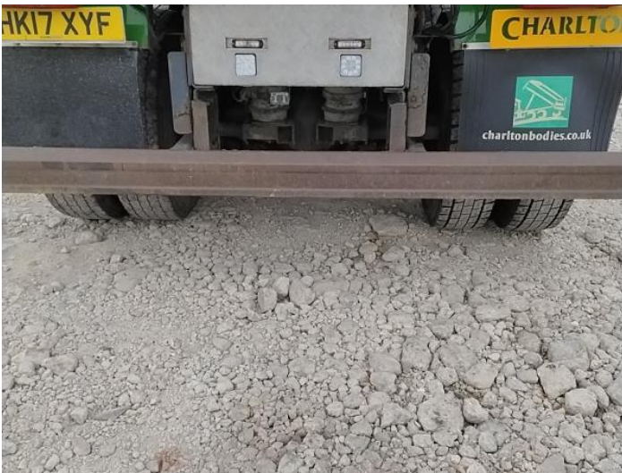
11: Bumper Rear Rusted Over 5mm