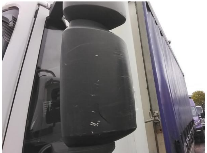
2: Door Mirror Assy nsf Broken Replace