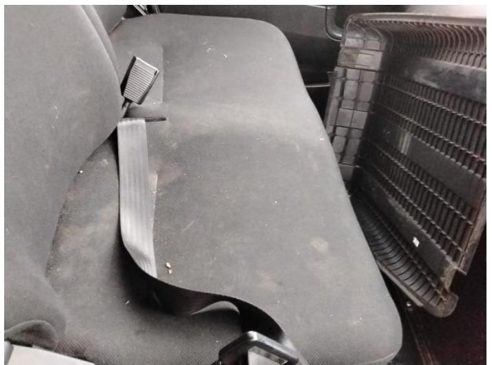
8: Seat Base Cover nsf Soiled Heavy