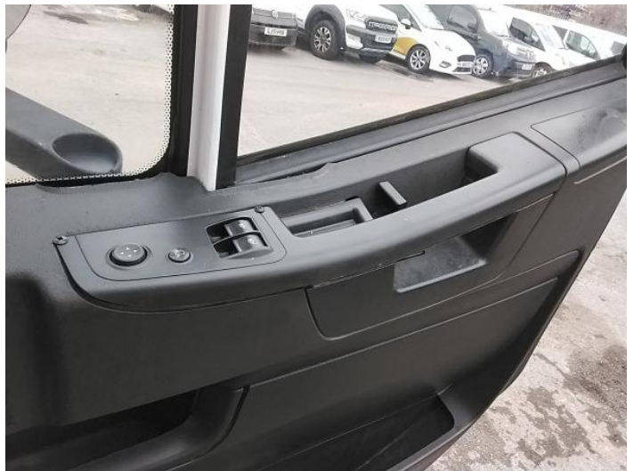
6: Door Pad osf Broken Replace