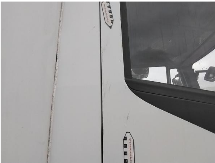
5: Door osf Scratched Over 25mm Thru Paint