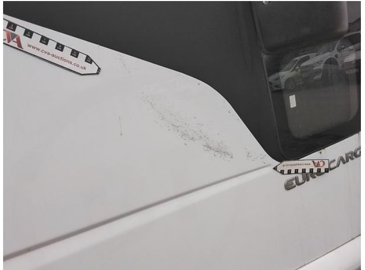
4: Door osf Scratched Over 25mm Thru Paint