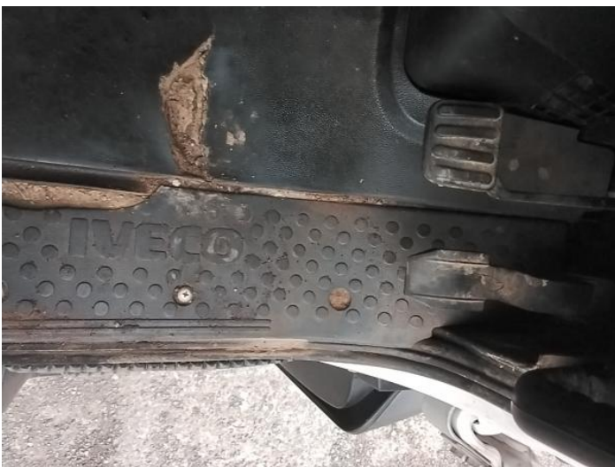
7: Carpets Front Holed Over 3mm