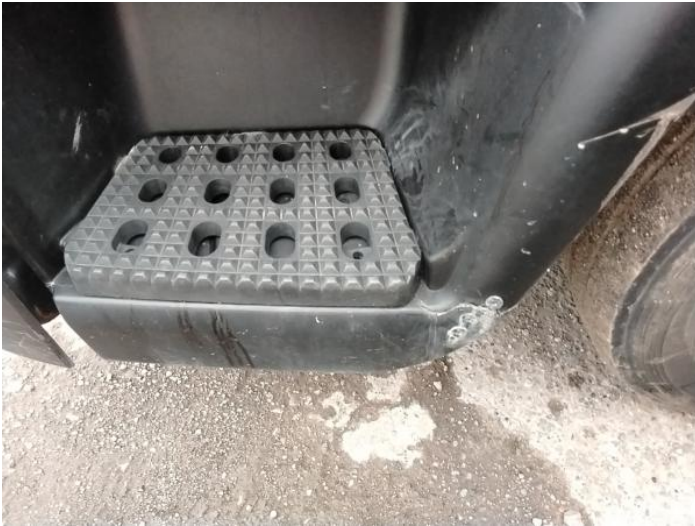
3: Bumper Front Moulding Broken Replace