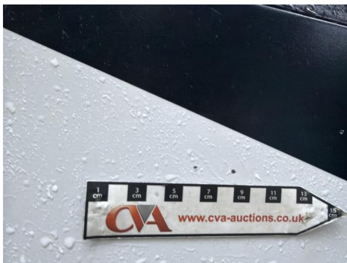
2: Door osf Chipped Multiple Chips