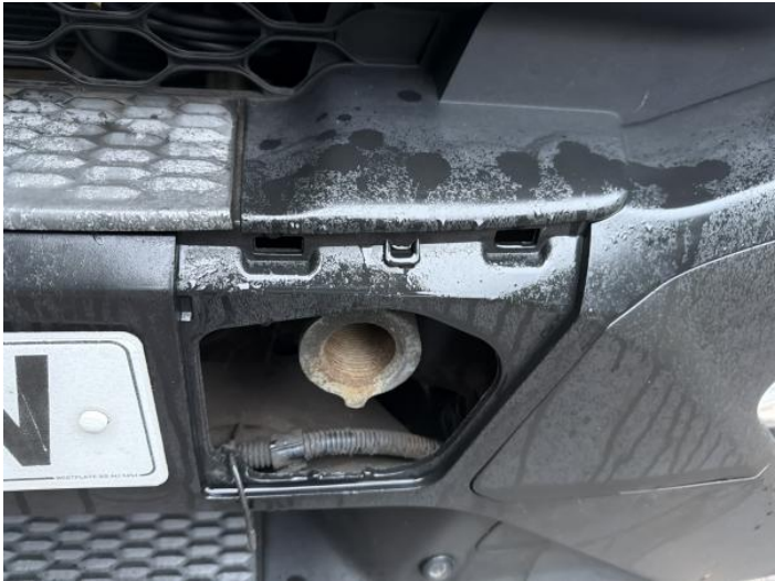
4: Front TowEye Cvr Missing Replace