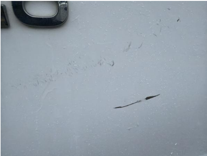
5: Door nsf Scratched Over 25mm Thru Paint