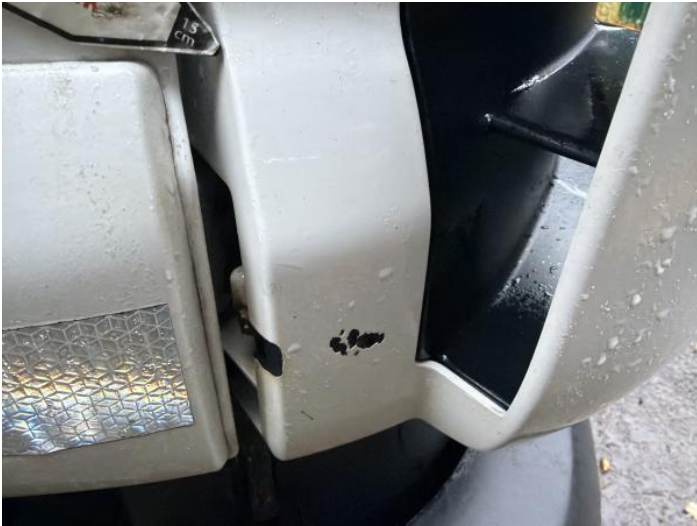
3: A Post os Chipped Multiple Chips