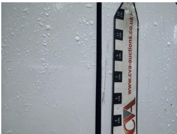
1: Door osf Scratched Over 25mm Thru Paint