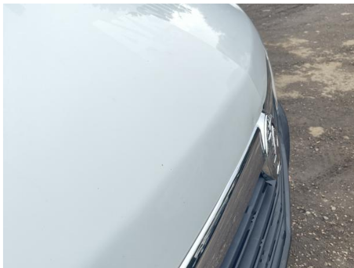
2: Bonnet Dented With Paint Damage