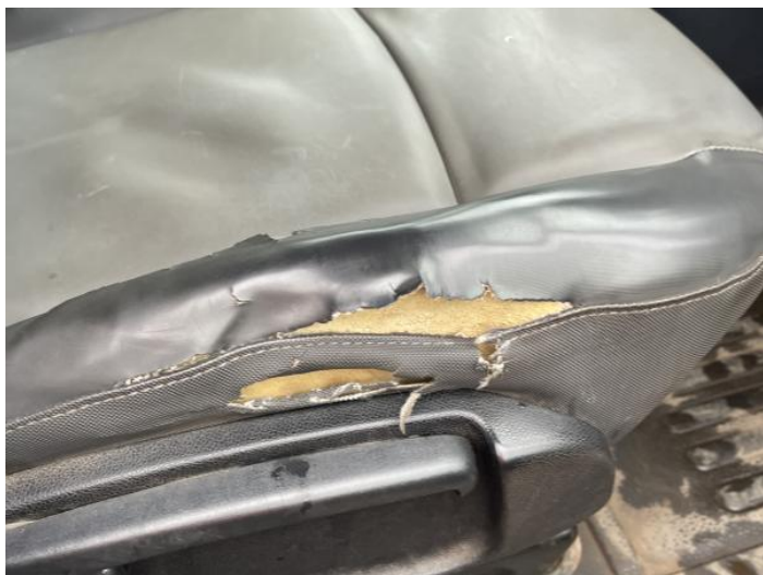
1: Seat Base Cover of Torn Over 3mm