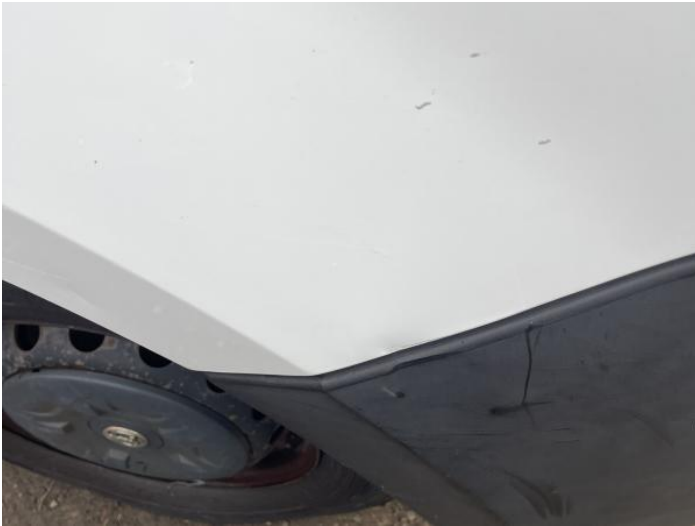
3: Wing osf Dented With Paint Damage