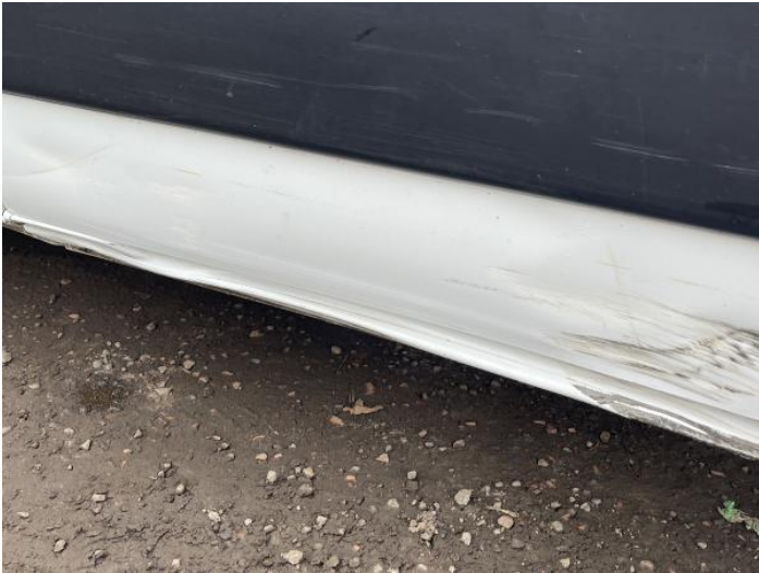
9: Door nsr Dented With Paint Damage