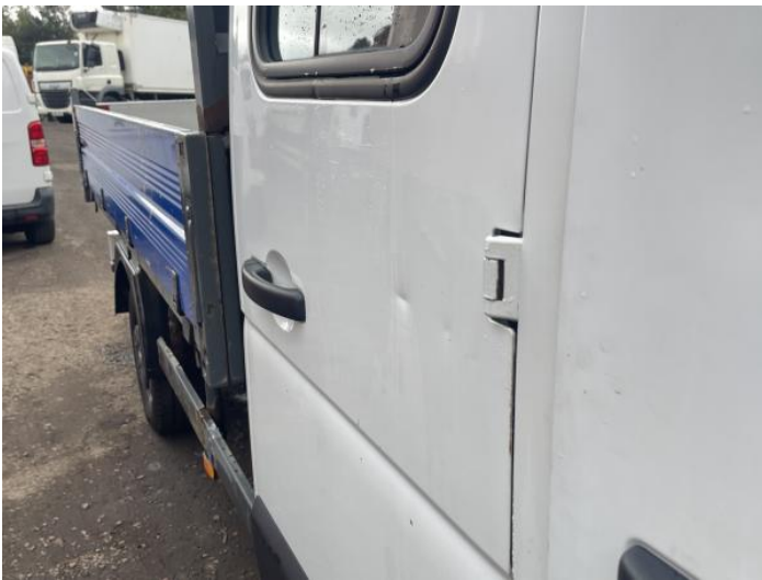
5: Door osr Dented With Paint Damage