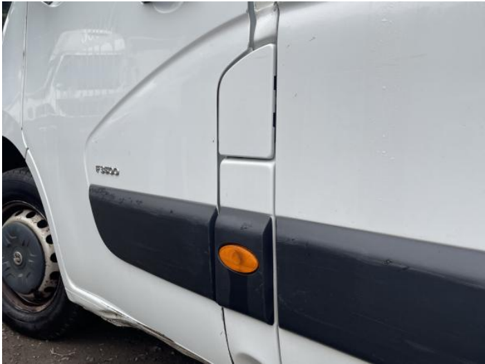
10: B Post ns Dented With Paint Damage