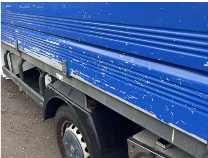
7: Qtr Panel nsr Dented With Paint Damage