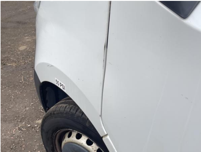
11: Wing nsf Dented With Paint Damage