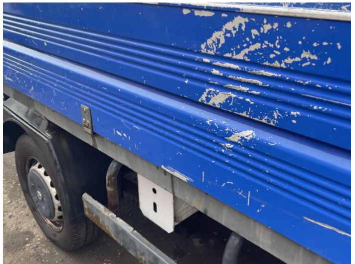
6: Qtr Panel osr Dented With Paint Damage