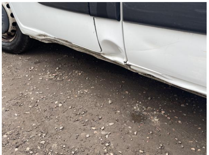
8: Sill ns Dented With Paint Damage