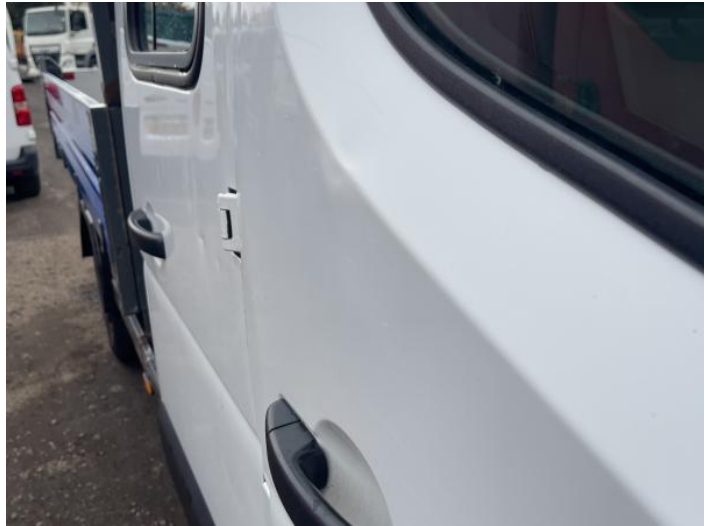
4: Door osf Dented With Paint Damage