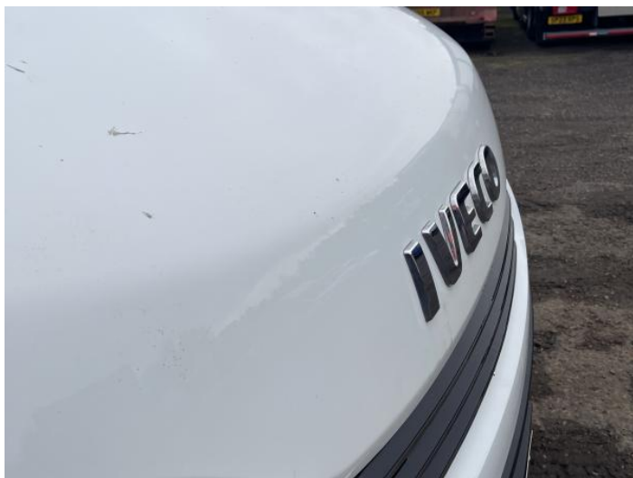
1: Bonnet Dented Over 30mm