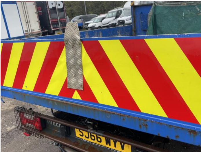
5: Tailgate Rusted Over 5mm