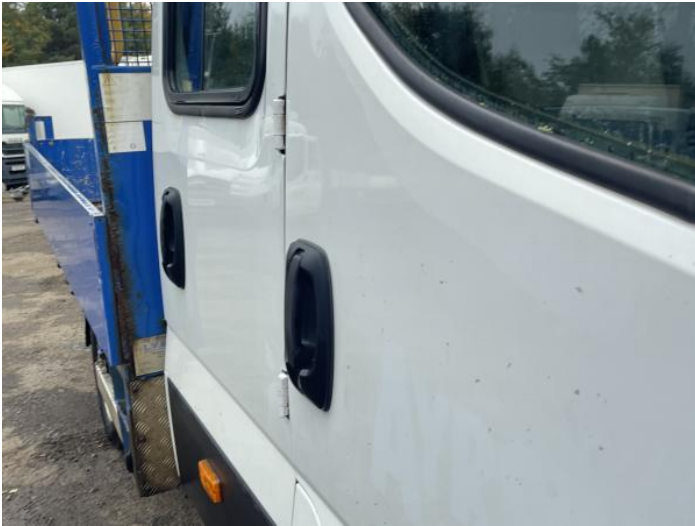
3: Door osf Dented With Paint Damage