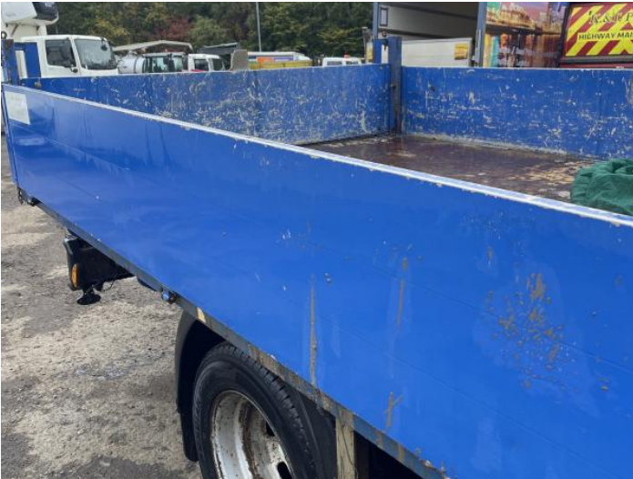
4: Qtr Panel osr Dented With Paint Damage