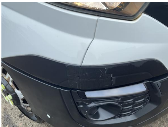
2: Bumper Front Moulding Broken Replace