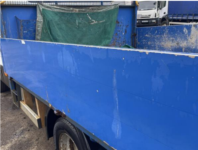
6: Qtr Panel nsr Dented Over 30mm