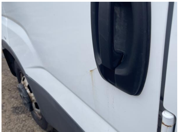
8: Door nsf Rusted Over 5mm