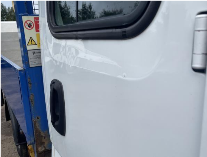
3: Door osr Dented With Paint Damage