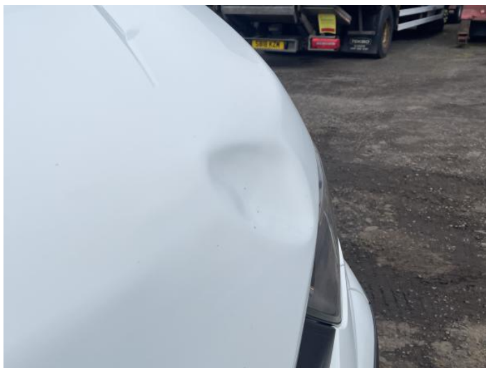
1: Bonnet Dented With Paint Damage