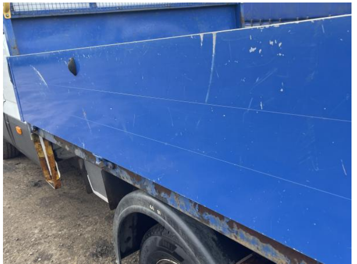
6: Qtr Panel nsr Dented With Paint Damage