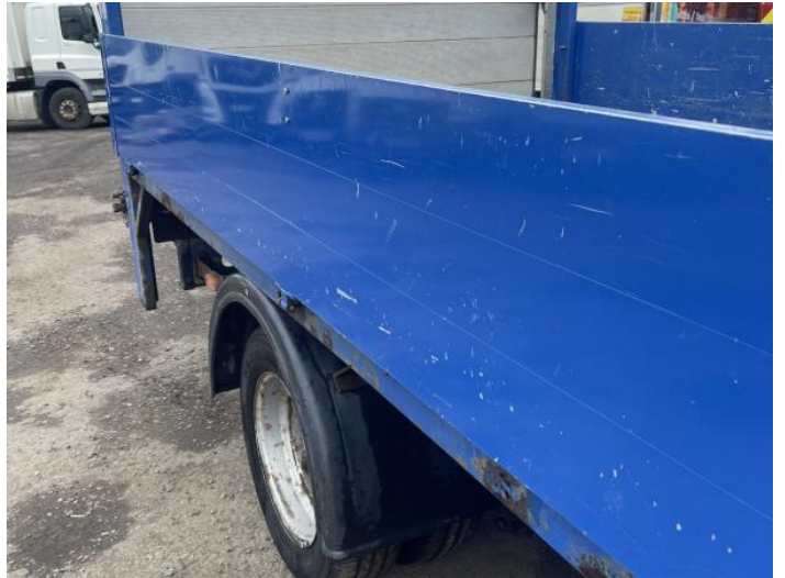
4: Qtr Panel osr Dented With Paint Damage