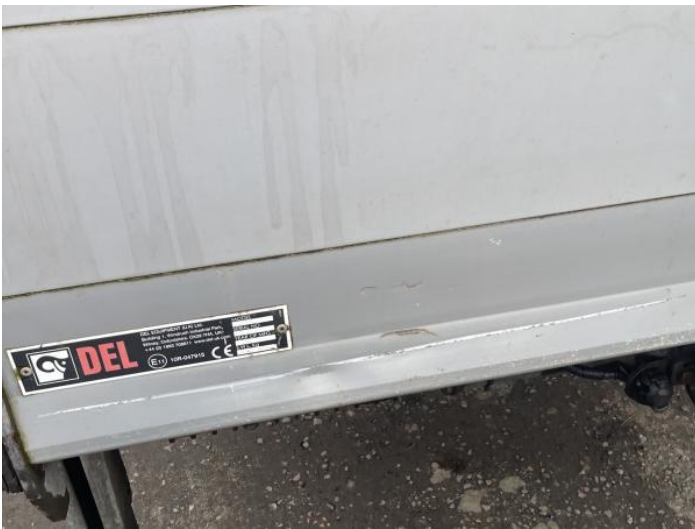
5: Tailgate Dented With Paint Damage