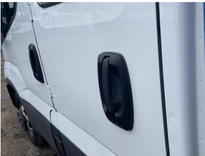
7: Door nsr Dented Over 30mm