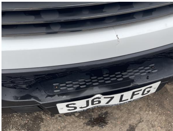
2: Bumper Front Moulding Broken Replace