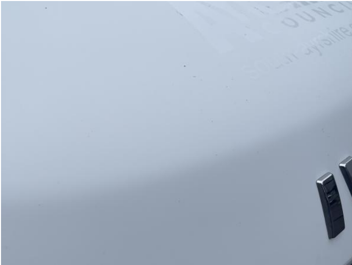
3: Bonnet Chipped Multiple Chips