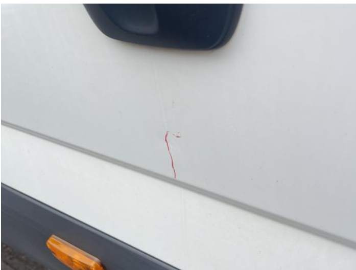
7: Door nsr Dented Over 30mm