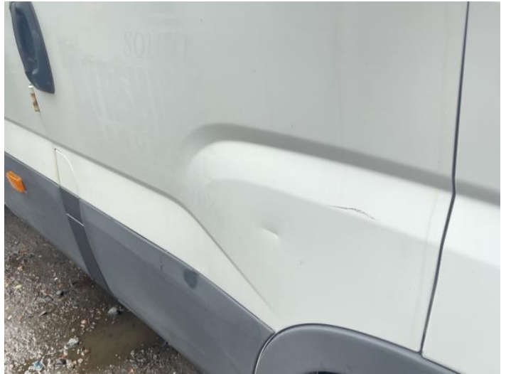
4: Door osf Dented With Paint Damage