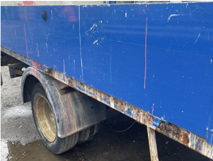
5: Qtr Panel osr Dented With Paint Damage