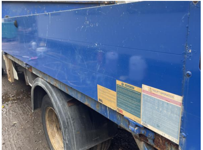
6: Qtr Panel nsr Dented Over 30mm