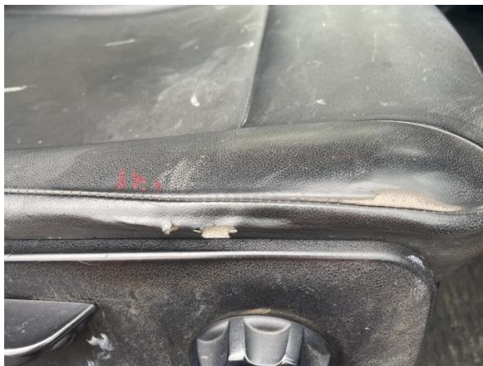
2: Seat Base Cover osf Torn Over 3mm