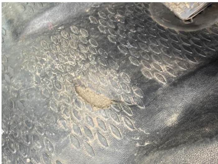
1: Carpets Front Torn Over 10mm