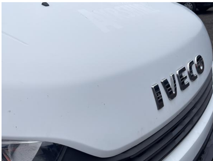
1: Bonnet Chipped Multiple Chips