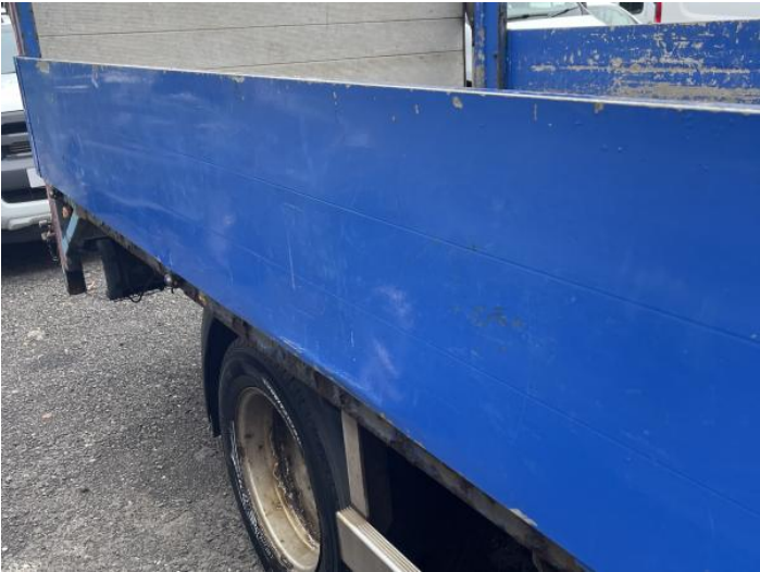
4: Qtr Panel osr Dented With Paint Damage