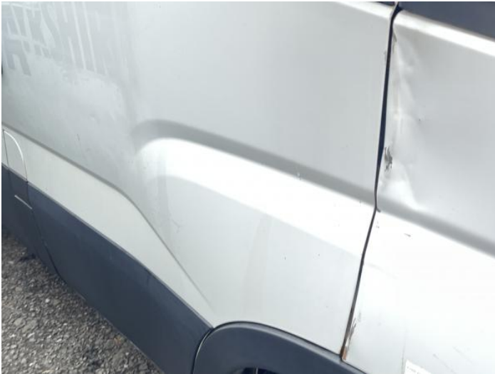
3: Door osf Dented With Paint Damage