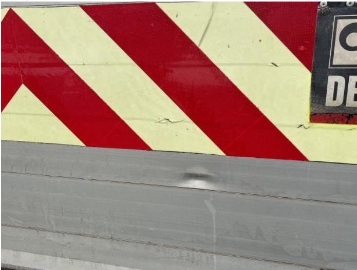
5: Tailgate Dented Over 30mm