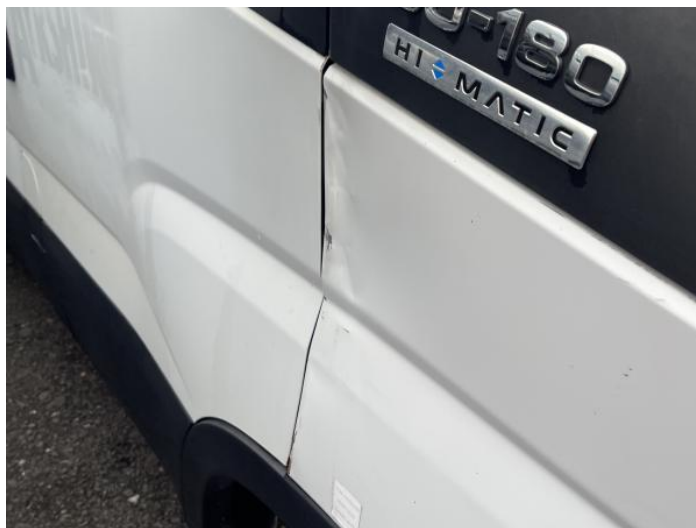
2: Wing osf Dented With Paint Damage