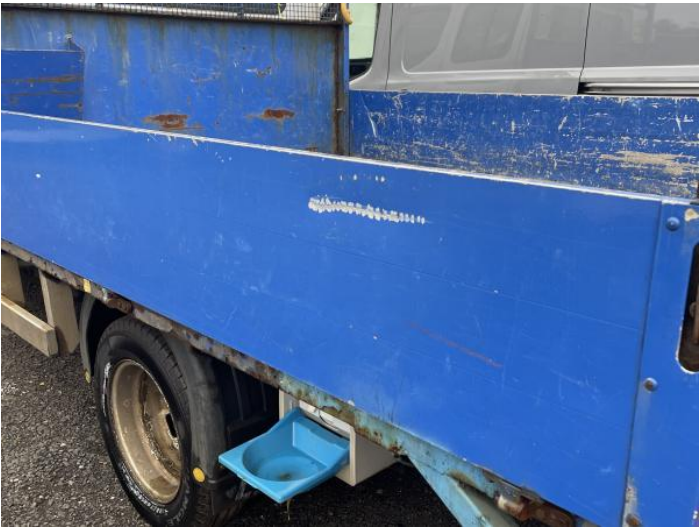
6: Qtr Panel nsr Dented With Paint Damage