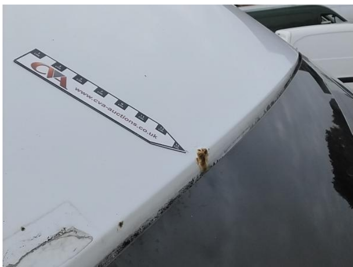
1: General Exterior Soiled Light