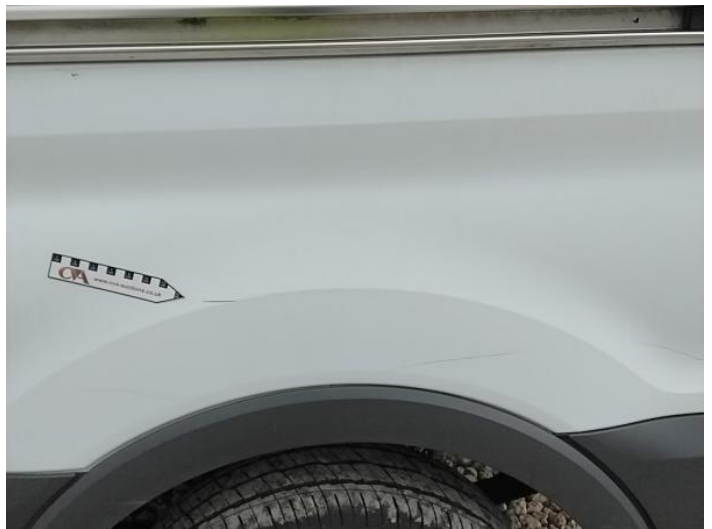
6: Qtr Panel nsr Scratched Over 25mm Thru Paint