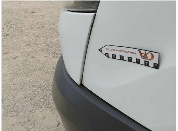
4: Bumper Front Grill Broken Replace