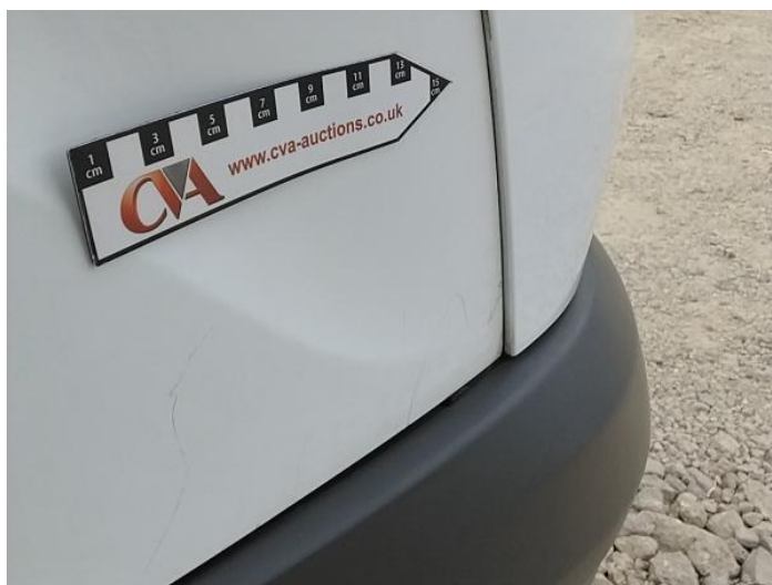
2: Bumper Front Grill Broken Replace