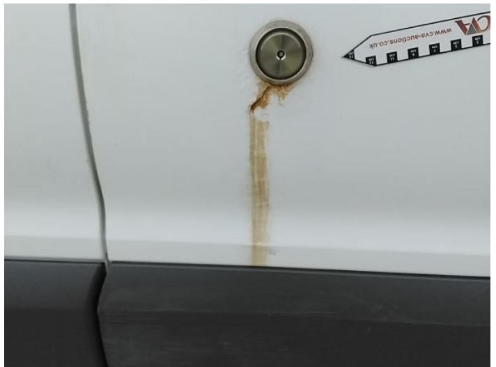
9: General Exterior Soiled Light