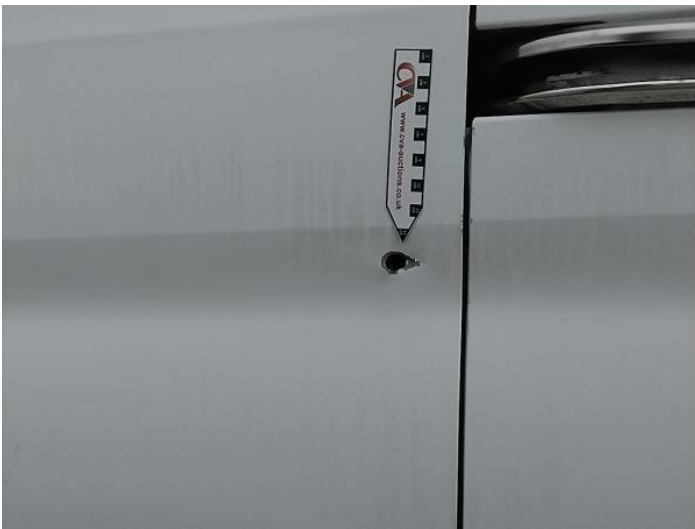
5: Door nsr Hole Over 10mm