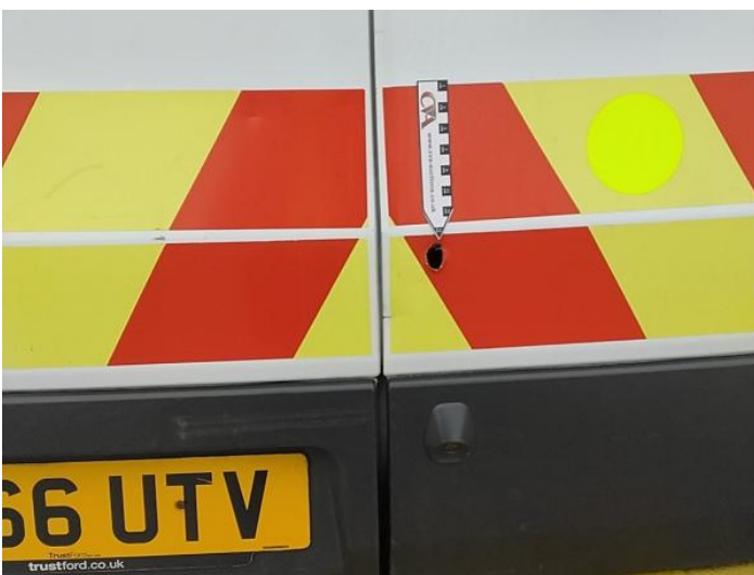
7: General Exterior Soiled Light