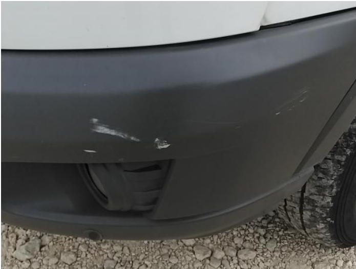
3: Bumper Front Scratched Over 25mm Not Thru Paint