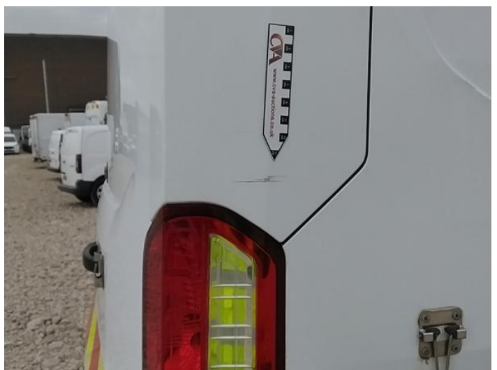
8: Qtr Panel osr Scratched Over 25mm Not Thru Paint