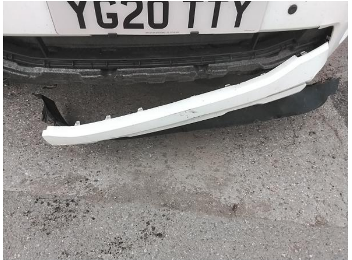
4: Bumper Front Moulding Broken Replace