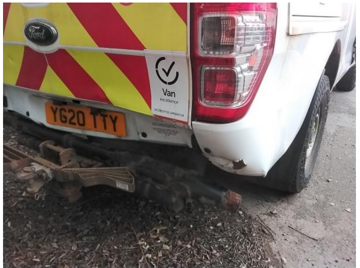
6: Unclassified Substantial Accident Damage Report Only