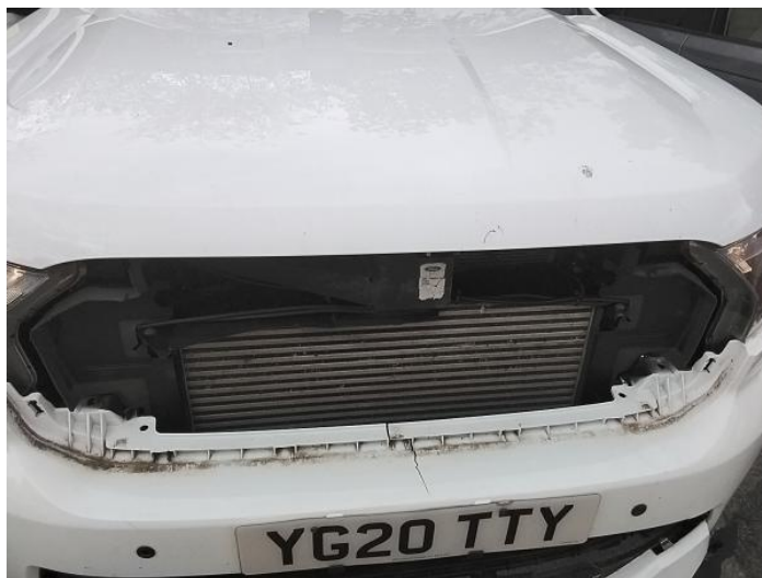
2: Bumper Front Grill Missing Replace