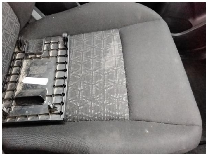
8: Seat Base Cover nsf Soiled Heavy