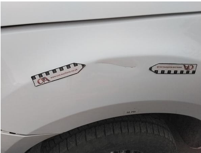
5: Wing nsf Dented With Paint Damage