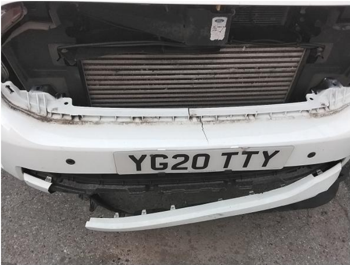
3: Bumper Front Cracked Over 25mm