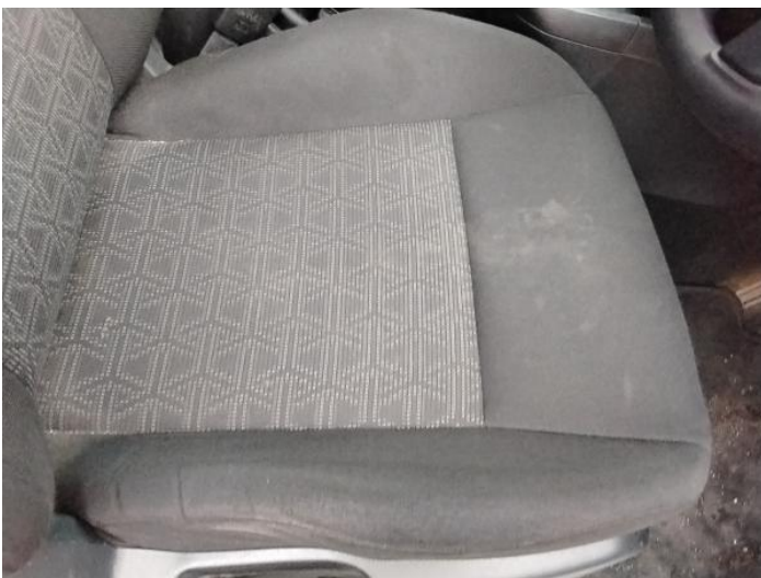
7: Seat Base Cover osf Soiled Heavy