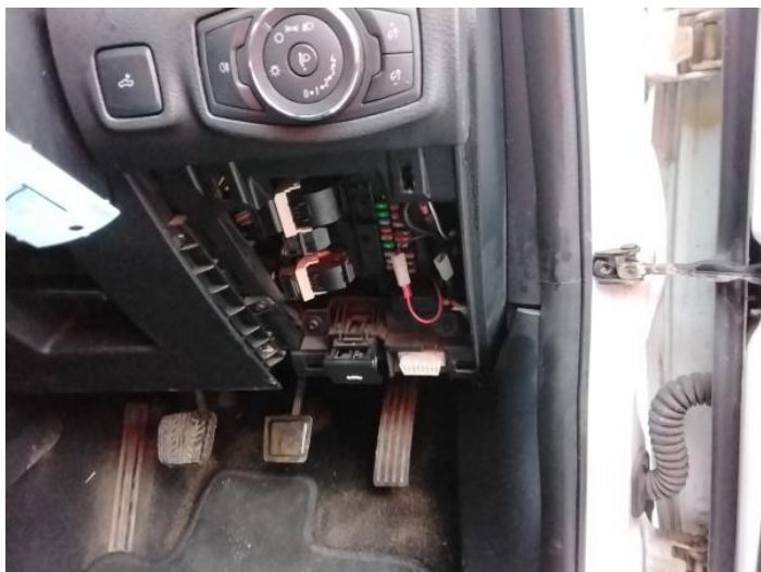
9: Fascia Panel Missing Replace