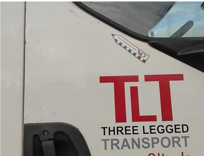
17: Door osf Scratched UpTo 25mm Thru Paint