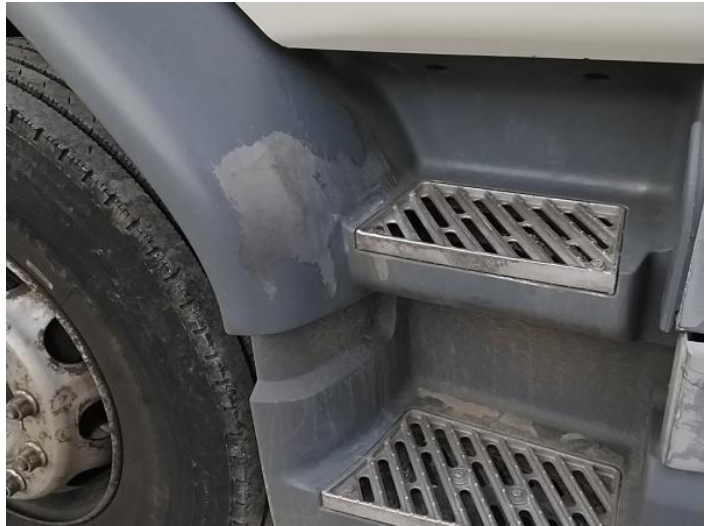
16: Other N/A N/A