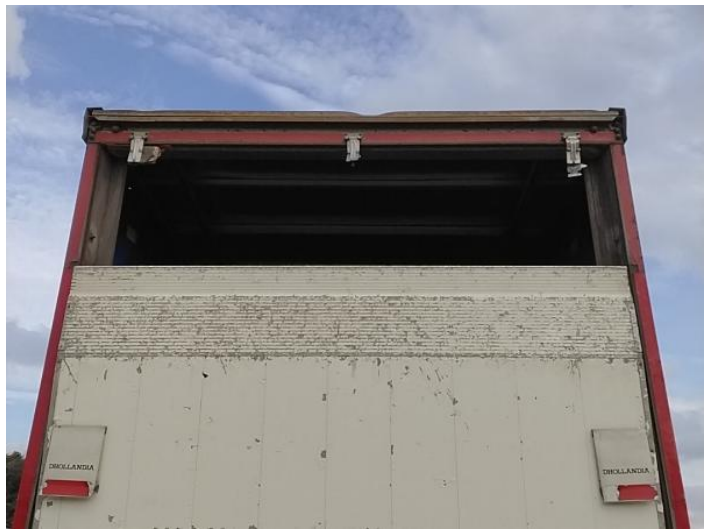
12: Other N/A N/A