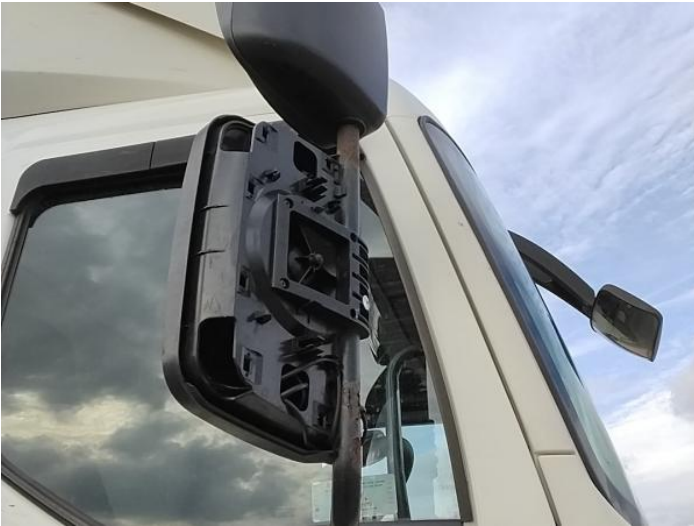
15: Door Mirror Assy osf Missing Replace