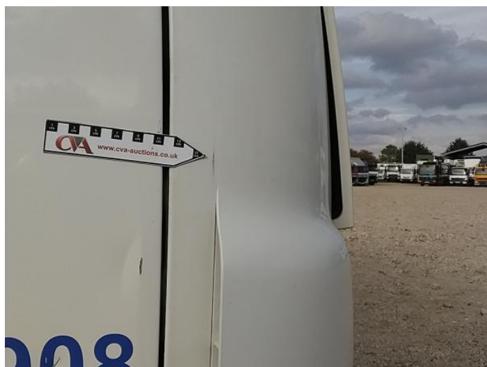
1: Wing osf Scratched UpTo 25mm Thru Paint