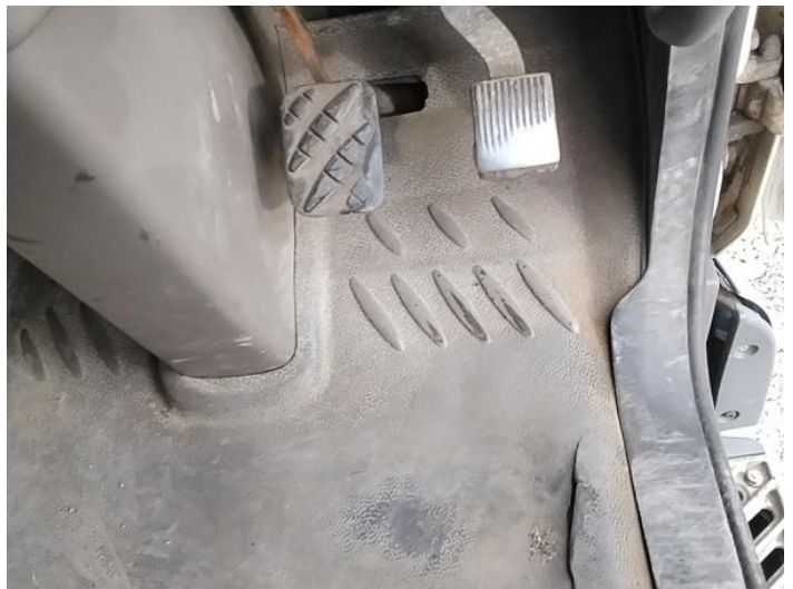
22: Carpets Front Torn Over 10mm