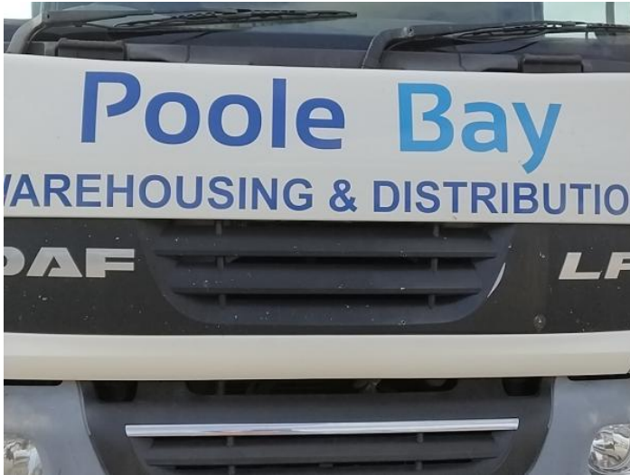
3: Grille Front Scratched (Painted) UpTo 25mm Thru Paint