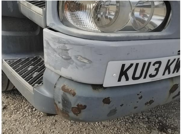
4: Bumper Front Moulding Scuffed (Unpainted) Over 100mm