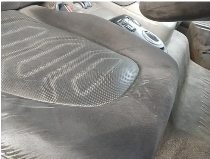
21: Seat Base Cover osf Burn Over 3mm