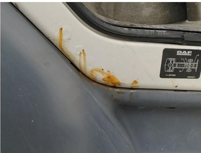
19: Other N/A N/A