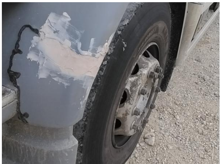
8: Other N/A N/A