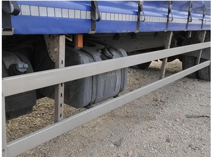
10: Other N/A N/A