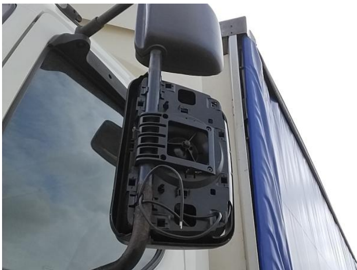
7: Door Mirror Assy nsf Missing Replace