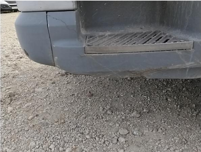
9: Other N/A N/A