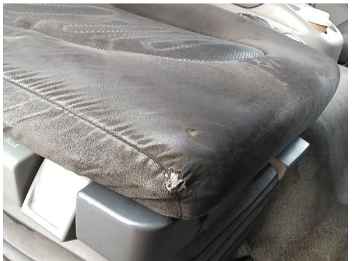
20: Seat Base Cover osf Holed Over 3mm