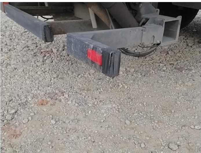
13: Other N/A N/A