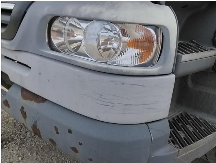
5: Bumper Front Moulding Scuffed (Unpainted) Over 100mm