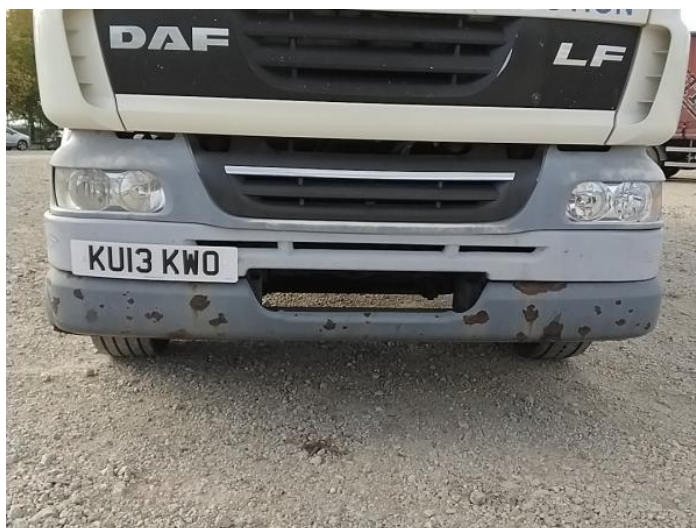
2: Bumper Front Rusted Over 5mm