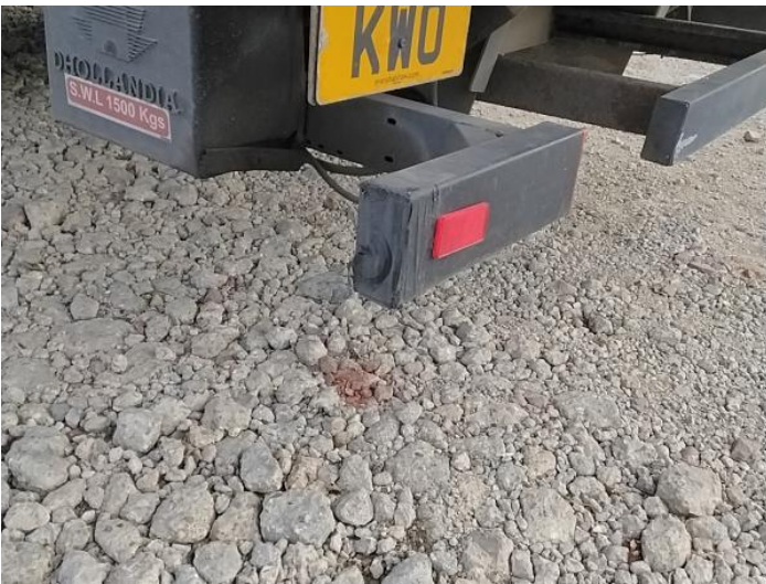
11: Other N/A N/A