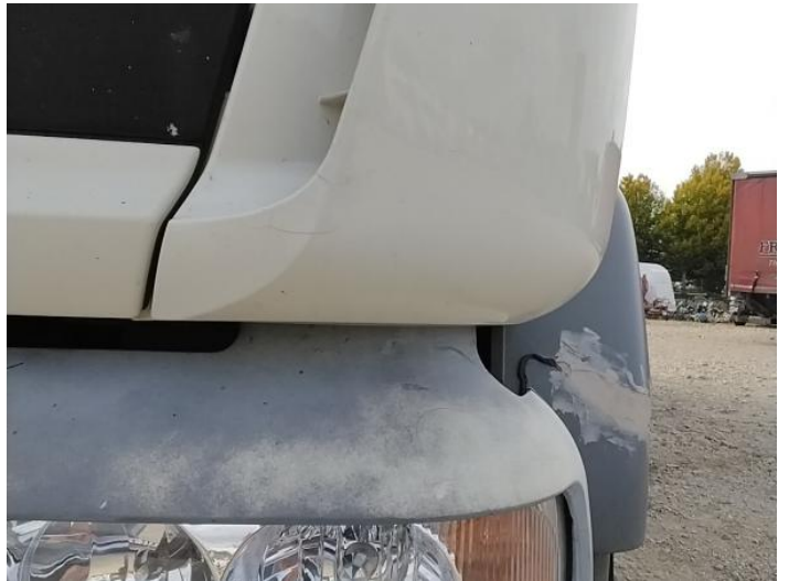
6: Wing nsf Cracked Replace