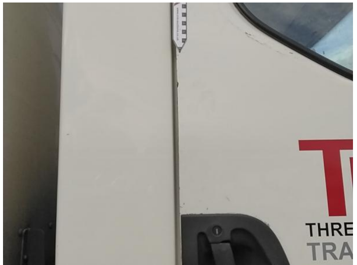
18: Door osf Chipped Edge Chip