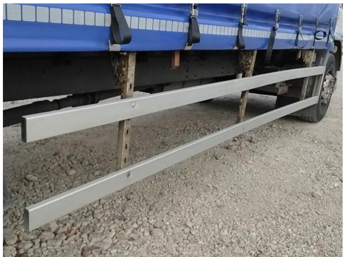
14: Other N/A N/A