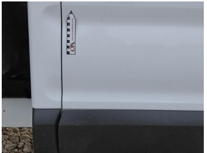
12: Door osr Scratched UpTo 25mm Not Thru Paint