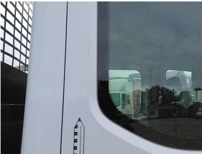
11: Door osr Scratched Over 25mm Not Thru Paint