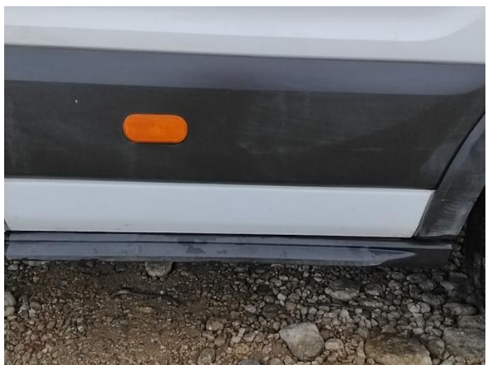
14: Door Moulding osf Scuffed (Unpainted) UpTo 100mm