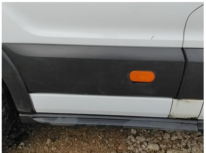
8: Door Moulding nsf Scuffed (Unpainted) UpTo 100mm