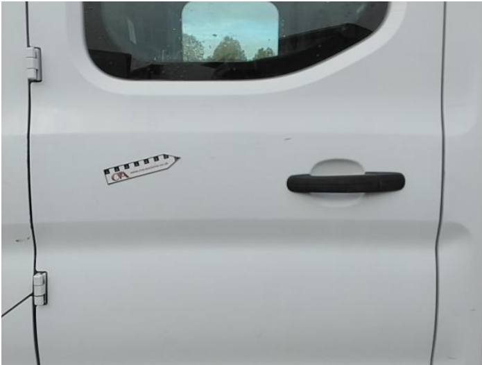
9: Door nsr Scratched UpTo 25mm Not Thru Paint