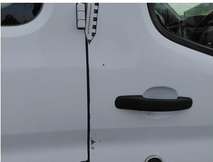
13: Door osf Chipped Edge Chip