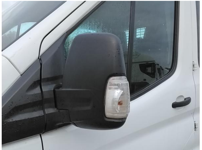
6: Door Mirror Assy nsf Scuffed (Unpainted) UpTo 100mm