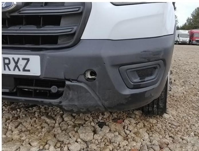
2: Bumper Front Cracked Over 25mm