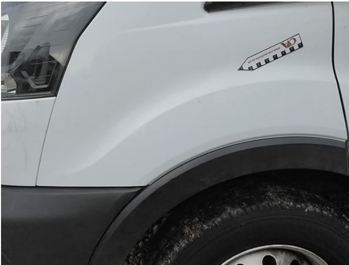
5: Wing nsf Scratched Over 25mm Not Thru Paint