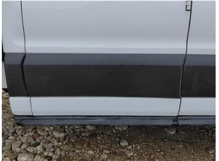
10: Door Moulding osr Scuffed (Unpainted) UpTo 100mm