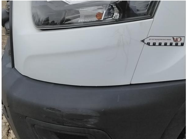
4: Fog Lamp Surround ns Scratched (Painted) Over 25mm Thru Paint