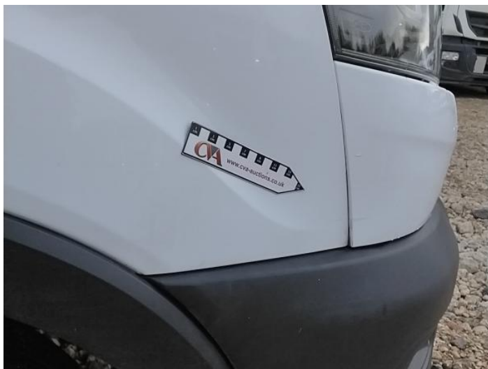
1: Wing osf Dented Between 10mm + 30mm