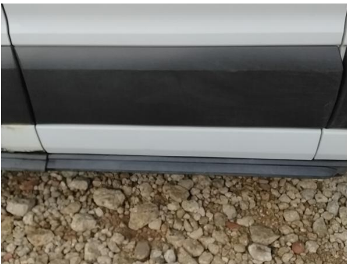
7: Door Moulding nsr Scuffed (Unpainted) UpTo 100mm