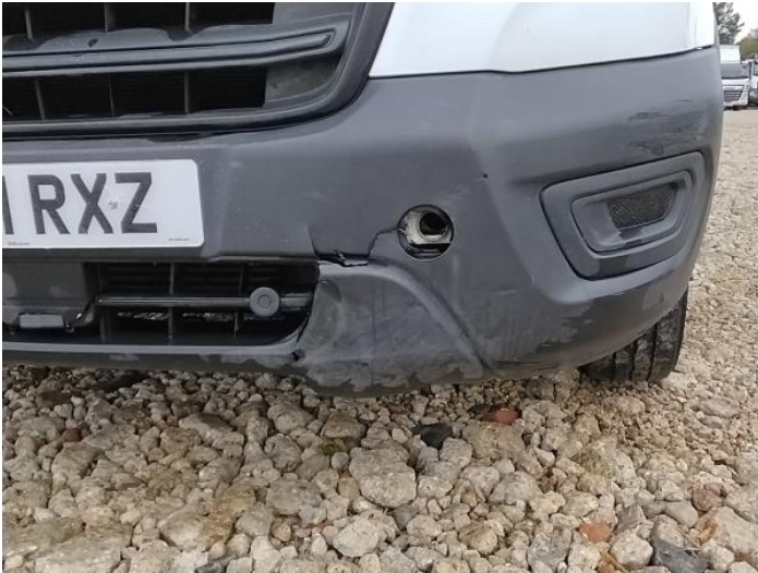
3: Front TowEye Cvr Missing Replace