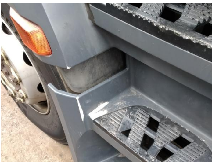
7: Moulding nsf Wing Scuffed (Unpainted) Over 100mm