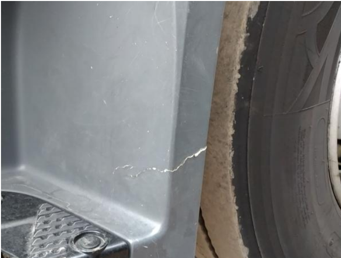
3: Moulding onsf Wing Broken Replace