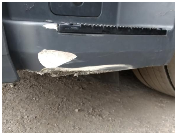
2: Bumper Front Moulding Scratched (Painted) Over 25mm Thru Paint