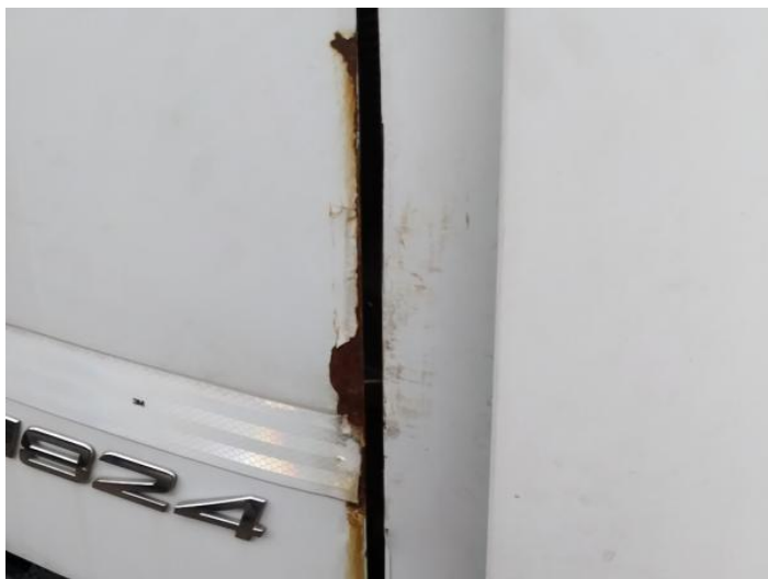
1: Door nsf Chipped Edge Chip