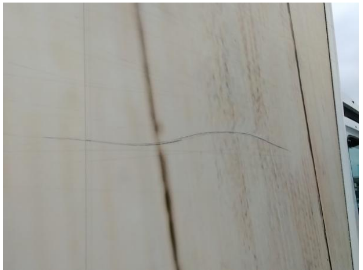
6: Panel Front Scratched Over 25mm Not Thru Paint