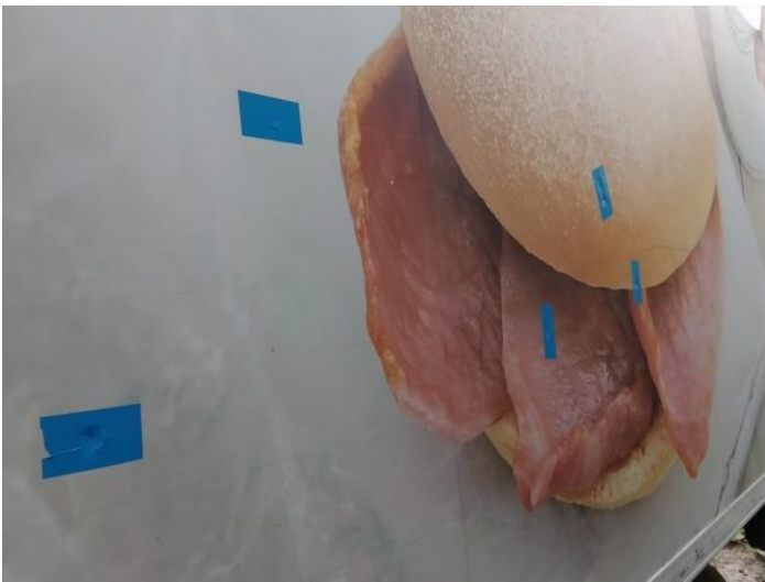
5: Panel Rear Hole Over 10mm