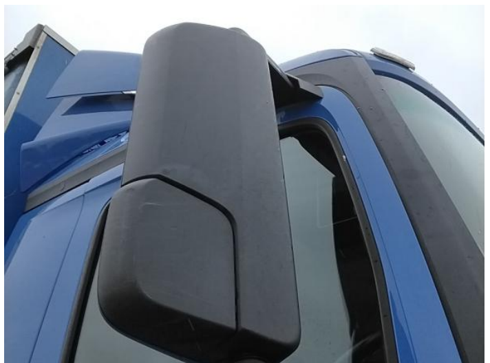
8: Door Mirror Assy osf Scuffed (Unpainted) UpTo 100mm