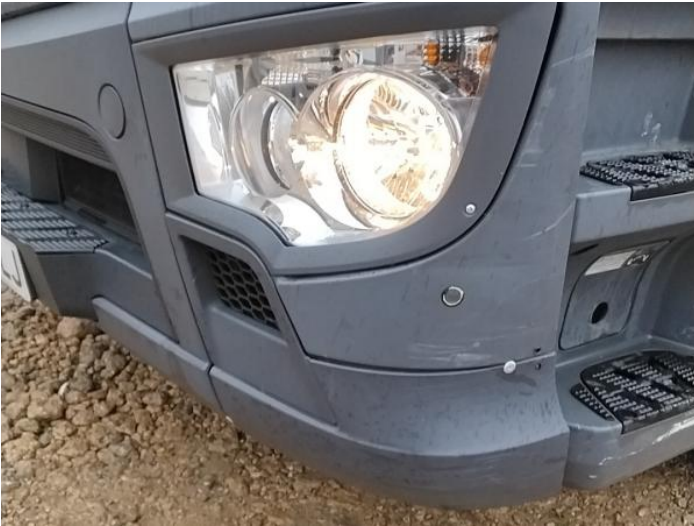
3: Bumper Front Moulding Scuffed (Unpainted) UpTo 100mm