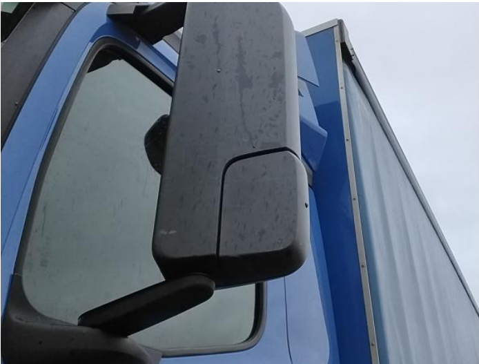
5: Door Mirror Assy nsf Scuffed (Unpainted) UpTo 100mm