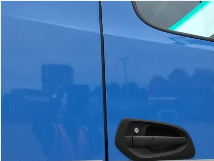
9: Door osf Chipped Edge Chip