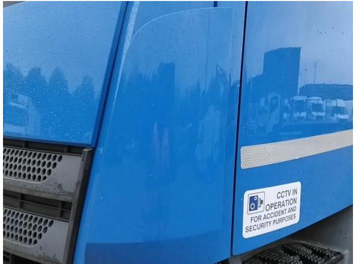
4: Wing nsf Scratched UpTo 25mm Not Thru Paint