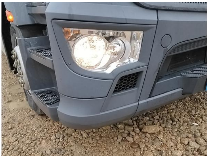
1: Bumper Front Chipped Multiple Chips