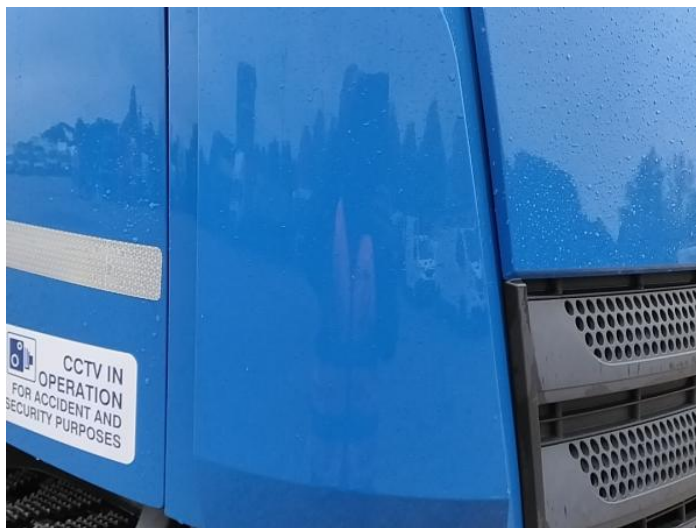
2: Wing osf Chipped Multiple Chips