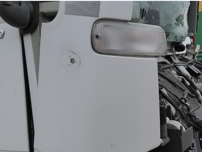
1: Other N/A N/A