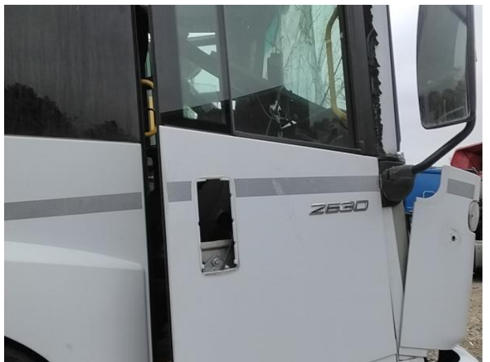
14: Other N/A N/A