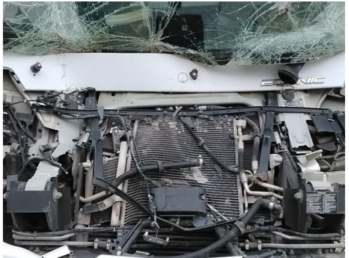
6: Other N/A N/A