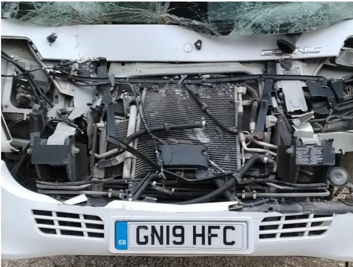
5: Bonnet Missing Replace