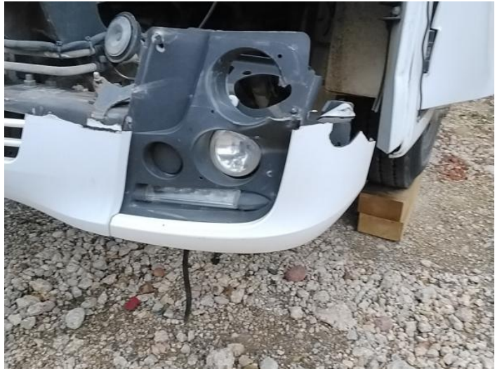
10: Headlamps Broken Replace