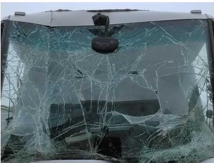
7: Screen Front Cracked Replace