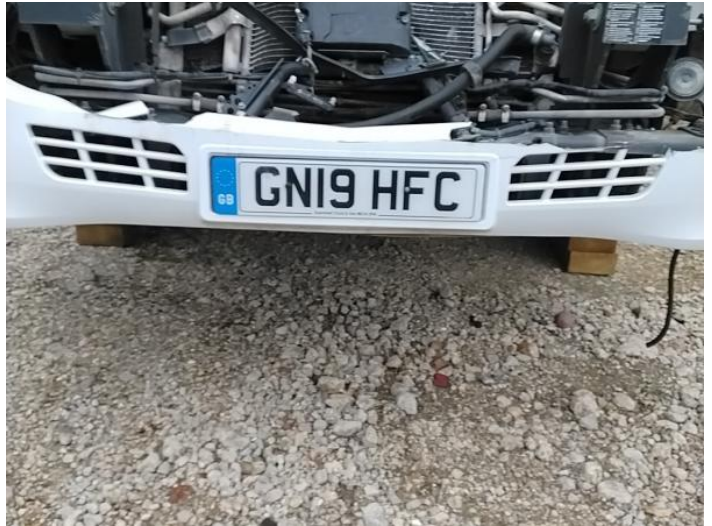
4: Other N/A N/A