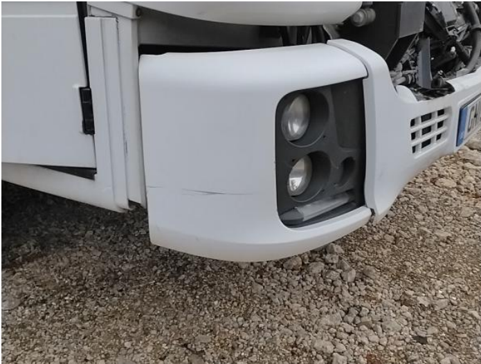
3: Fog Lamp Surround os Broken Replace