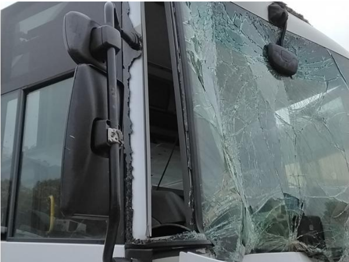
2: Other N/A N/A