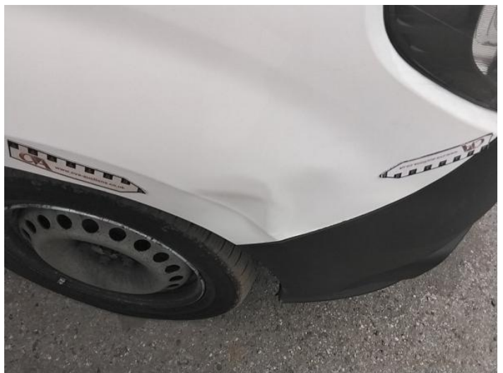
8: Wing osf Dented Over 30mm