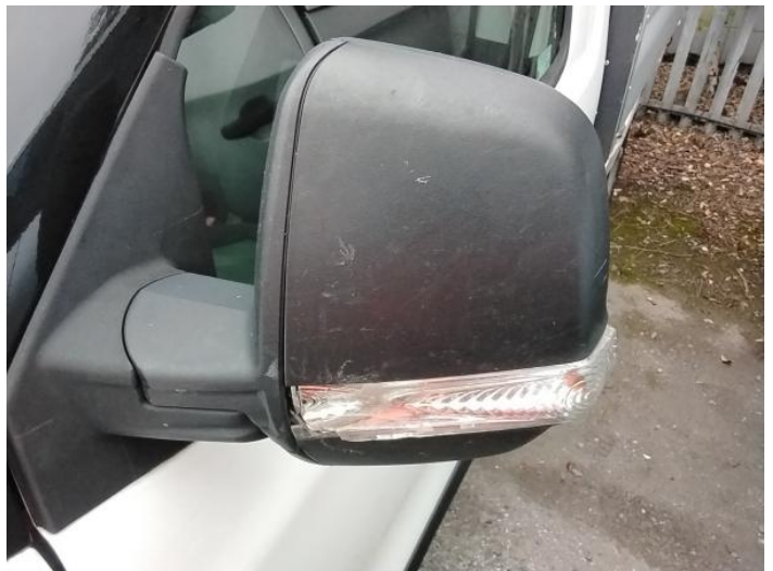
2: Door Mirror Assy nsf Broken Replace