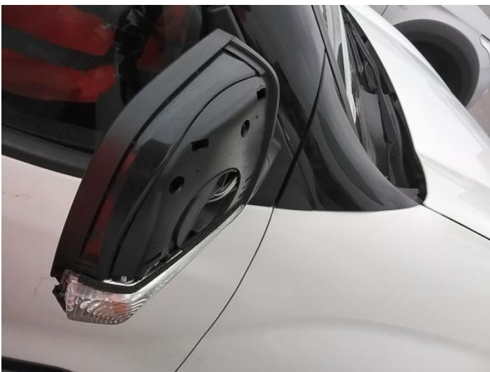
7: Door Mirror Assy osf Broken Replace