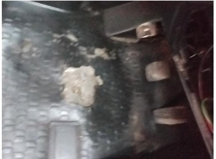
10: Carpets Front Holed Over 3mm