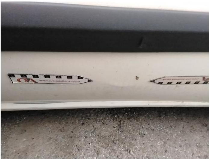
5: Door osf Dented Over 30mm