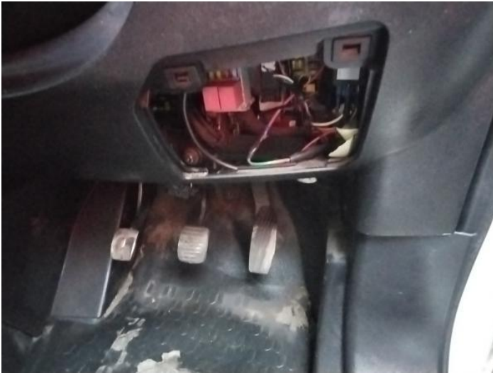
9: Fascia Panel Missing Replace