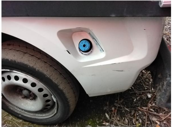
4: Qtr Panel nsr Scratched Over 25mm Thru Paint