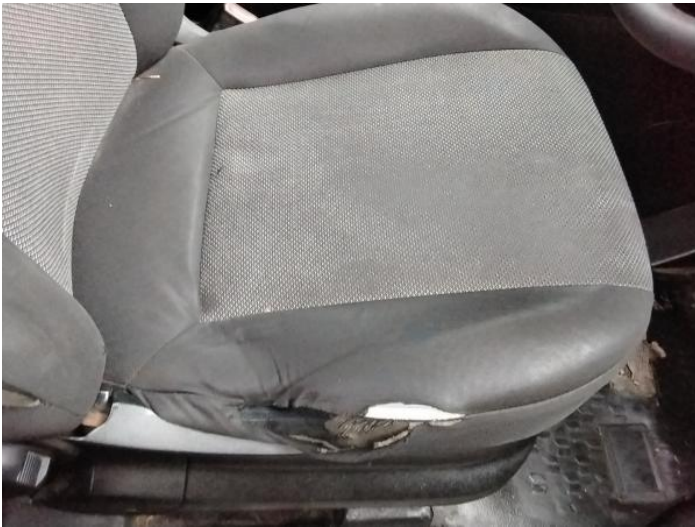
11: Seat Base Cover osf Torn Over 3mm