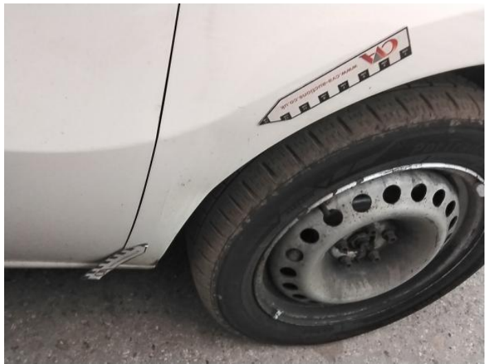
6: Wing osf Dented Over 30mm