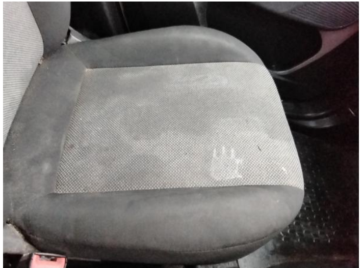
12: Seat Base Cover nsf Soiled Heavy