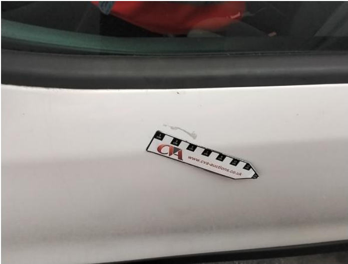
3: Door nsf Scratched Over 25mm Thru Paint