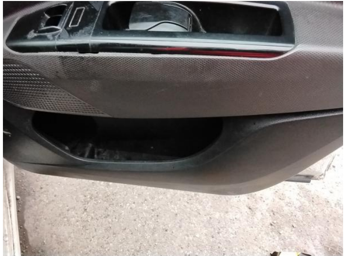
16: Door Pad osf Broken Replace