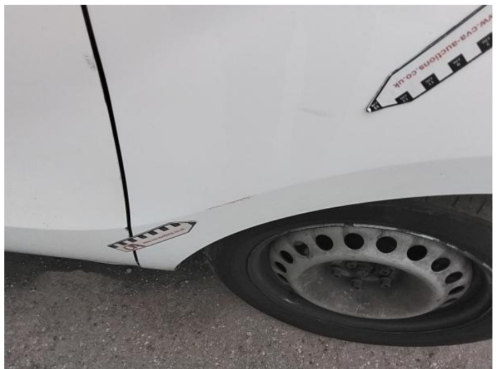
14: Wing osf Scratched Over 25mm Thru Paint