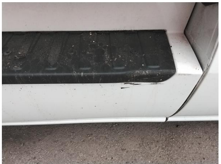
8: Qtr Panel osr Scratched Over 25mm Thru Paint