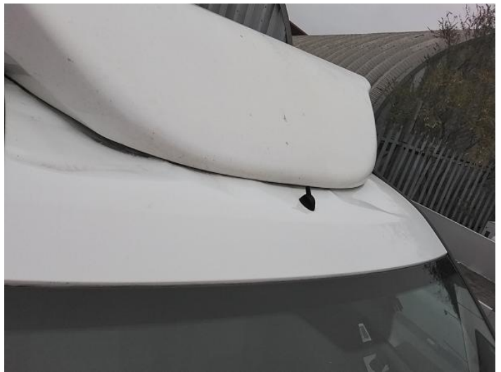
12: Roof Dented Over 30% Of Panel