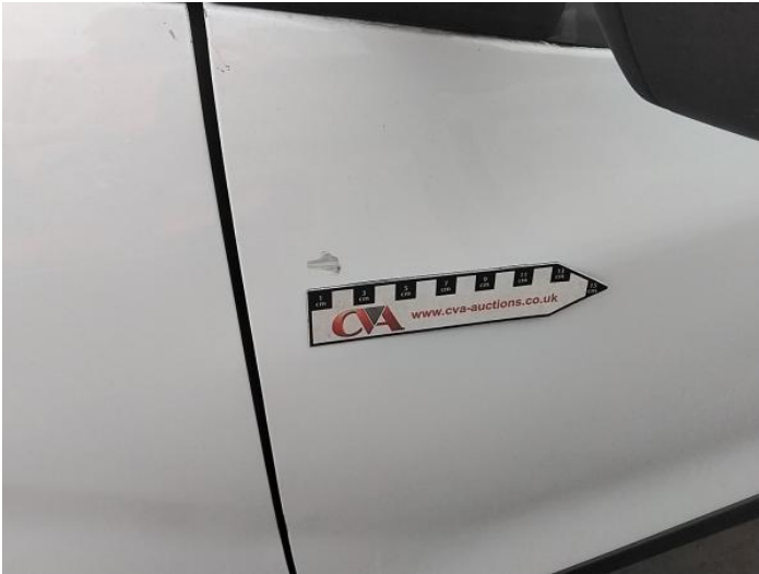
3: Door nsf Scratched UpTo 25mm Thru Paint