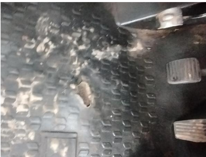
19: Carpets Front Holed Over 3mm