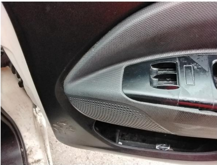
17: Switches And Controls Broken Replace