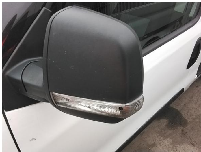
2: Door Mirror Assy nsf Broken Replace