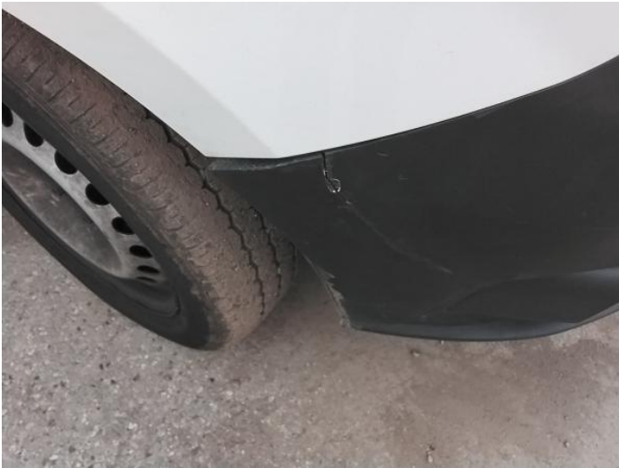
15: Bumper Front Cracked Over 25mm