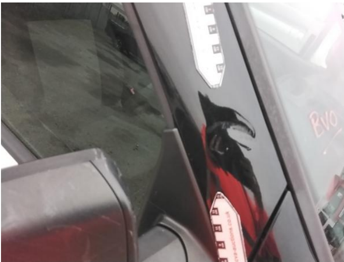
11: A Post os Dented With Paint Damage