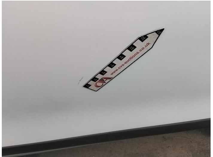
4: Door nsf Scratched Over 25mm Thru Paint