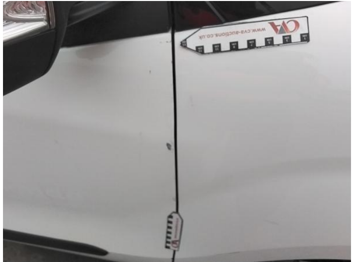
10: Door osf Scratched Over 25mm Thru Paint