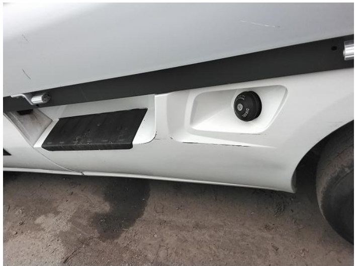
6: Qtr Panel nsr Scratched Over 25mm Thru Paint