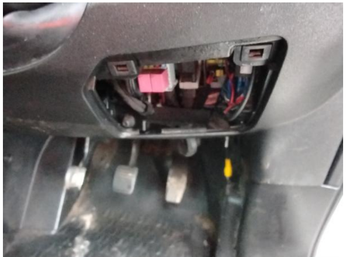
18: Fascia Panel Missing Replace