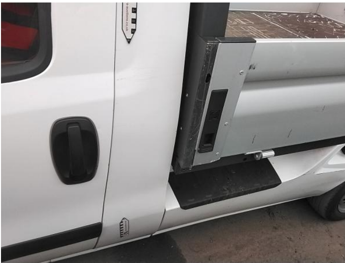
5: B Post ns Scratched Over 25mm Not Thru Paint