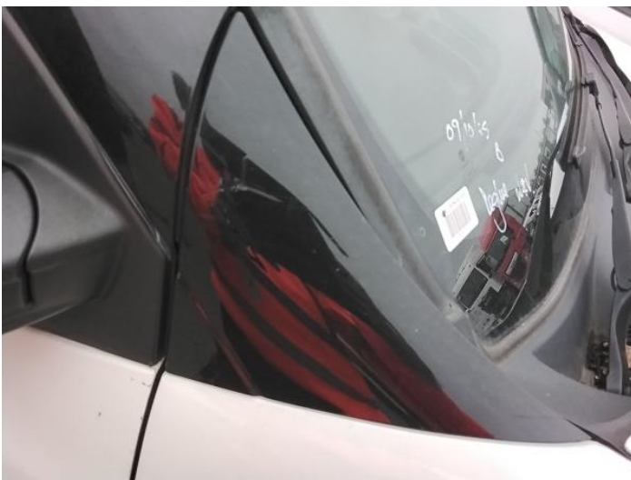
13: Door Moulding osf Broken Replace