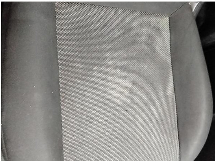
21: Seat Base Cover nsf Burn Over 3mm