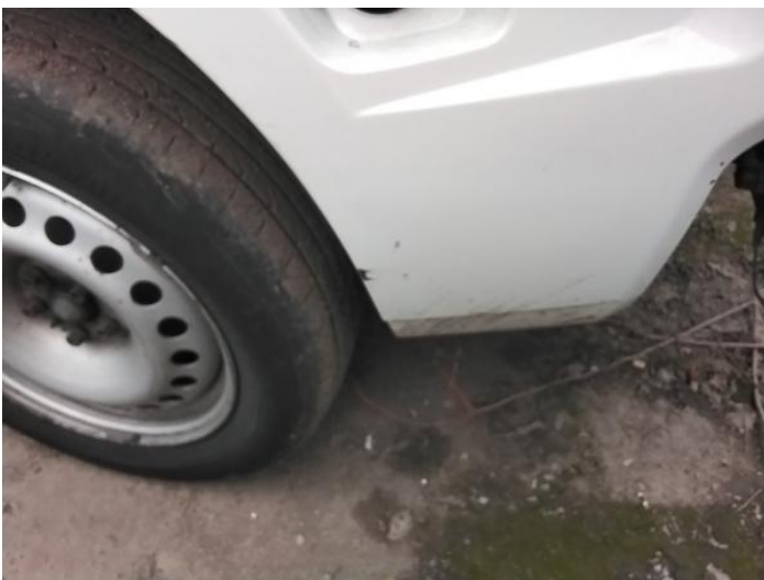
7: Qtr Panel nsr Scratched Over 25mm Thru Paint