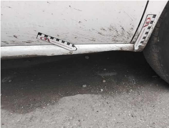
9: Sill os Dented With Paint Damage