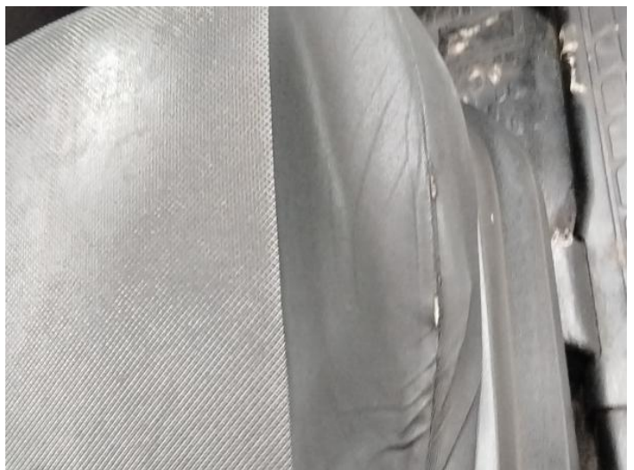
20: Seat Base Cover osf Torn Over 3mm