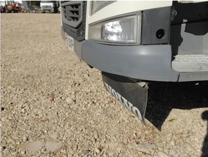
4: Bumper Front Moulding Scuffed (Unpainted) UpTo 100mm