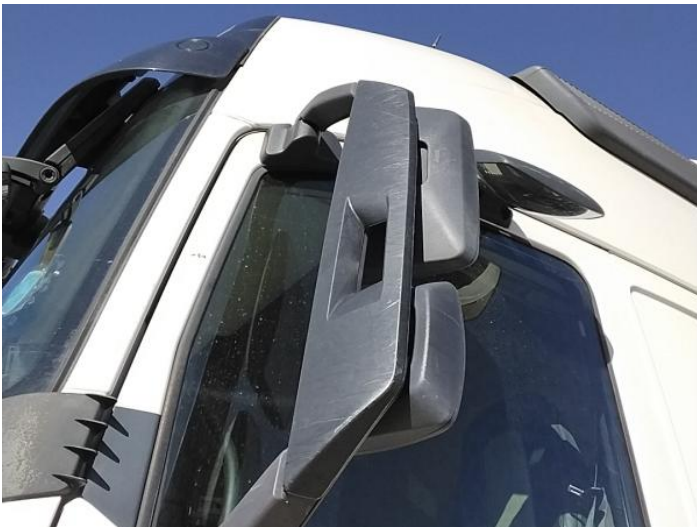
7: Door Mirror Assy nsf Scuffed (Unpainted) UpTo 100mm