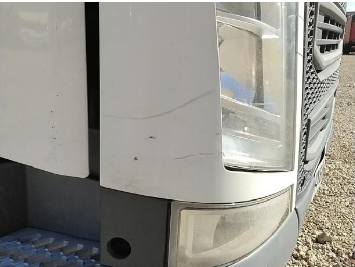
1: Fog Lamp Surround os Scratched (Painted) UpTo 25mm Thru Paint