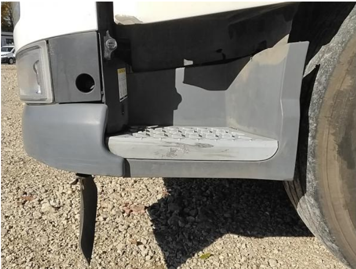
5: Other N/A N/A