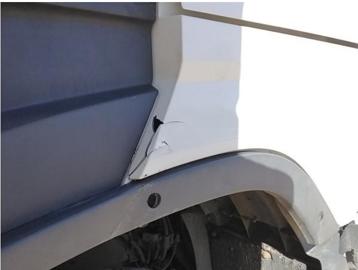
8: Other N/A N/A