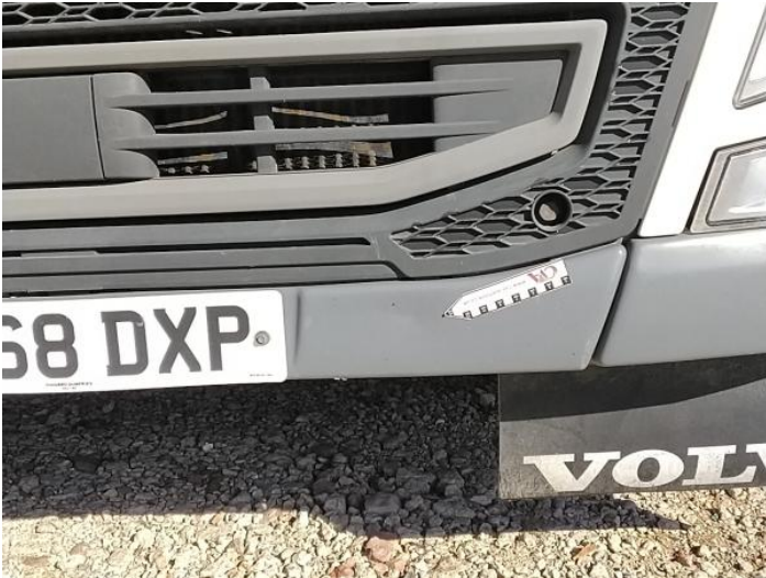
3: Bumper Front Dented Between 10mm + 30mm