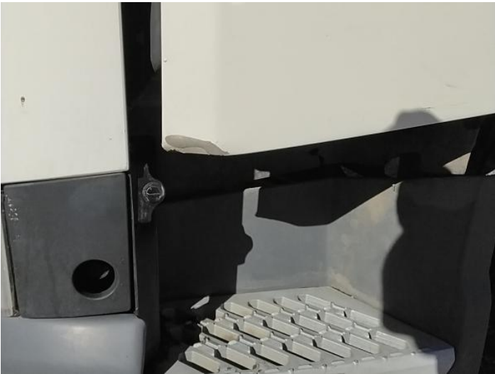
6: Door nsf Dented With Paint Damage