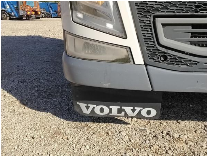
2: Other N/A N/A