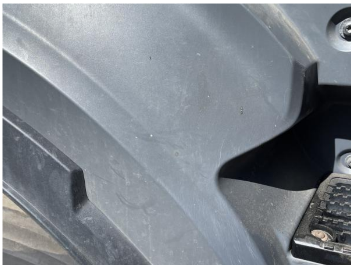
1: Door Moulding of Scuffed (Unpainted) Over 100mm