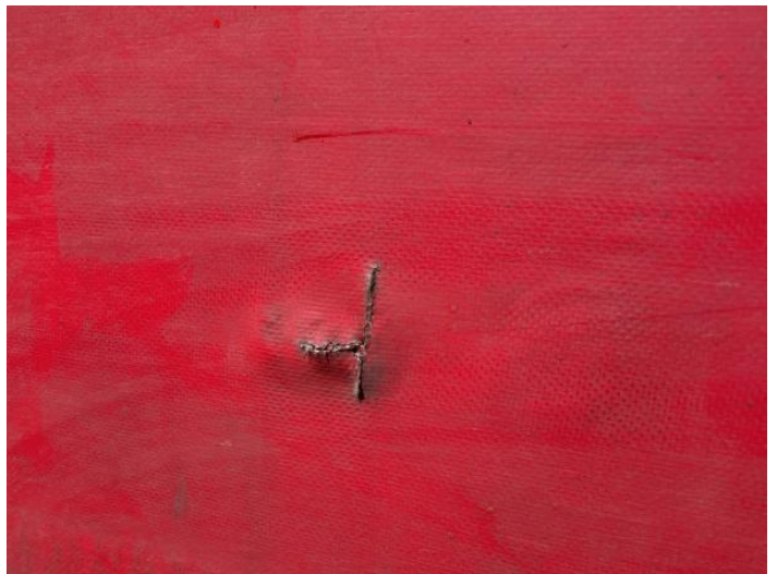
3: Bumper Front Moulding Scuffed (Unpainted) Over 100mm