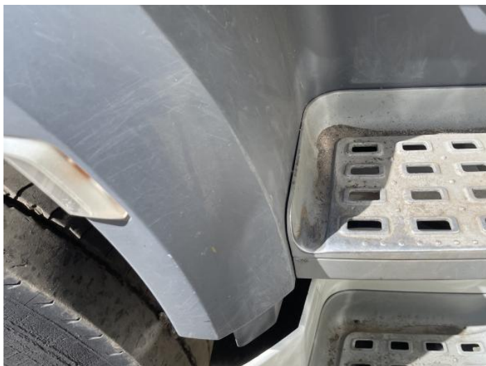
1: Door Moulding of Scuffed (Unpainted) Over 100mm