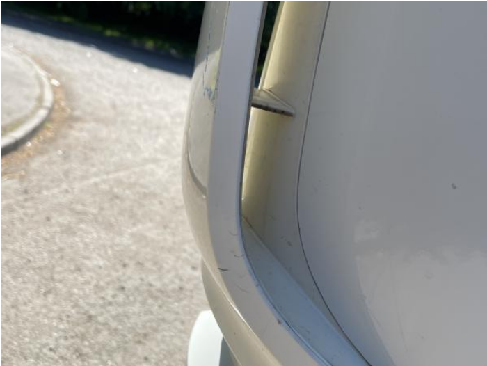
3: Wing osf Scratched UpTo 25mm Thru Paint