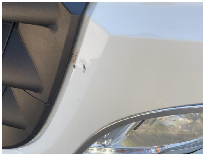
2: Bumper Front Moulding Scratched (Painted) Over 25mm Thru Paint