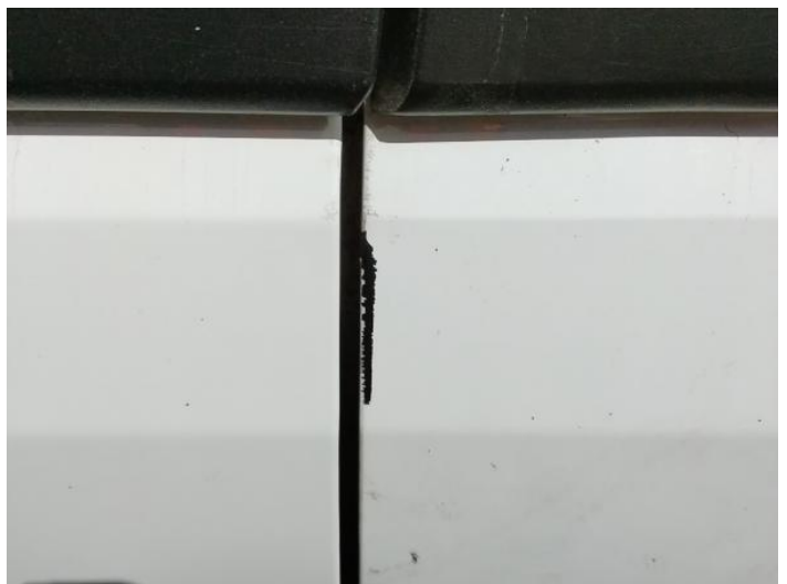
8: Panel Front Scratched Over 25mm Thru Paint