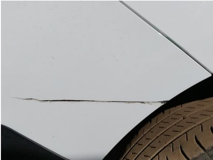
10: Bumper Front Scratched Over 100mm Thru Paint