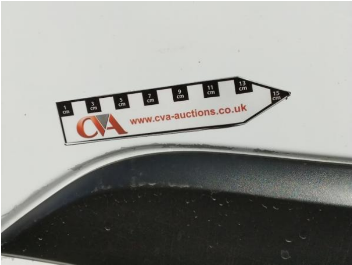
9: Door osf Scratched Over 25mm Thru Paint