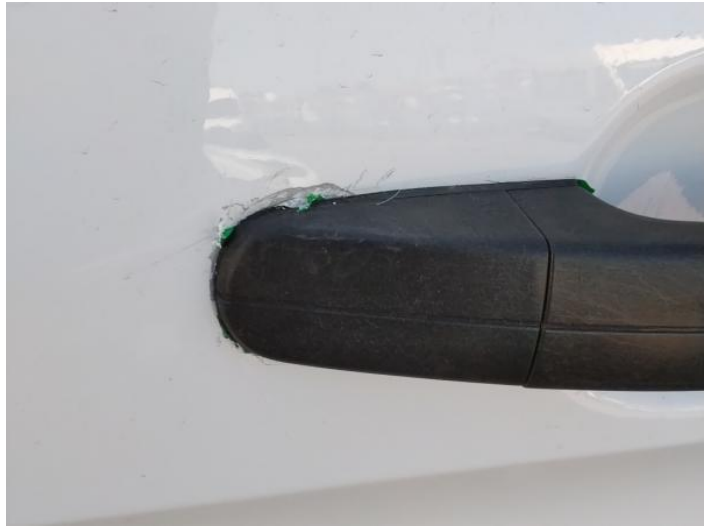
4: Door nsf Scratched Over 25mm Thru Paint