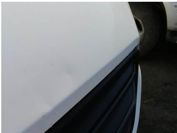
1: Bonnet Dented Over 30mm