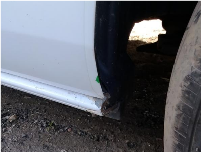
3: Sill ns Chipped Over 5mm