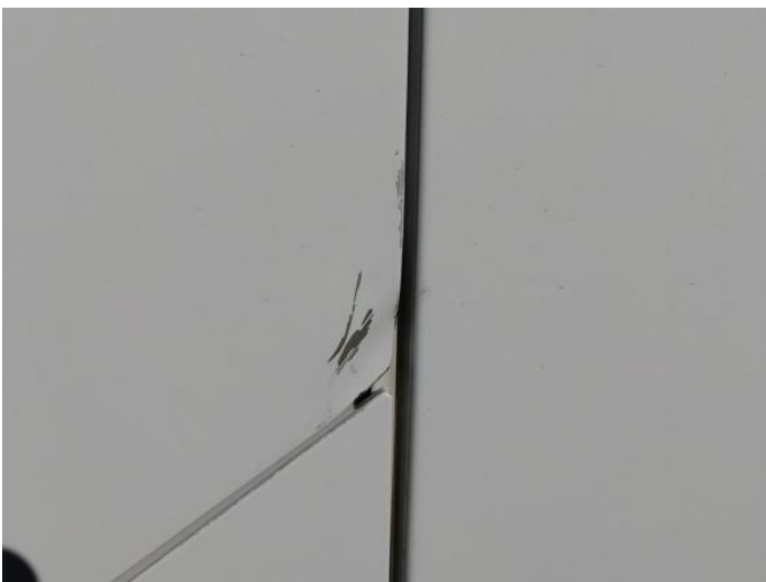
7: Door osf Dented With Paint Damage