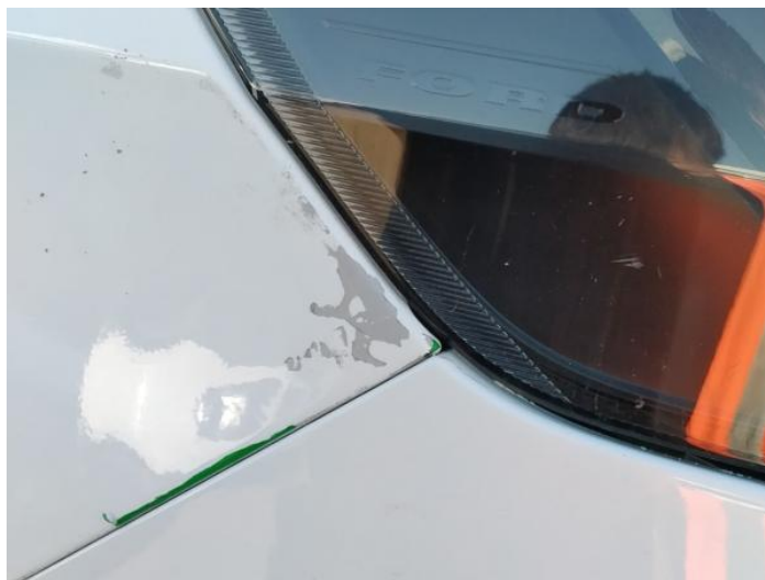
2: Wing nsf Chipped Over 5mm