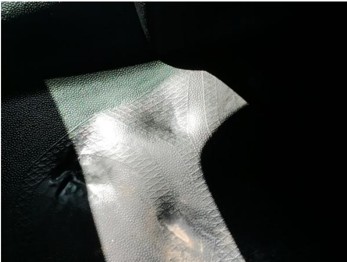
11: Carpets Front Holed Over 3mm