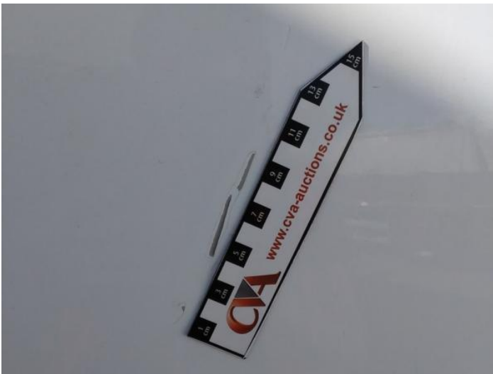
5: Panel Rear Scratched Over 25mm Thru Paint