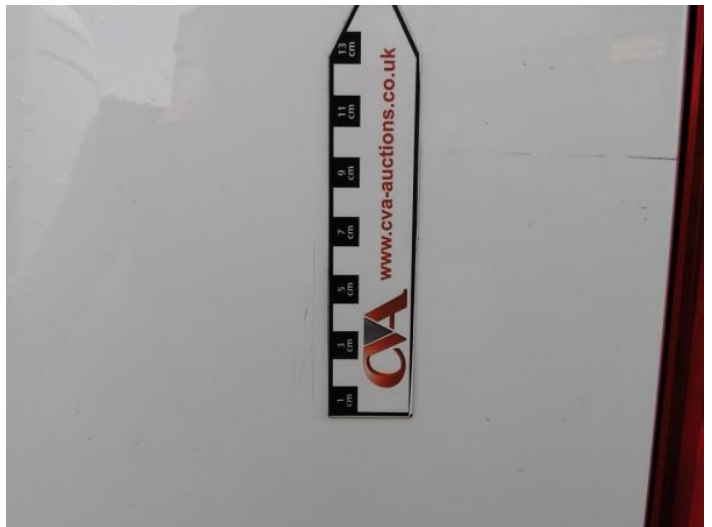
6: Panel Rear Scratched Over 25mm Thru Paint