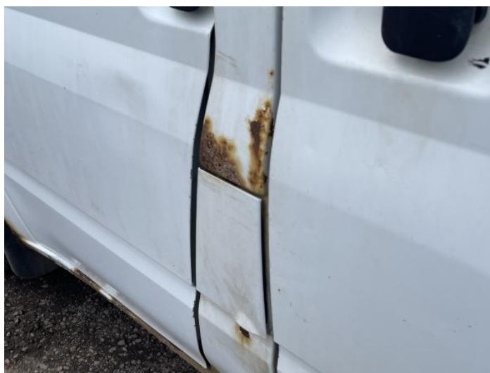
8: B Post ns Rusted Over 5mm