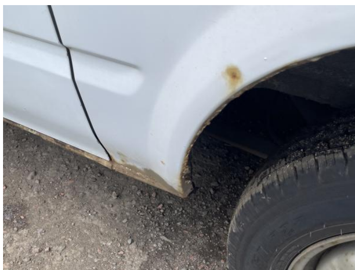
6: Qtr Panel nsr Rusted Over 5mm