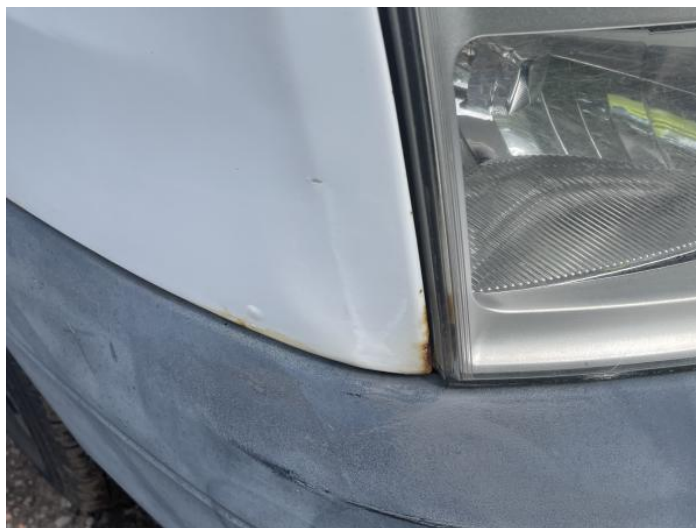
2: Wing of Dented Over 30mm