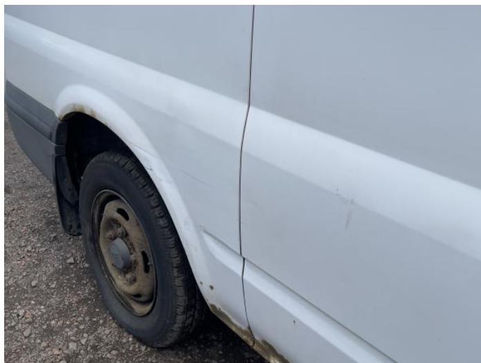
4: Qtr Panel osr Dented With Paint Damage