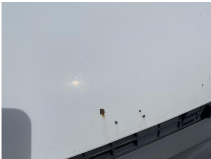
1: Bonnet Rusted UpTo 5mm