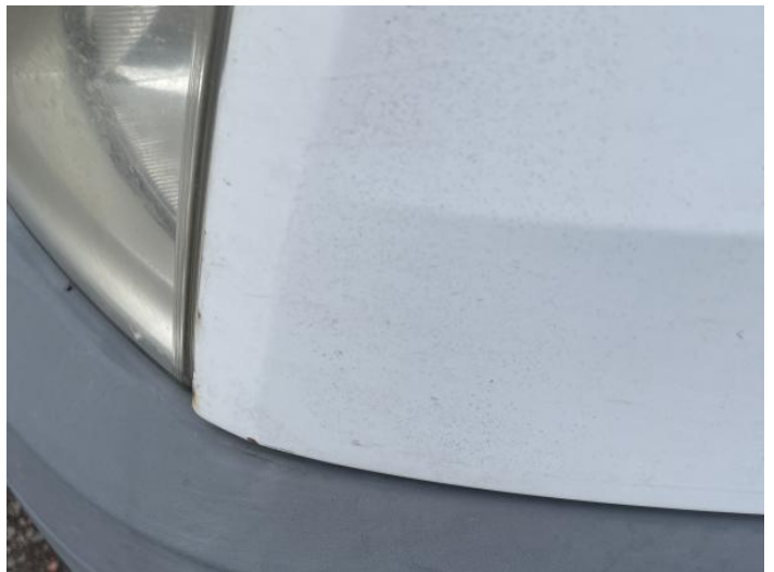
9: Door nsf Rusted Over 5mm