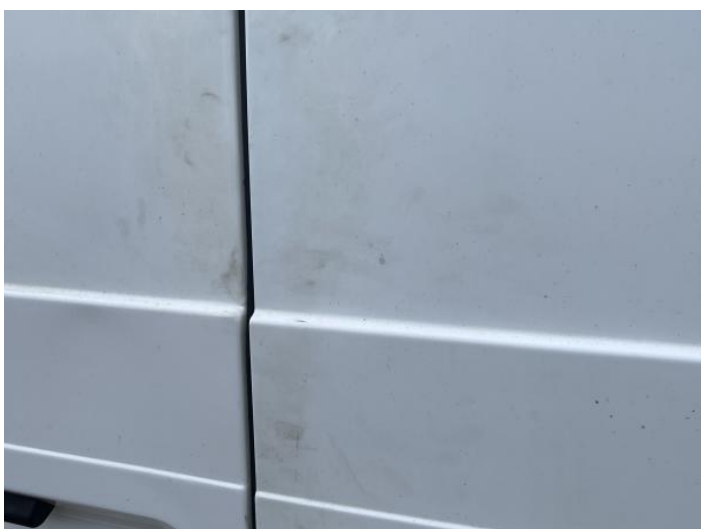
5: Tailgate Dented With Paint Damage