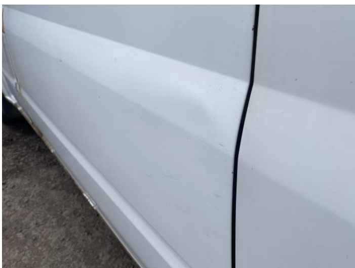
7: Door nsr Dented Over 30mm