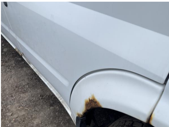
3: Door osf Dented Over 30mm