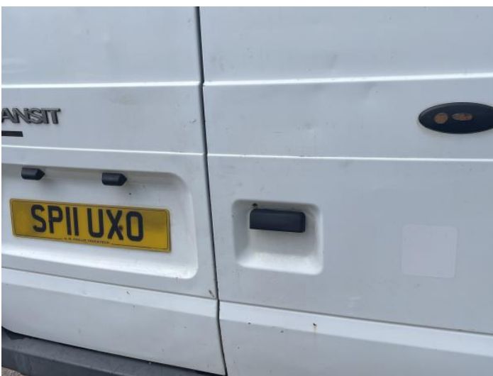
7: Tailgate Dented Over 30mm