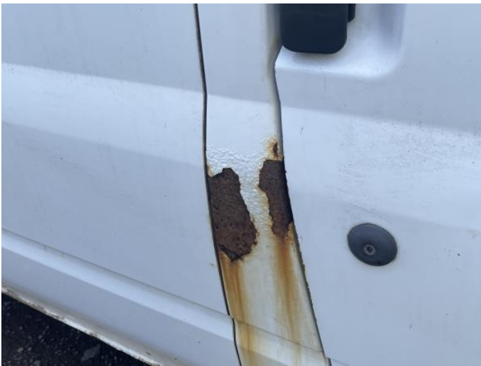
5: B Post os Rusted Over 5mm