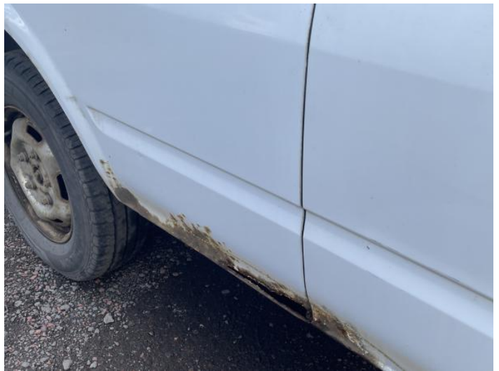
6: Qtr Panel osr Rusted Over 5mm