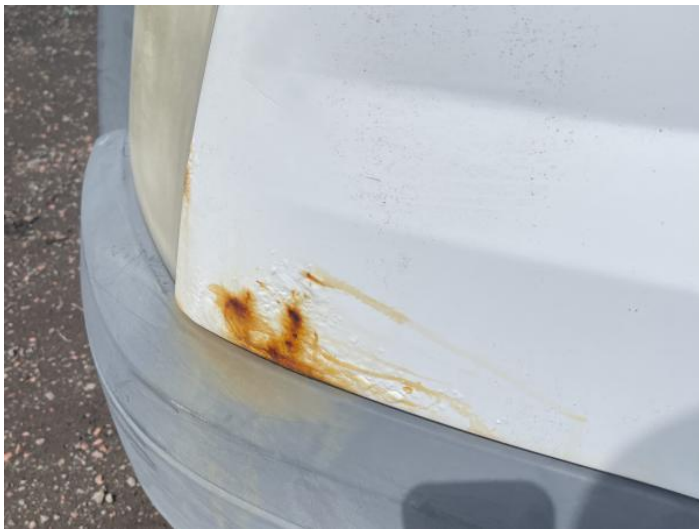
11: Wing nsf Rusted Over 5mm