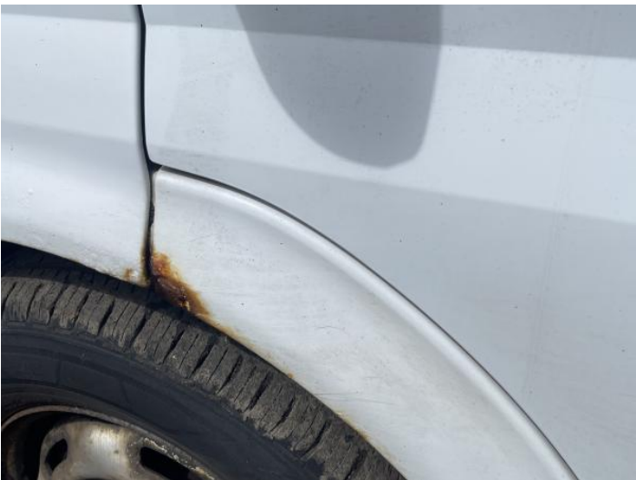
10: Door nsf Rusted Over 5mm