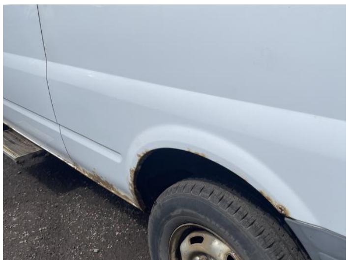
8: Qtr Panel nsr Rusted Over 5mm