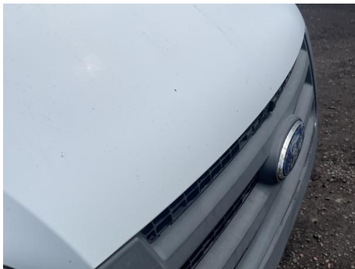
2: Bonnet Rusted Over 5mm