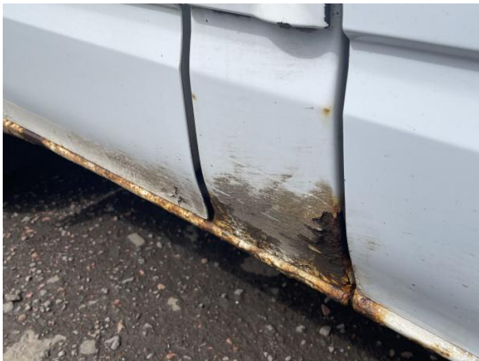
9: Sill ns Rusted Over 5mm