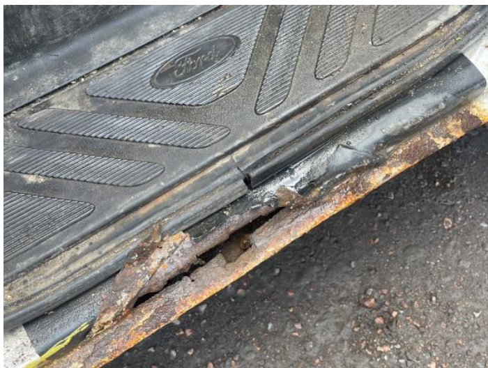
1: Sill os Hole UpTo 10mm