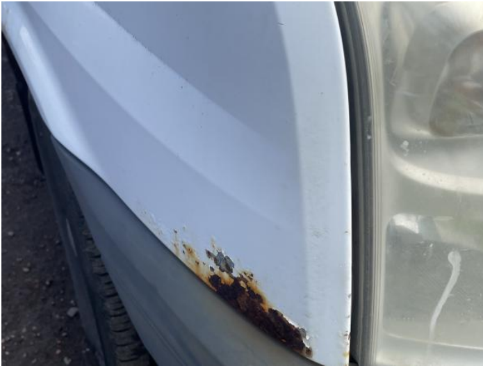
3: Bonnet Rusted Over 5mm