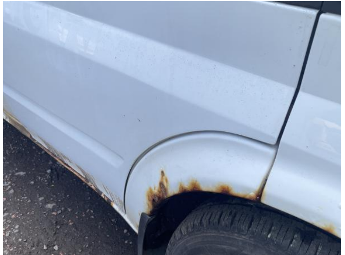
4: Door osf Rusted Over 5mm