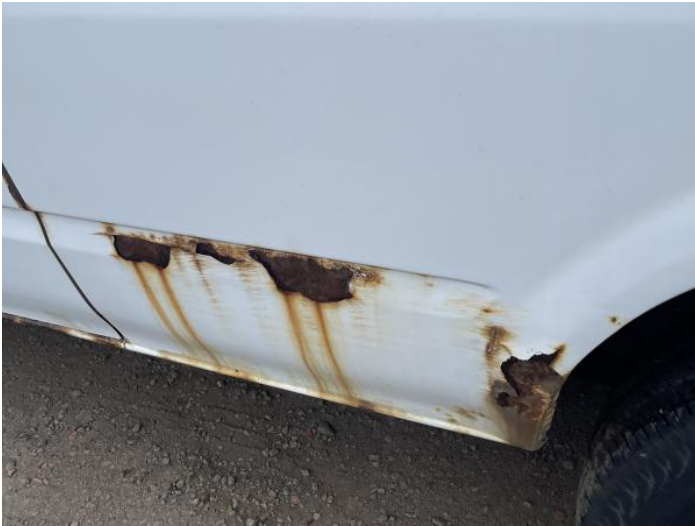
9: Qtr Panel nsr Rusted Over 5mm