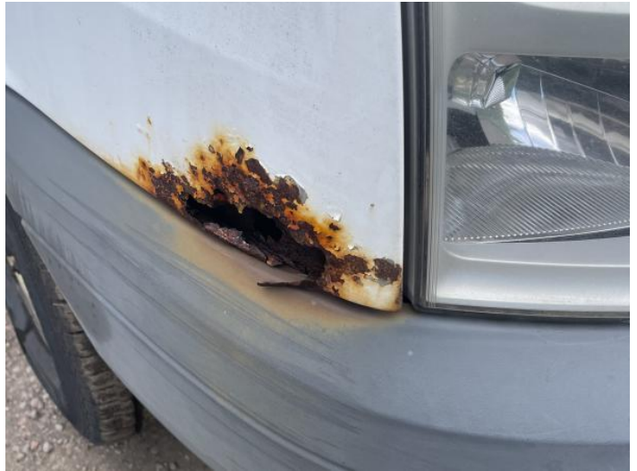
4: Wing osf Hole Over 10mm