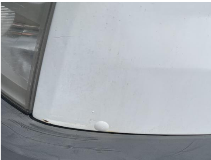
13: Wing nsf Rusted Over 5mm