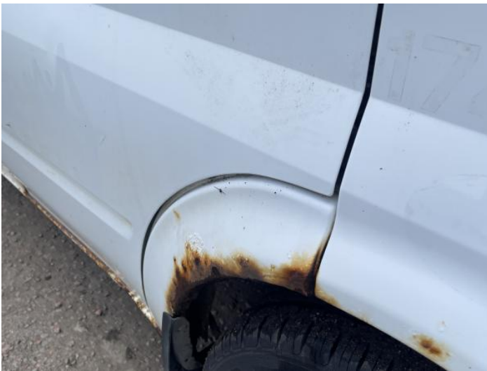
5: Door osf Rusted Over 5mm