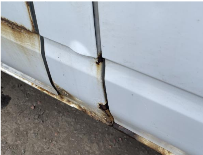
11: B Post ns Rusted Over 5mm