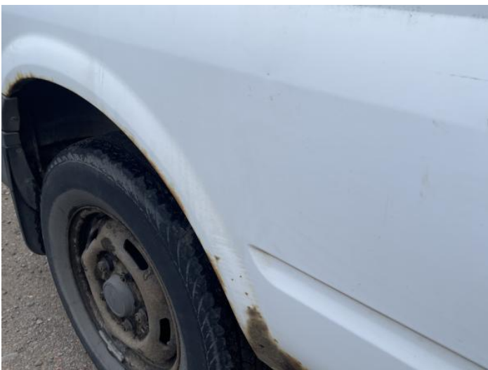
7: Qtr Panel osr Rusted Over 5mm