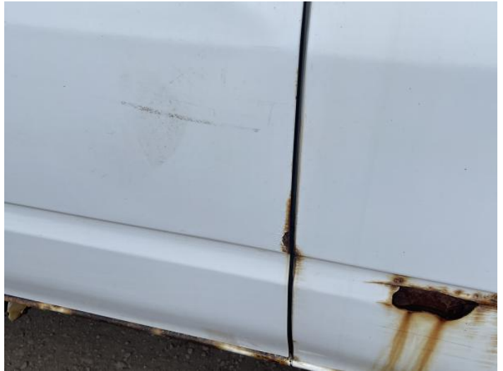
10: Door nsr Dented Over 30mm