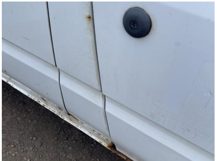
6: B Post os Rusted Over 5mm