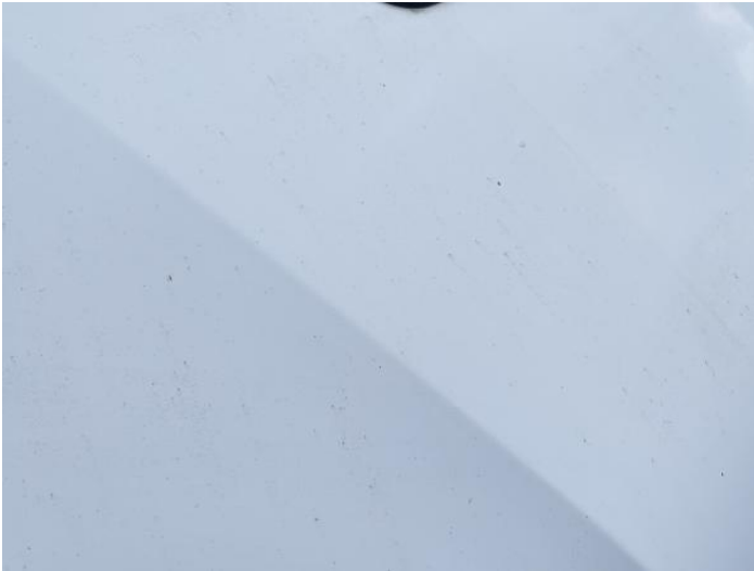
3: Bonnet Chipped Multiple Chips