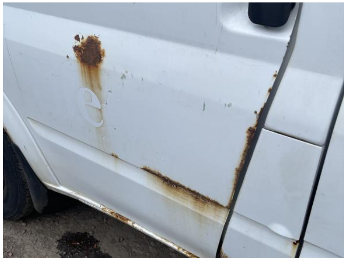
12: Door nsf Rusted Over 5mm