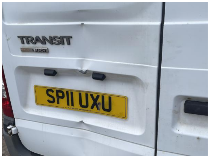
8: Tailgate Dented With Paint Damage