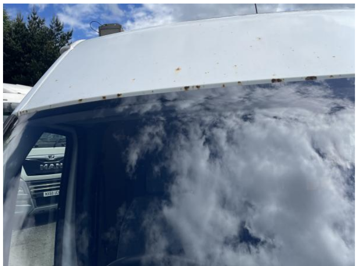
14: Roof Rusted Over 5mm