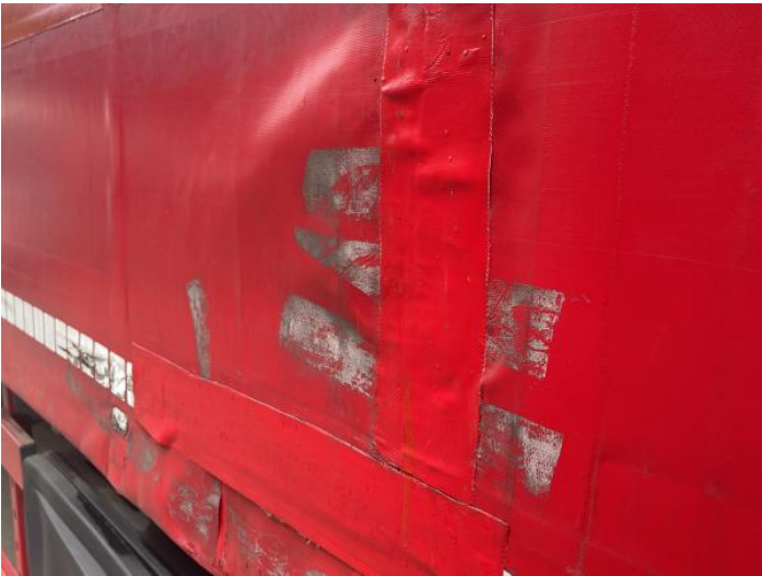
6: Qtr Panel nsr Dented With Paint Damage