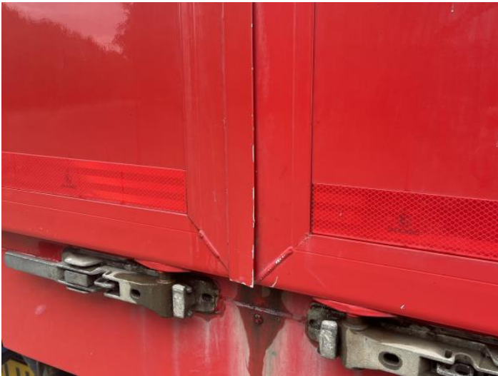
5: Tailgate Dented Over 30mm