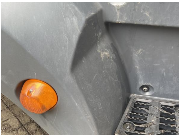
1: Door Moulding of Scuffed (Unpainted) Up To 100mm