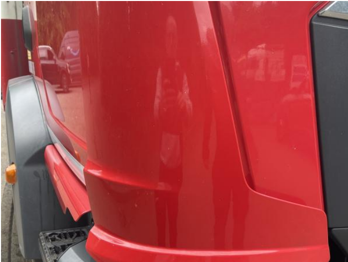
3: Wing osf Chipped 1 To 5