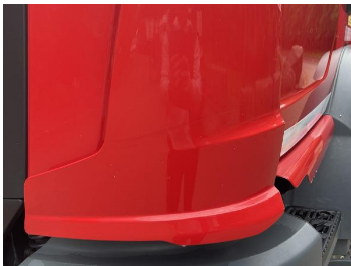
2: Wings of Chipped 1 To 5