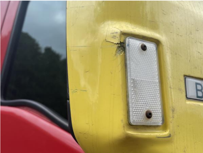
4: Door Mirror Assy osf Broken Replace