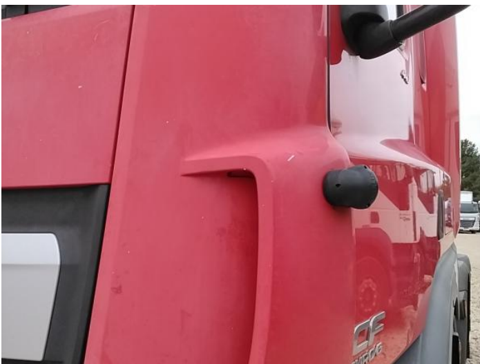
7: Wing nsf Scratched UpTo 25mm Thru Paint