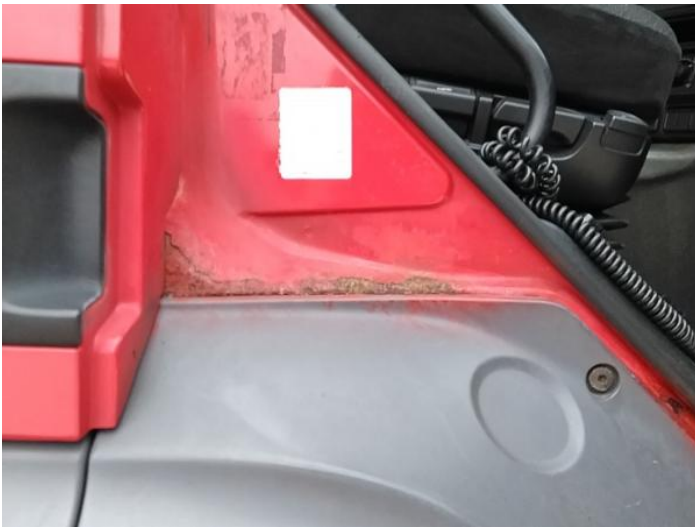
13: Other N/A N/A