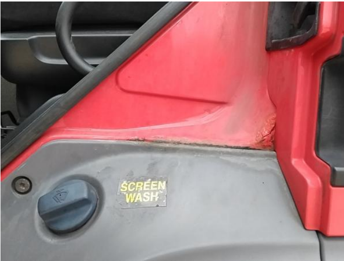
12: Other N/A N/A