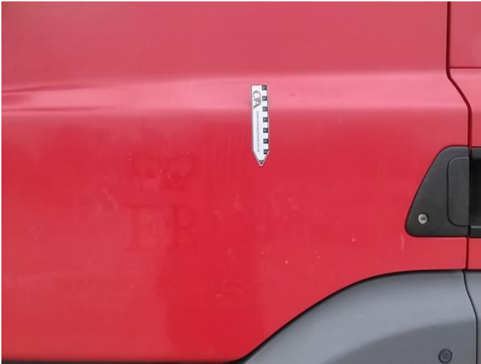
9: Door nsf Scratched UpTo 25mm Not Thru Paint