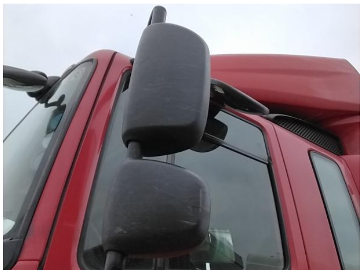
8: Door Mirror Assy nsf Scuffed (Unpainted) UpTo 100mm