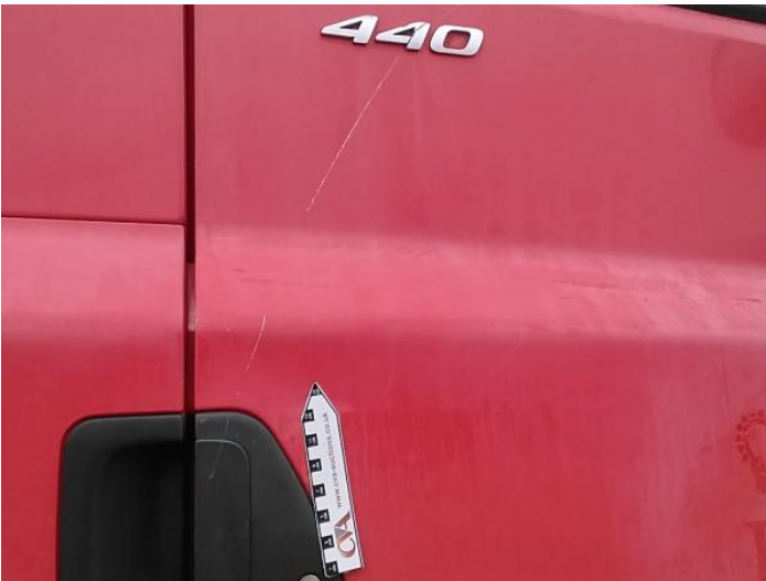
14: Door osf Scratched Over 25mm Thru Paint