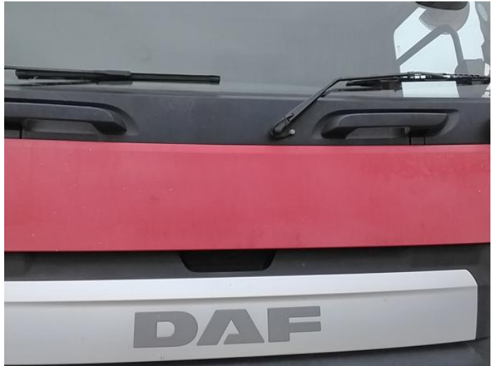
4: Bonnet Chipped Multiple Chips