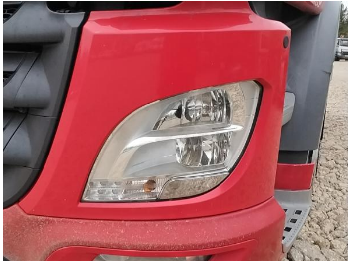
6: Other N/A N/A