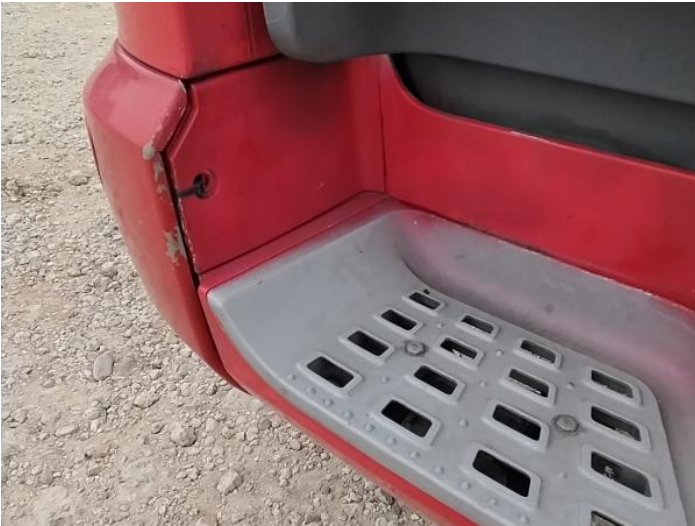
10: Other N/A N/A