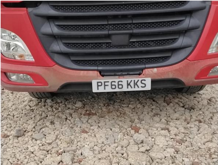
3: Other N/A N/A