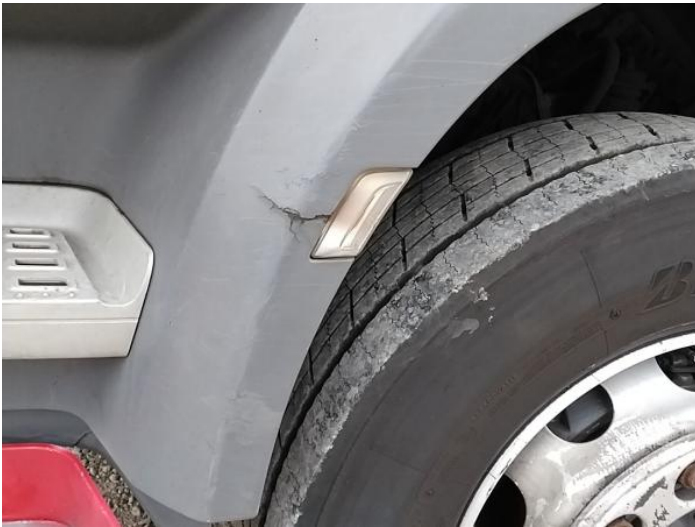
11: Other N/A N/A