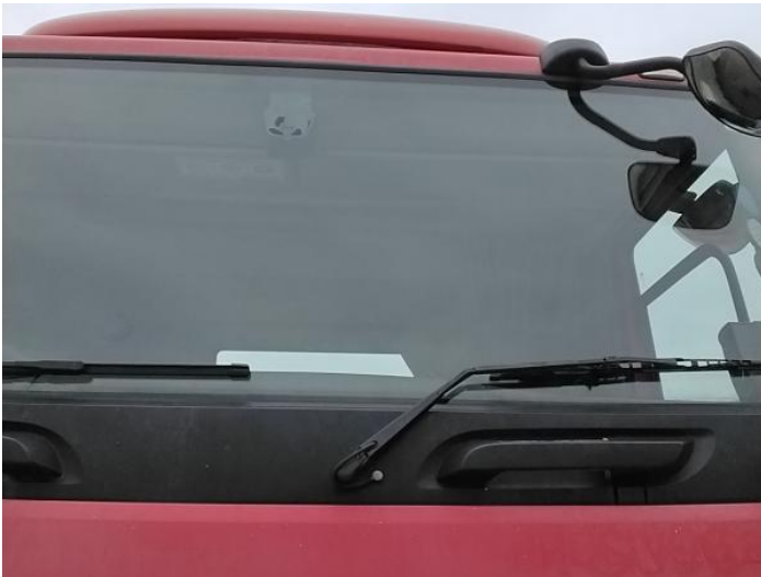
5: Screen Front Cracked Replace