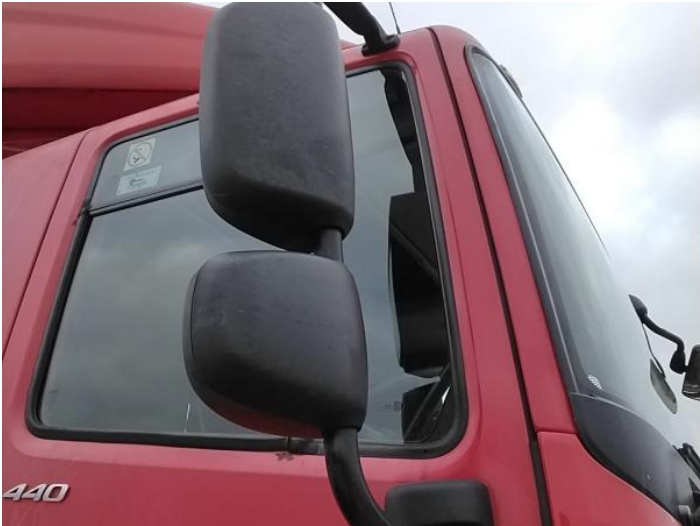
15: Door Mirror Assy osf Scuffed (Unpainted) UpTo 100mm