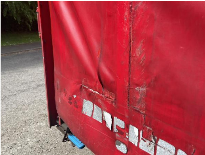
5: Qtr Panel osr Dented With Paint Damage