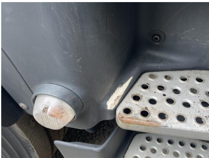
1: Door Moulding osf Scuffed (Unpainted) Over 100mm