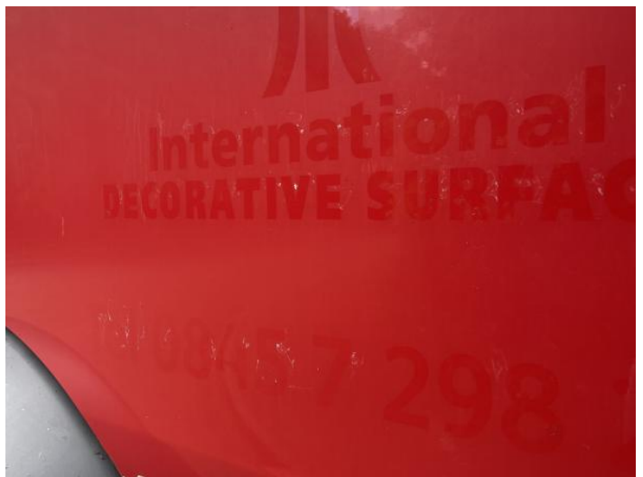
2: Door Moulding osf Scratched (Painted) Over 25mm Thru Paint