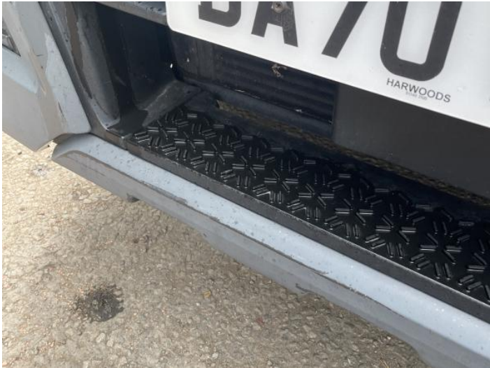
4: Bumper Front Moulding Scuffed (Unpainted) Over 100mm