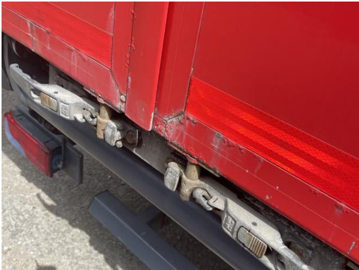
6: Tailgate Rusted Over 5mm