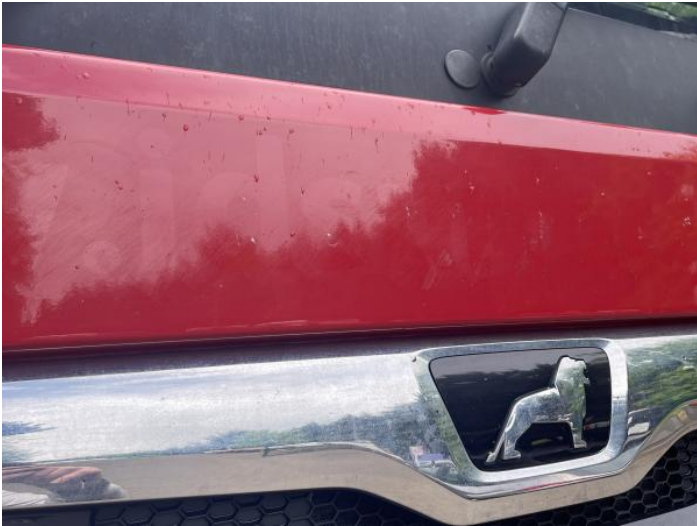
3: Bonnet Scratched Over 25mm Not Thru Paint