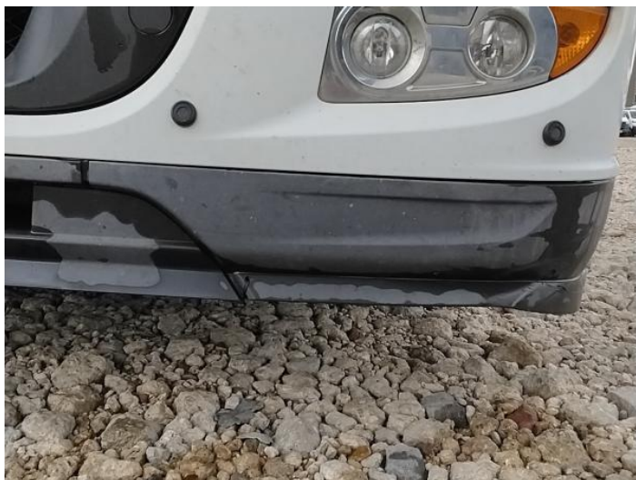
1: Bumper Front Moulding Broken Replace