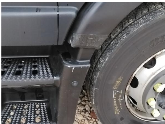
4: Other N/A N/A