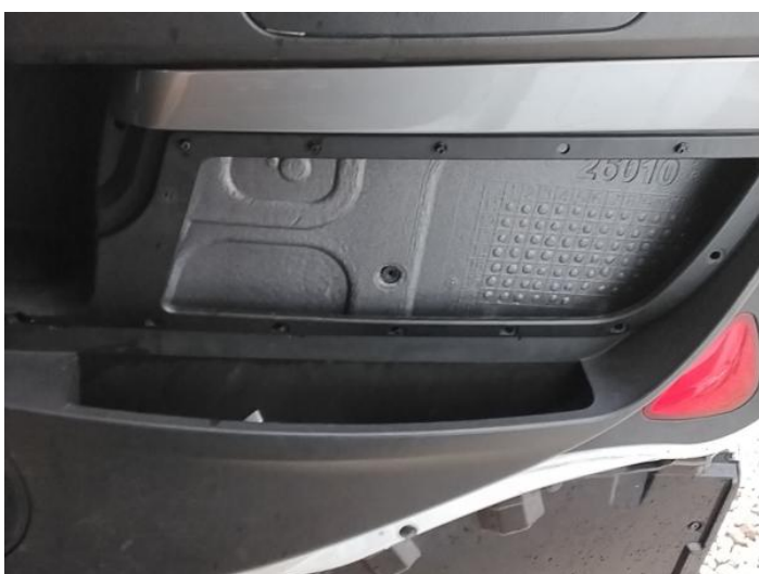
7: Other N/A N/A