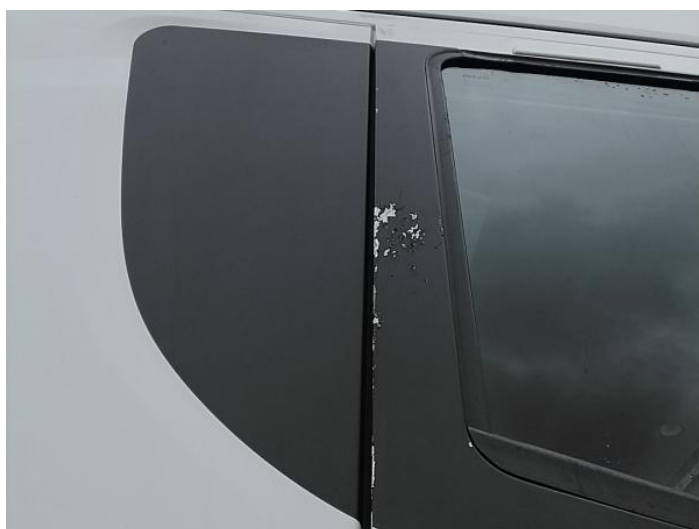
6: Other N/A N/A