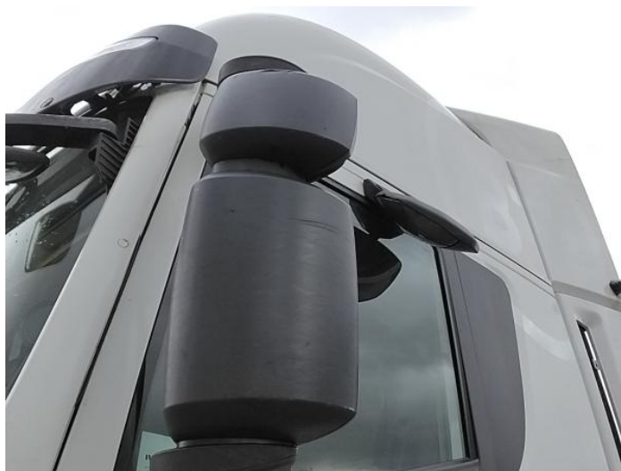
2: Door Mirror Assy nsf Scuffed (Unpainted) UpTo 100mm