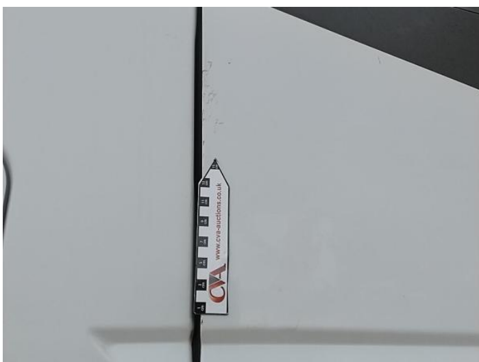
5: Door osf Scratched UpTo 25mm Thru Paint