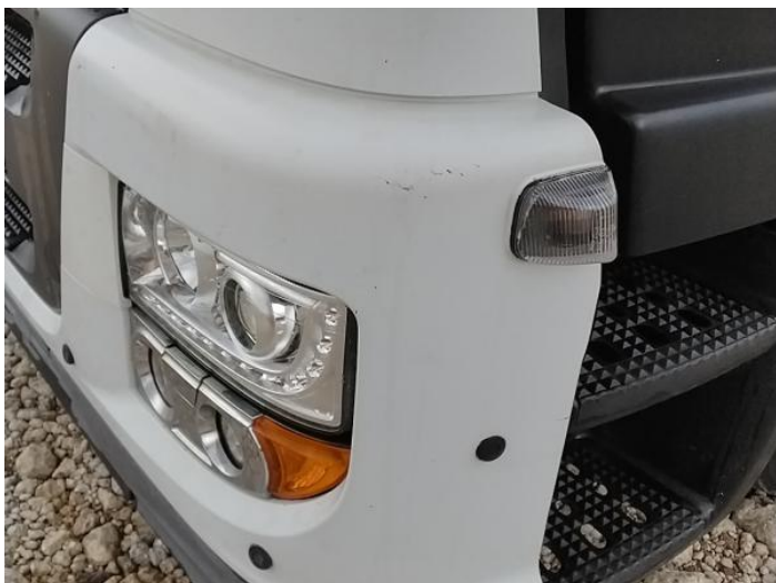
3: Fog Lamp Surround ns Scratched (Painted) UpTo 25mm Thru Paint