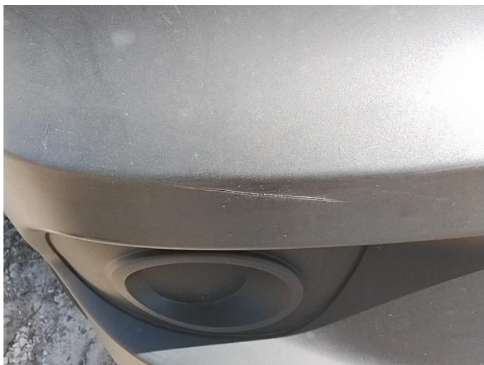
1: Bumper Front Moulding Scuffed (Unpainted) Over 100mm