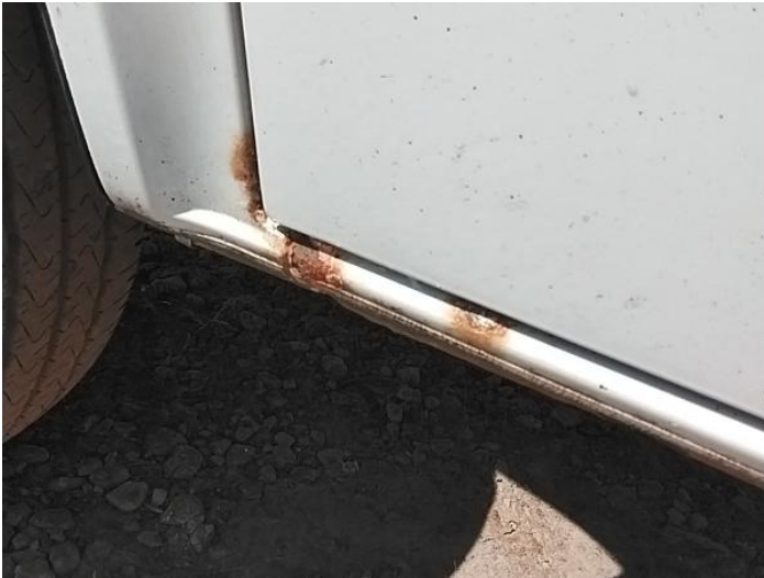
3: Sill os Chipped Multiple Chips