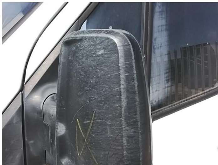
2: Door Mirror Assy osf Scuffed (Unpainted) Over 100mm