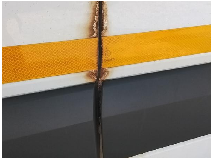
6: Qtr Panel nsr Chipped Multiple Chips