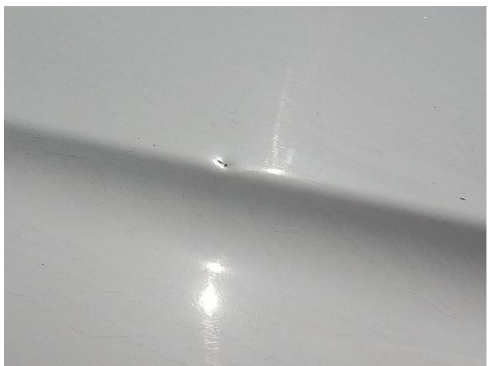
8: Bonnet Dented With Paint Damage