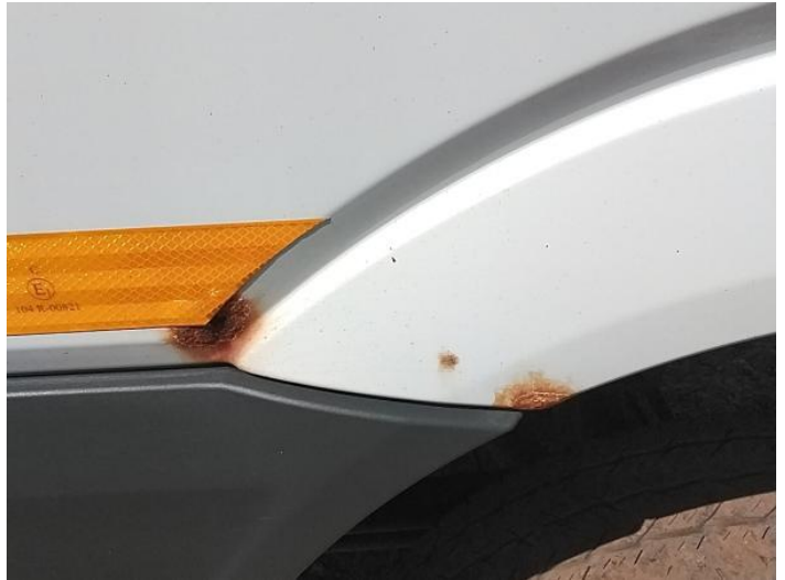
4: Qtr Panel osr Chipped Multiple Chips