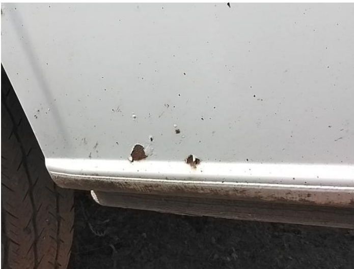
5: Qtr Panel osr Chipped Multiple Chips