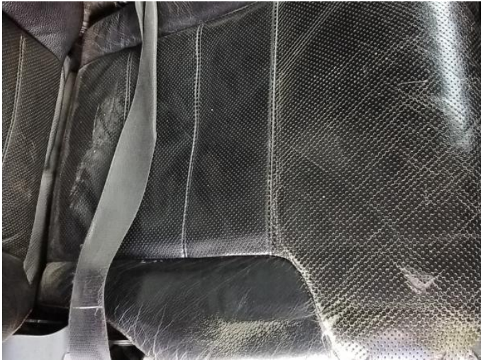
10: Seat Base Cover osf Torn Over 3mm