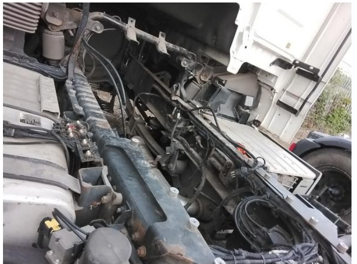
6: Unclassified Major Parts Missing Report Only