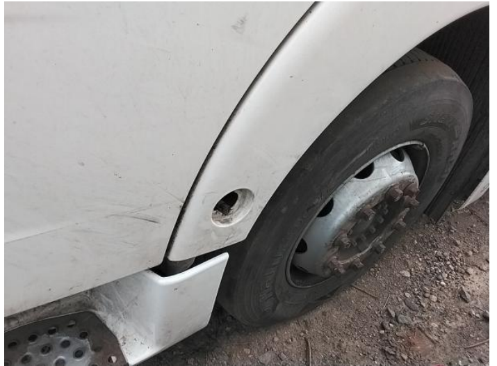
4: Flasher Side Repeater ns Missing Replace