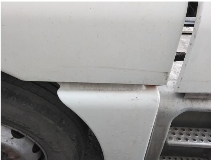
5: Wing nsf Scratched Over 25mm Thru Paint