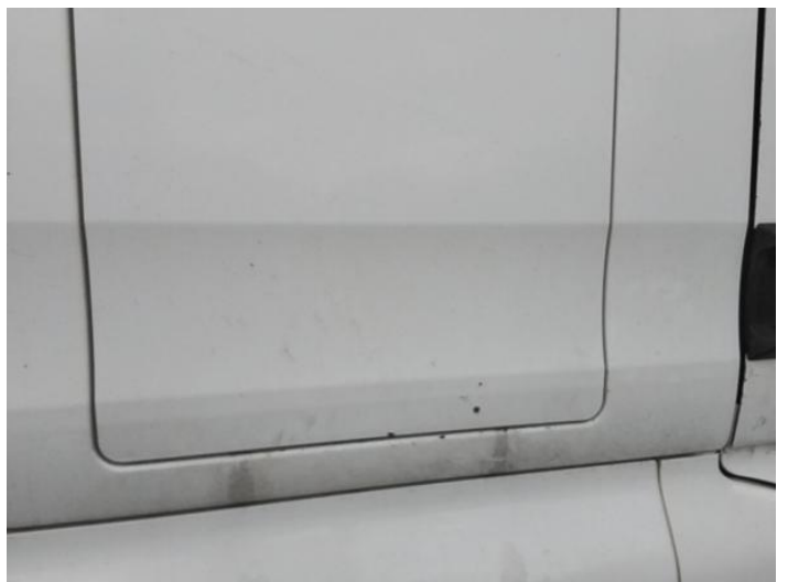
8: Qtr Panel osr Chipped Multiple Chips