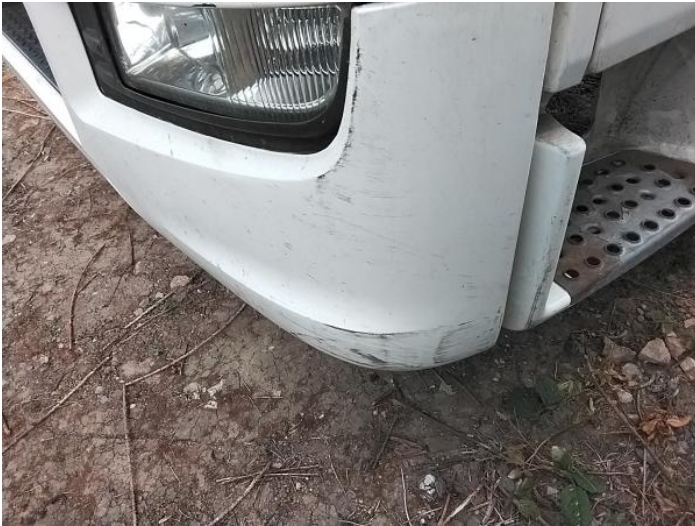
3: Bumper Front Scratched Over 100mm Thru Paint