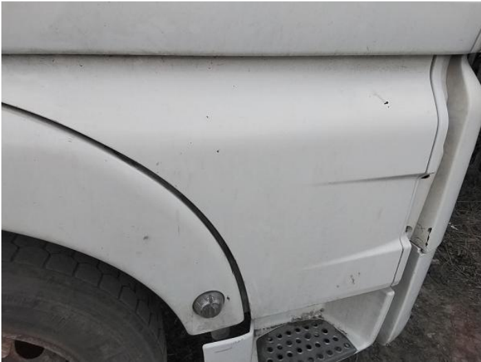
9: Door osf Chipped Multiple Chips