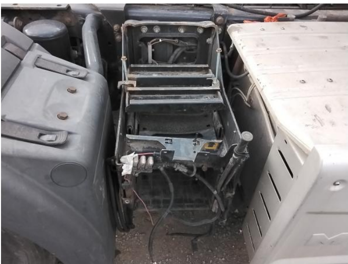
7: Unclassified Major Parts Missing Report Only