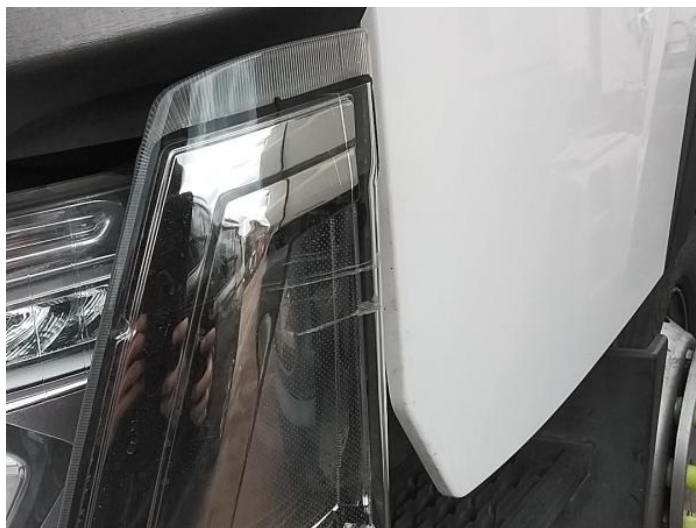
2: Headlamp os Broken Replace