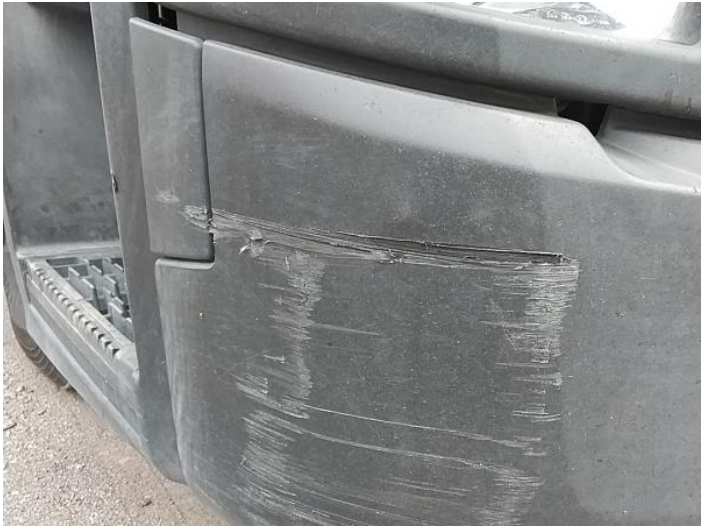
4: Bumper Front Scratched Over 25mm Not Thru Paint