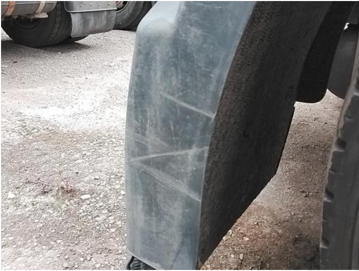
3: Qtr Panel nsr Scratched Over 25mm Not Thru Paint