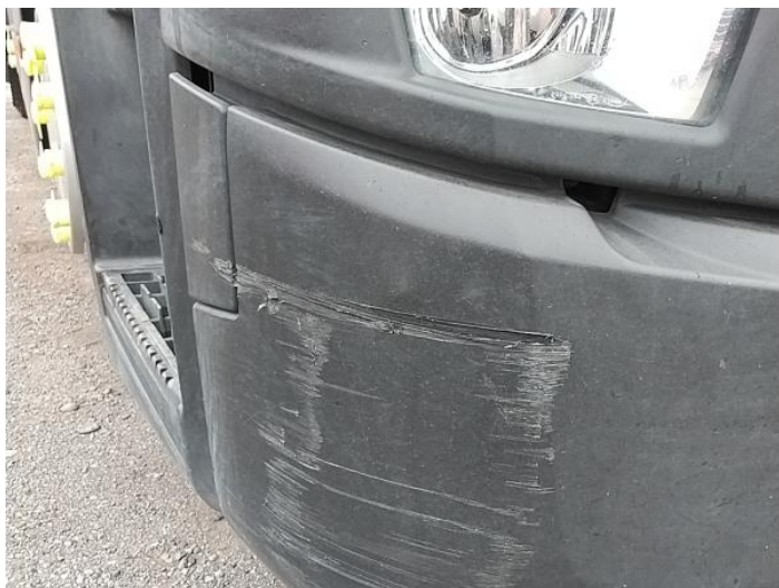
1: Bumper Front Scratched Over 25mm Not Thru Paint