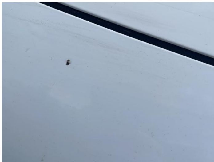
2: Bumper Front Chipped 1 To 5