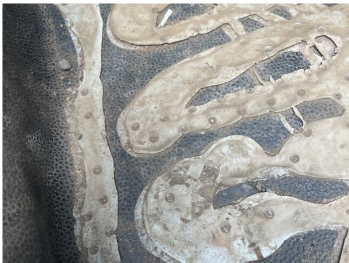
1: Carpets Front Soiled Heavy