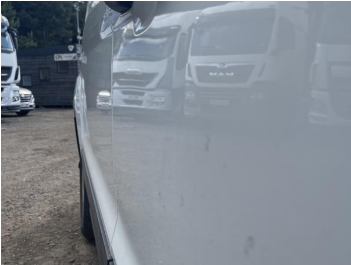
3: Door osf Dented 2 Or Less UpTo 10mm