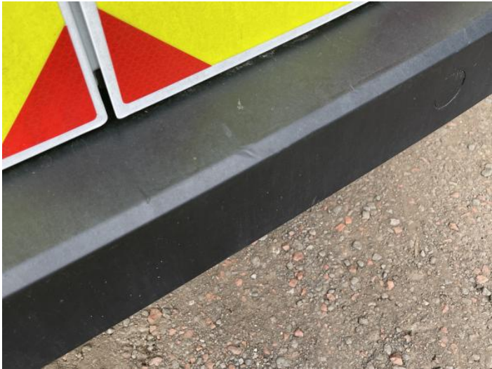
4: Bumper Rear Moulding Scuffed (Unpainted) UpTo 100mm