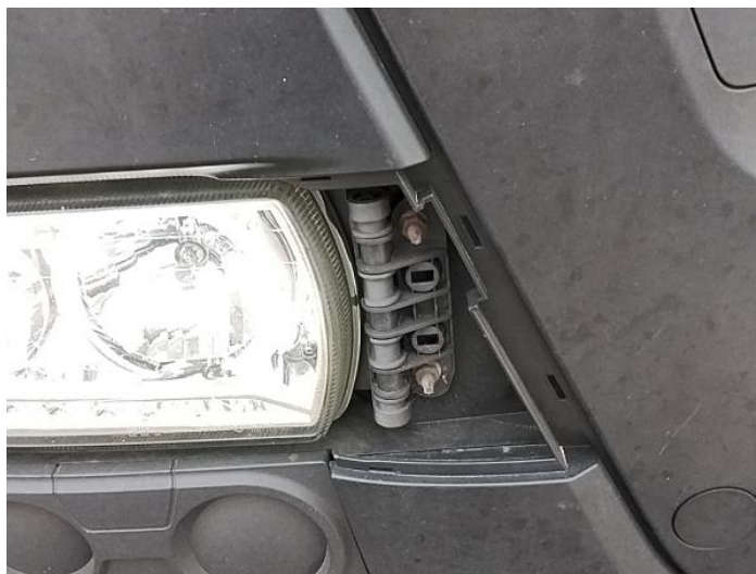
2: Bumper Front Missing Replace