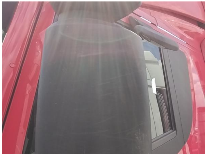
3: Bumper Front Scratched Over 25mm Not Thru Paint