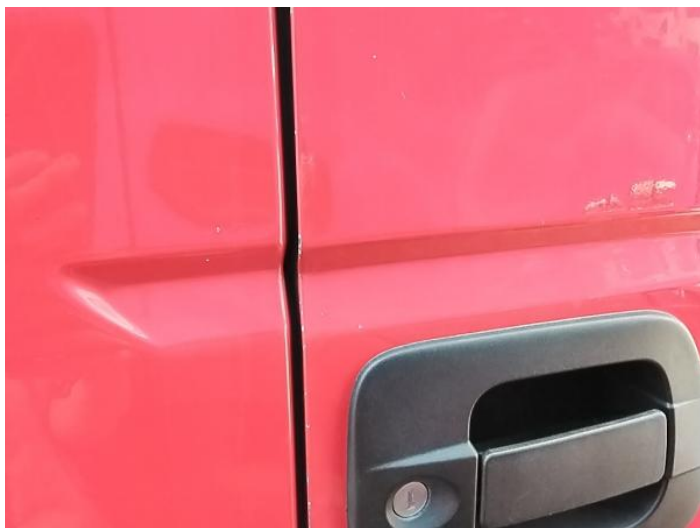
1: Door nsf Chipped Multiple Chips