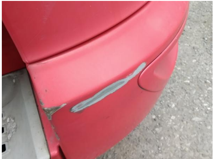
6: Bumper Front Scratched Over 100mm Thru Paint