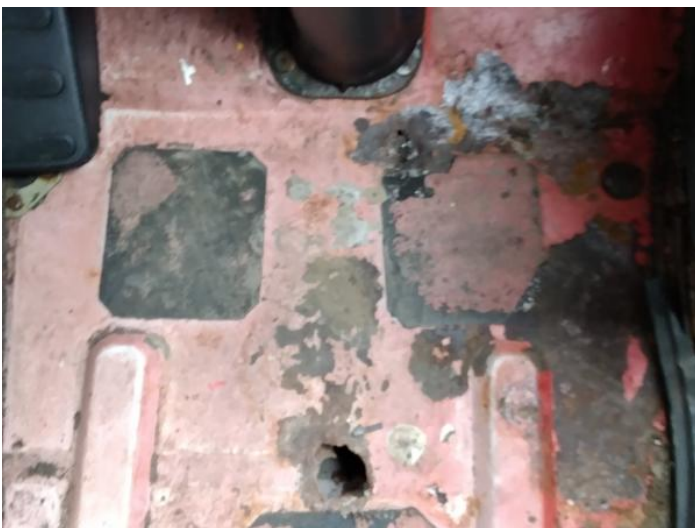
7: Carpets Front Missing Replace