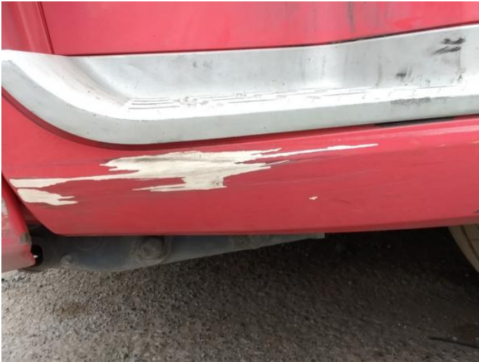
3: Moulding osf Wing Scuffed (Unpainted) Over 100mm