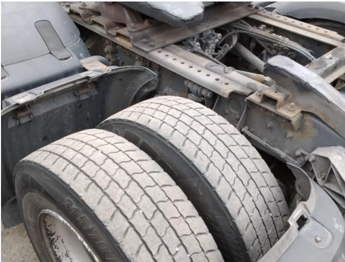
5: Qtr Panel osr Missing Replace