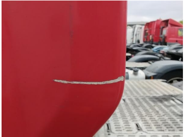
4: Panel Front Scratched Over 25mm Thru Paint