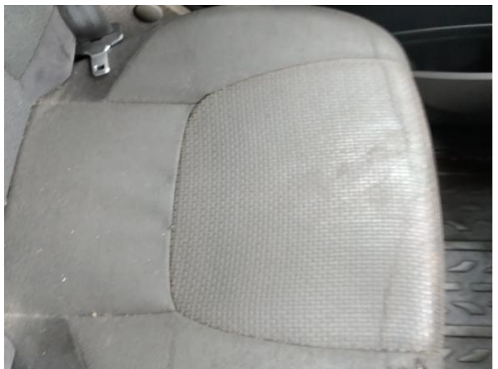
8: Seat Base Cover osf Holed Over 3mm