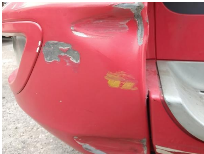
2: Bumper Front Dented With Paint Damage