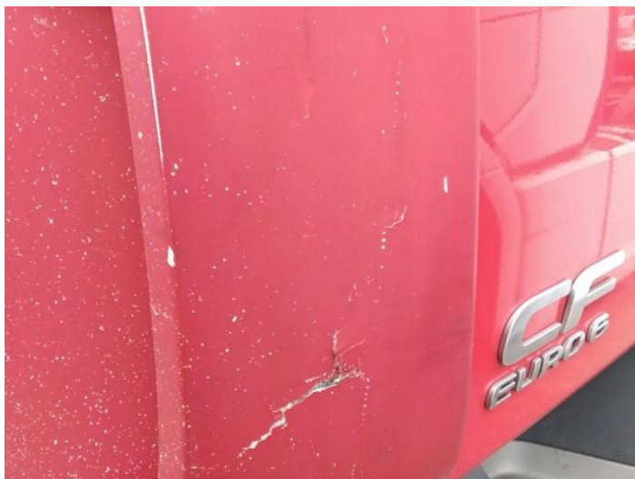
1: Panel Front Cracked Replace