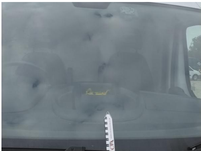
1: Screen Front Chipped UpTo 10mm