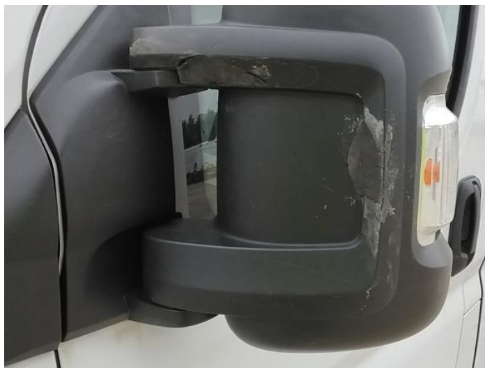
2: Door Mirror Assy nsf Broken Replace