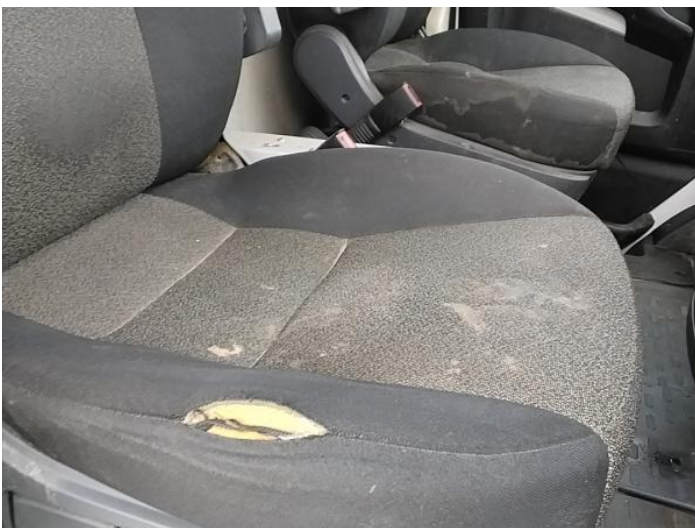
7: Seat Base Cover osf Holed Over 3mm