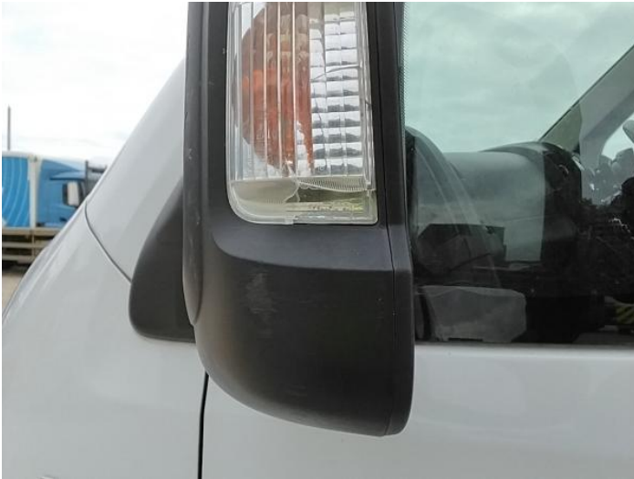
3: Door Mirror Assy nsf Broken Replace