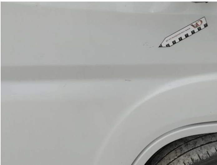
5: Door osf Scratched Over 25mm Not Thru Paint