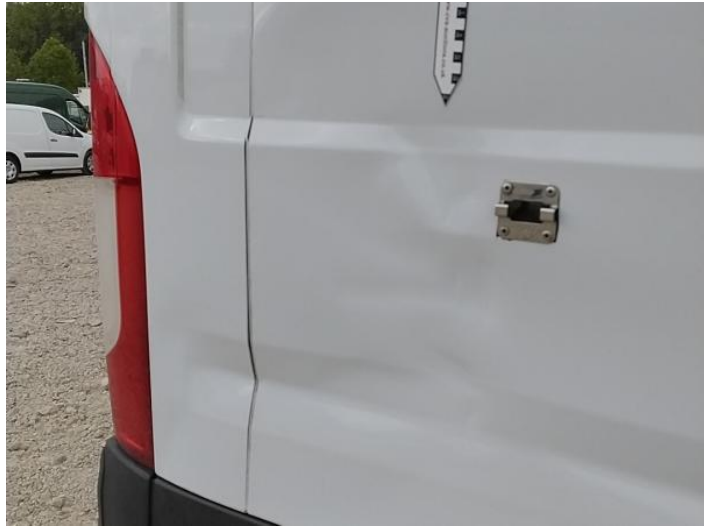
4: Qtr Panel osr Dented Over 30mm