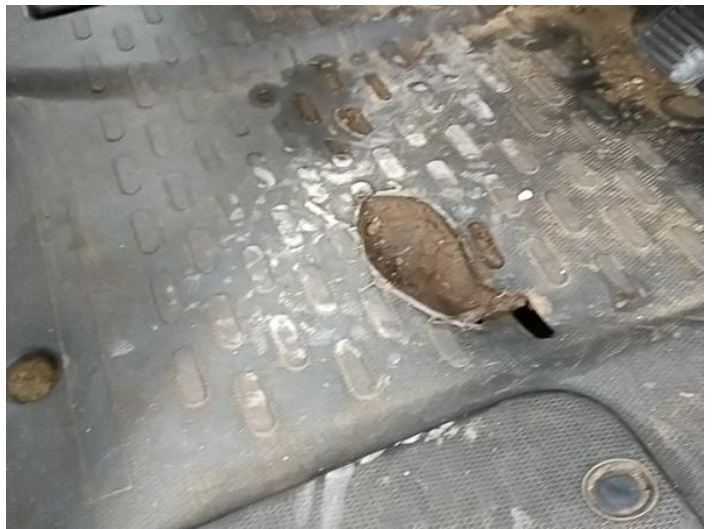
6: Carpets Front Holed Over 3mm