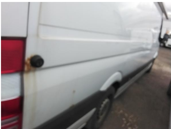
5: Qtr Panel osr Rusted Over 5mm