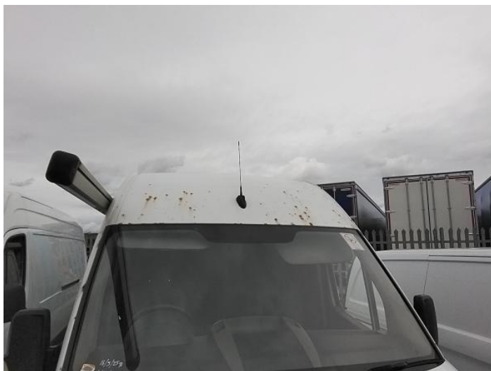
1: Roof Chipped Multiple Chips