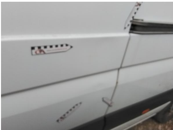
3: Qtr Panel nsr Dented Over 30mm