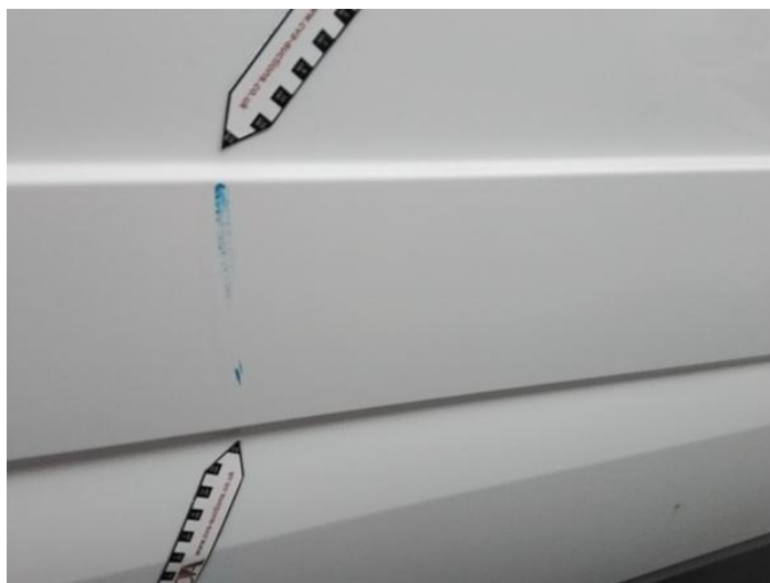
6: Qtr Panel Moulding os Scuffed (Unpainted) Over 100mm