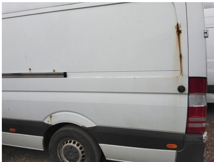
4: Qtr Panel nsr Rusted Over 5mm